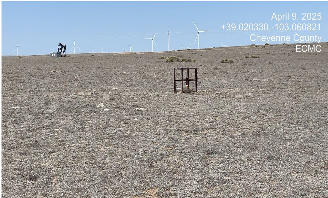
Photo 9. There is a pipe riser found approximately 500 ft. northwest of this abandoned wellsite.