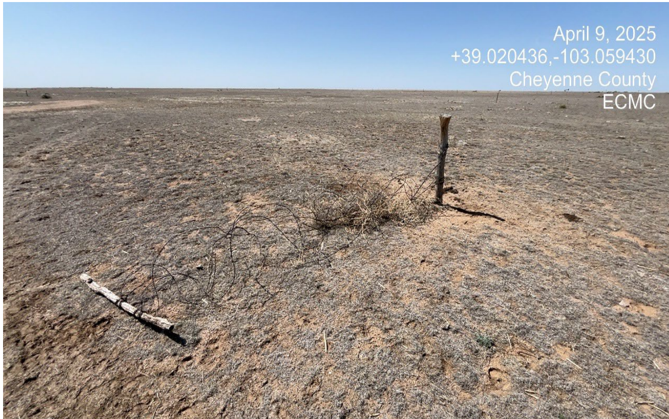
Photo 8. There is post and some wire that remain around the location that needs to be removed.