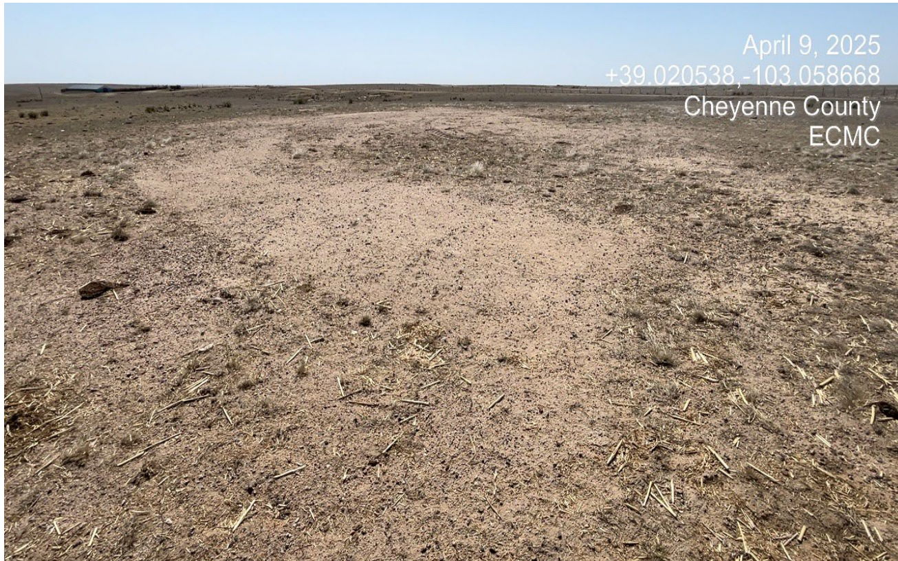
Photo 4. Facing south at the east side of the location former tank battery site. This area needs to be reclaimed and revegetated.