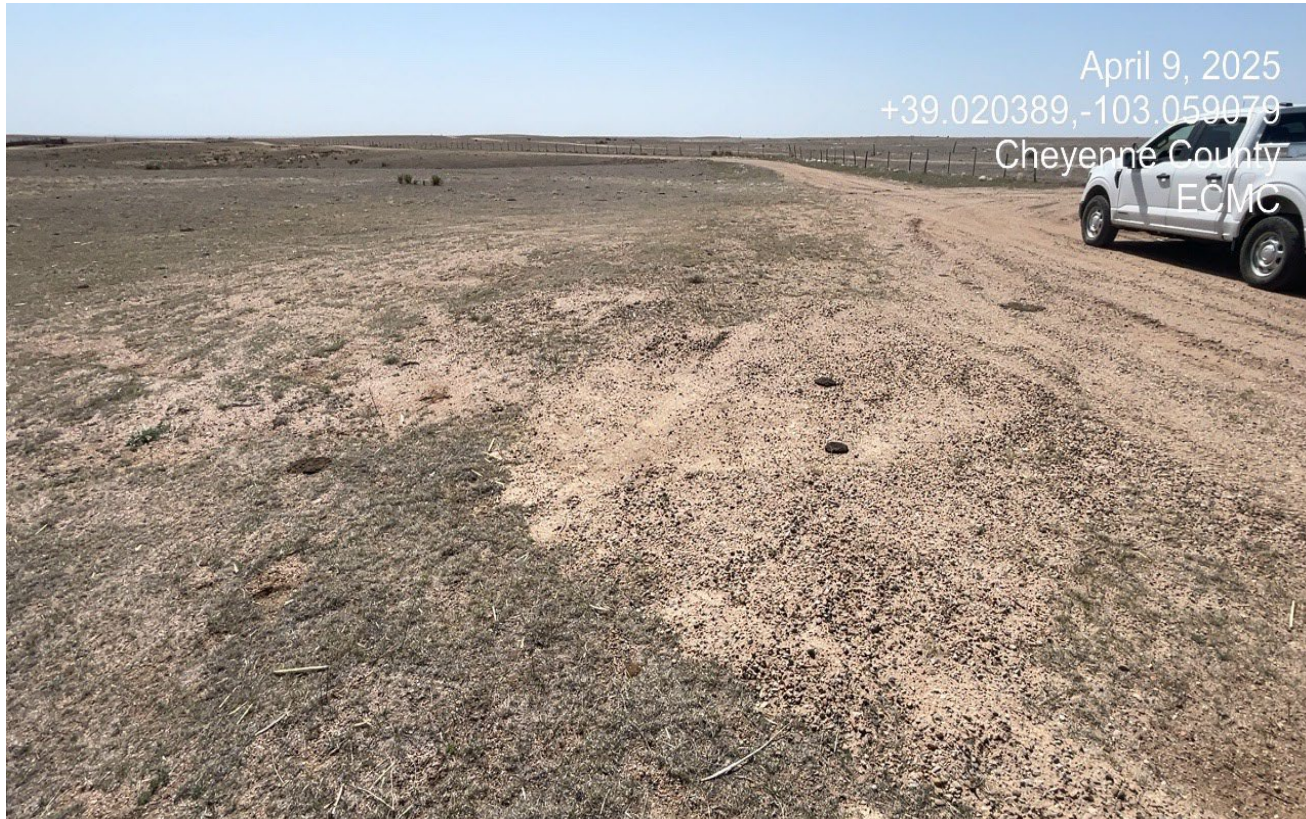
Photo 5. There is a small amount of gravel pile remains adjacent to the road that needs to be graded back on the road.