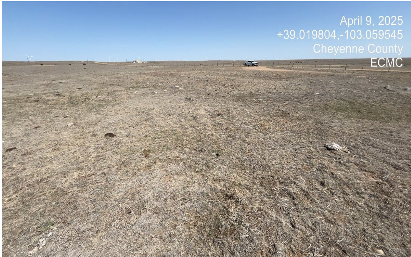
Photo 7. Facing northeast at the location. The native vegetation appears to be established at this area.