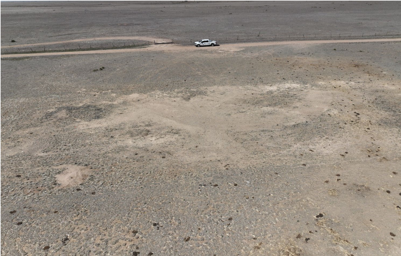
Photo 1. Drone arial photo facing west toward the offsite tank battery location.