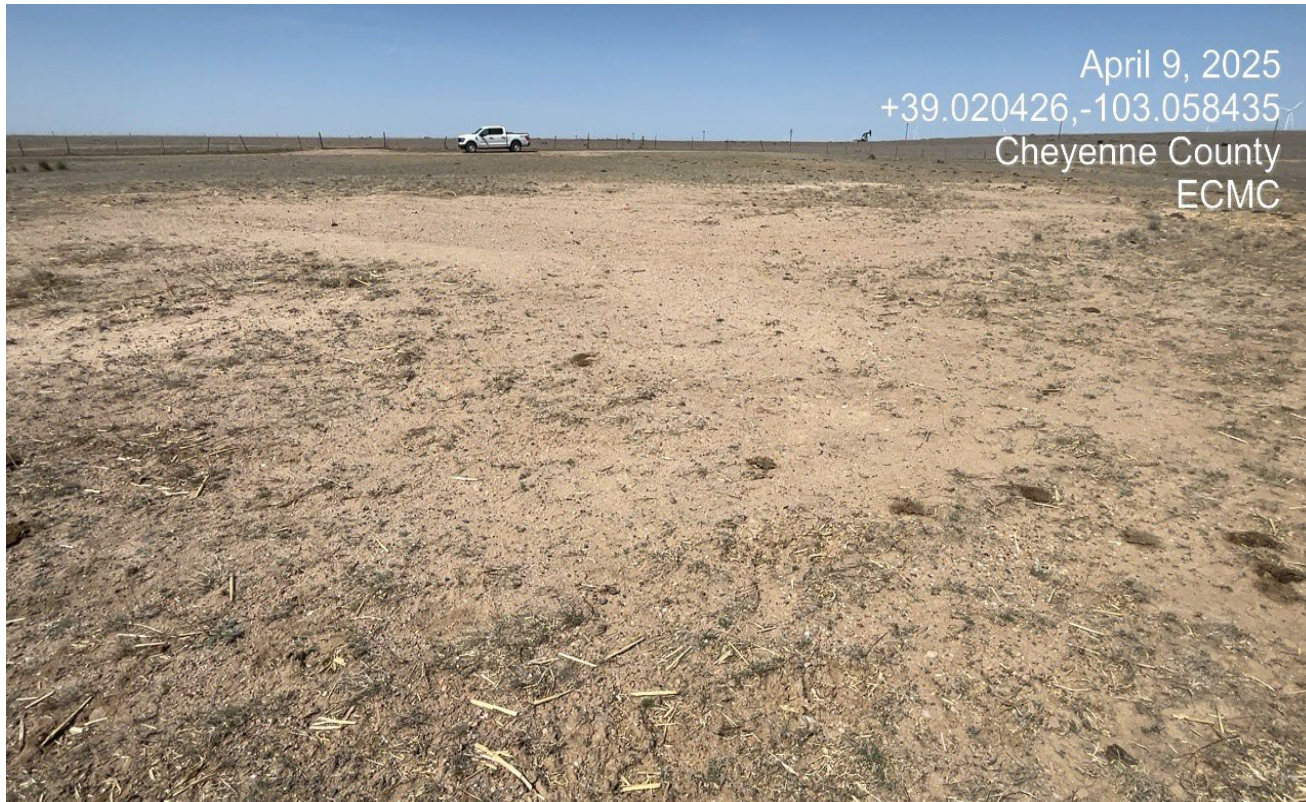
Photo 3. Facing west at the east side of the location former tank battery site. This area needs to be reclaimed and revegetated.