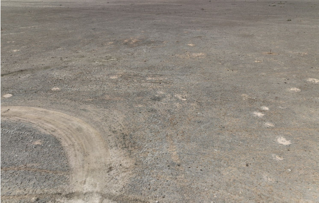
Photo 2. Drone aerial photo facing west toward the abandoned wellsite.