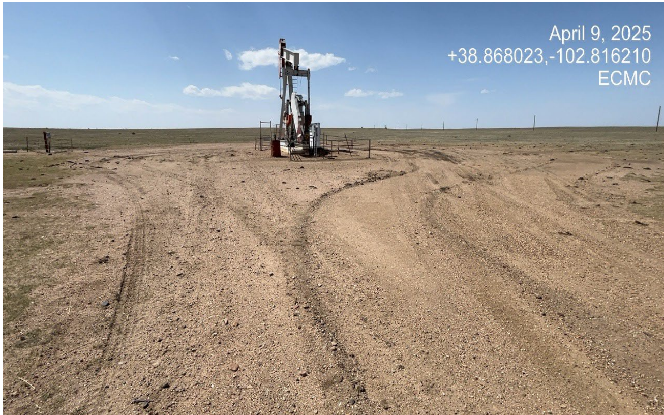
Photo 2. Facing west along the road toward the wellsite. There has been gravel spread along the area where erosion channel was previously observed.