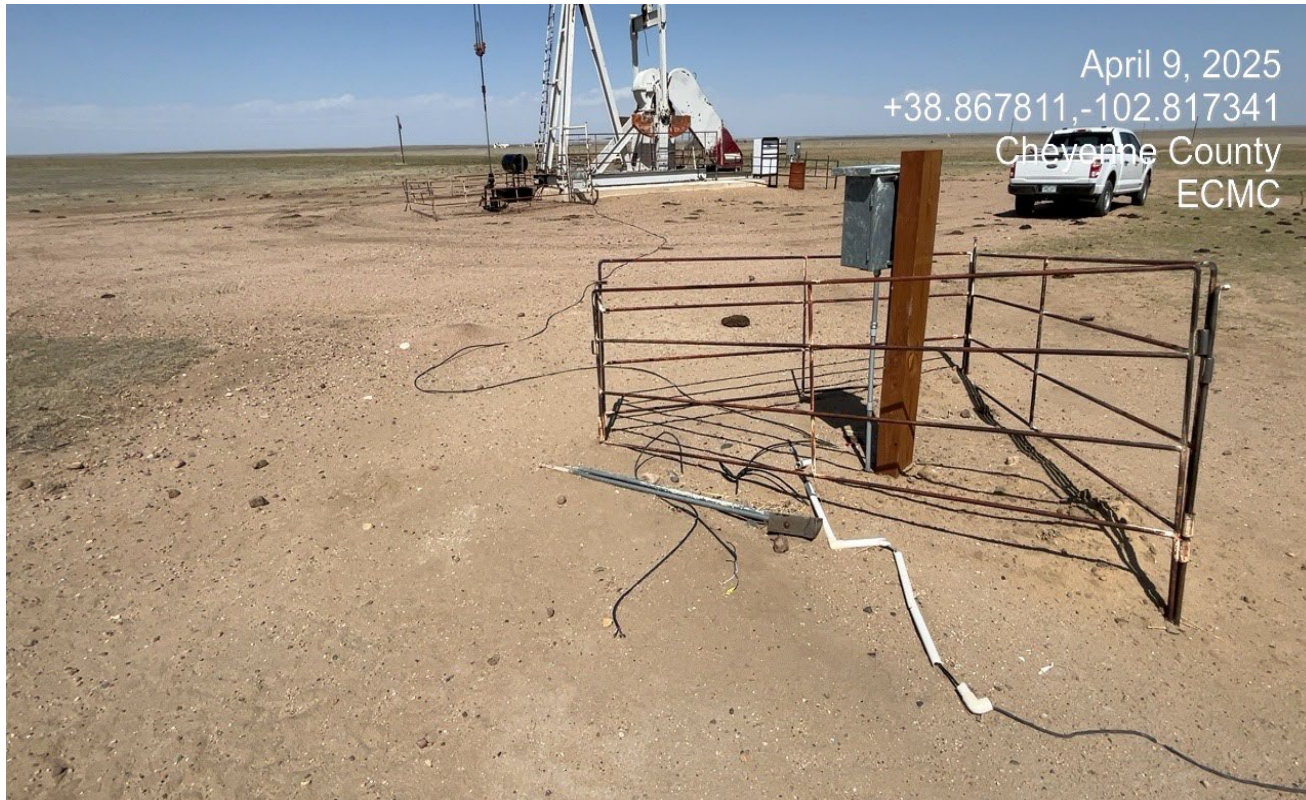
Photo 5. Facing toward the electric utility just south of the well. The electric utility was repaired but the wire and debris on the ground needs to be removed.