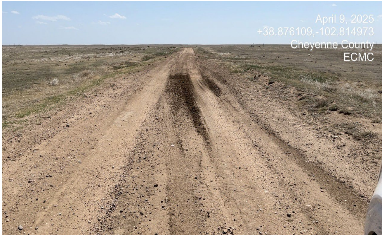
Photo 1. Facing south along the access road. Vehicles are causing unnecessary disturbance driving outside of the access road due to stormwater pooling on the road. The access road must be maintained and vehicles shall not drive outside of the access road boundary. Previous corrective action was not completed.