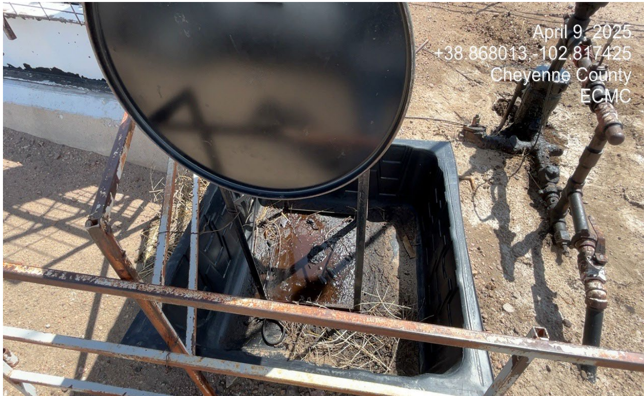
Photo 4. The chemical barrel has been repositioned into the secondary containment. There is oily fluids inside the containment and there are no wildlife protections to prevent entry.