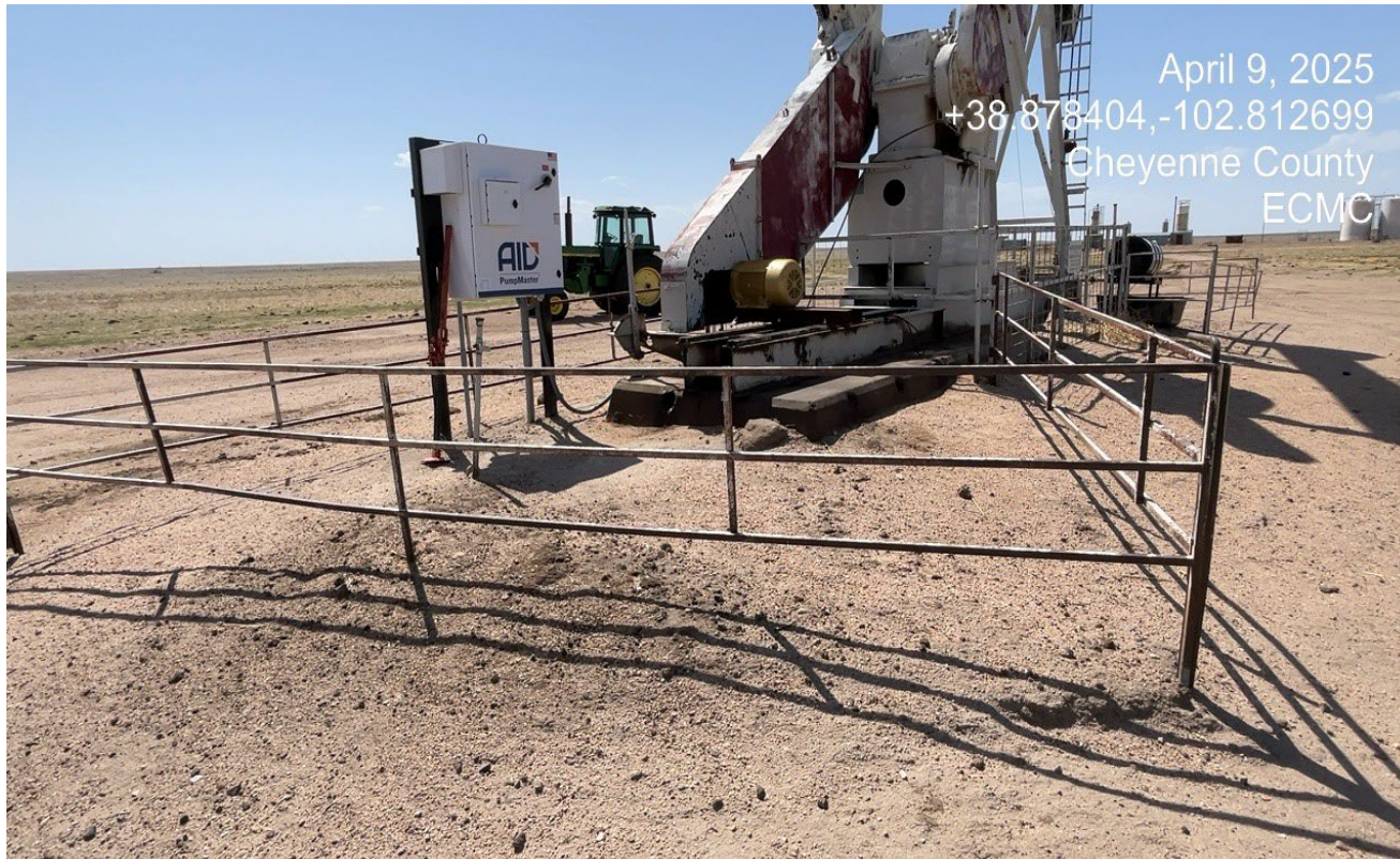
Photo 5. Facing toward the pumpjack. The engine has been replaced with an electric motor. It is unknown if oil saturated soils were cleaned up due to sand previously spread over this area.