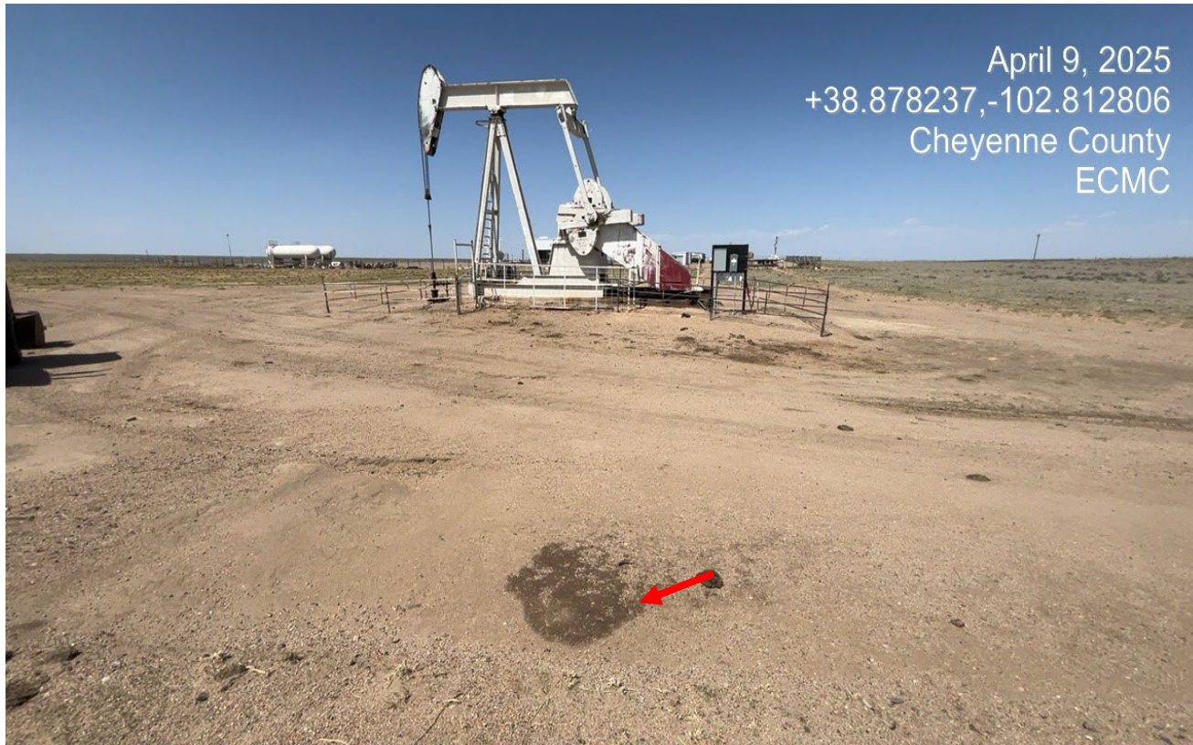
Photo 3. Facing northwest at the werllsite. There are oil stained soils shown at red arrow.