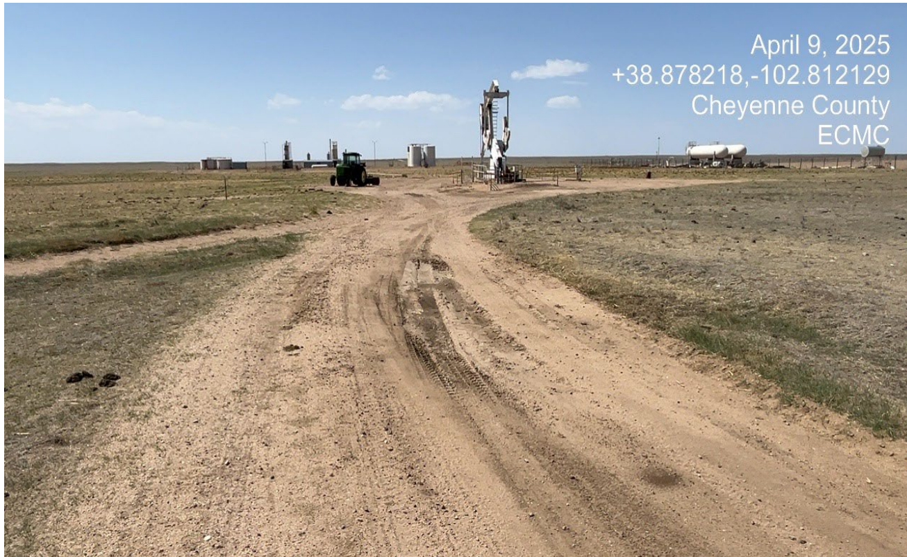
Photo 1. Facing west along the access road. Vehicles are causing unnecessary disturbance driving outside of the access road due to stormwater pooling on the road. The access road has not been repaired.