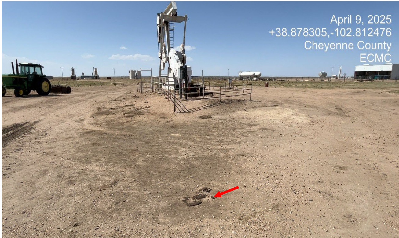
Photo 2. There are oily rags at shown at red arrow and stained soils. This must be removed and properly disposed. Previous CA was not completed.