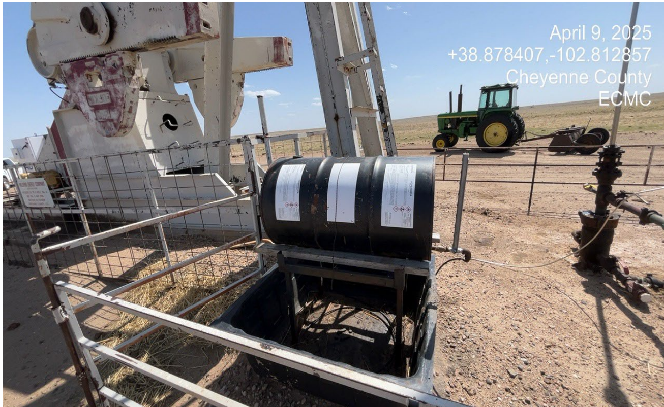
Photo 6. The labeling on the chemical barrel has been updated..