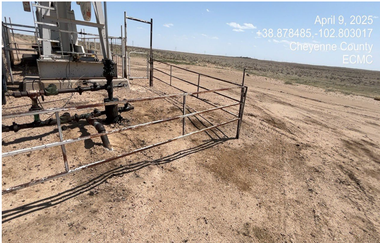
Photo 6. View of wellhead shows stained soils which were previously covered up with sand. Stained soils have not been cleaned up since the previous inspection.