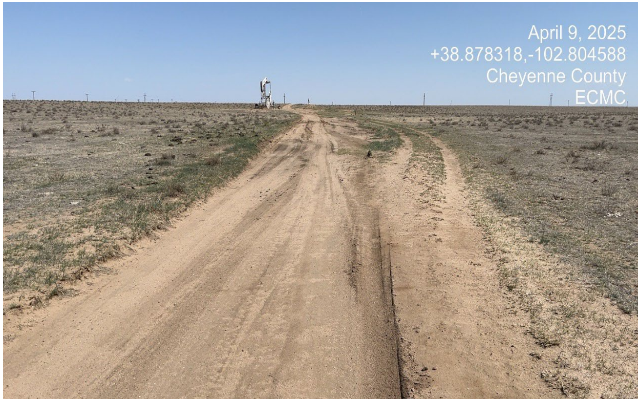
Photo 2. Facing east along the access road. Vehicles are causing unnecessary disturbance driving outside of the access road due to stormwater pooling on the road. The access road must be maintained and shall not drive outside of the access road boundary.