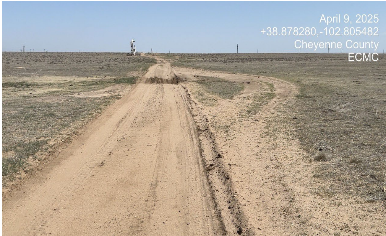
Photo 1. Facing east along the access road. Vehicles are causing unnecessary disturbance driving outside of the access road due to stormwater pooling on the road. The access road must be maintained and shall not drive outside of the access road boundary.