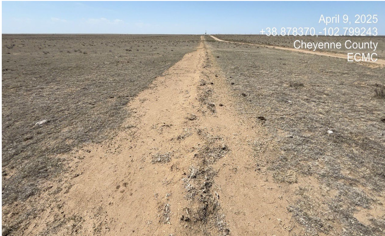
Photo 9. There has been new disturbance from a buried electric line to service the new electric motor at the pumpjack. The disturbed area will need to be reclaimed. Previous corrective action was not completed.