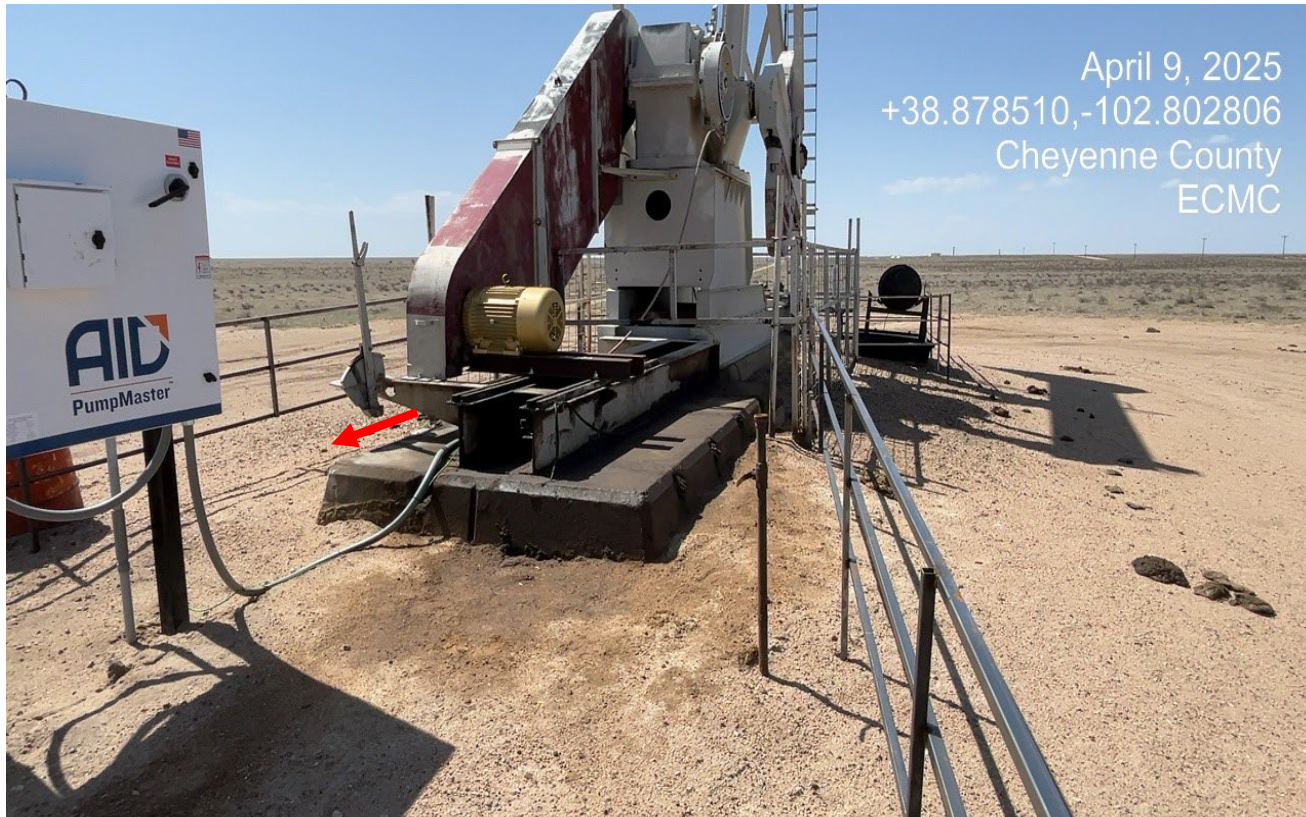
Photo 7. There are still oil stained soils at the pumpjack that have not been cleaned up. Previous corrective action was not completed.