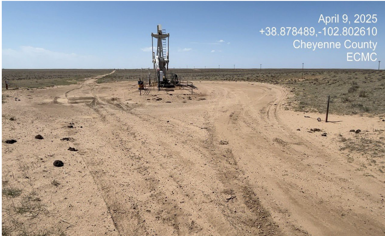
Photo 8. Facing west toward the wellsite.