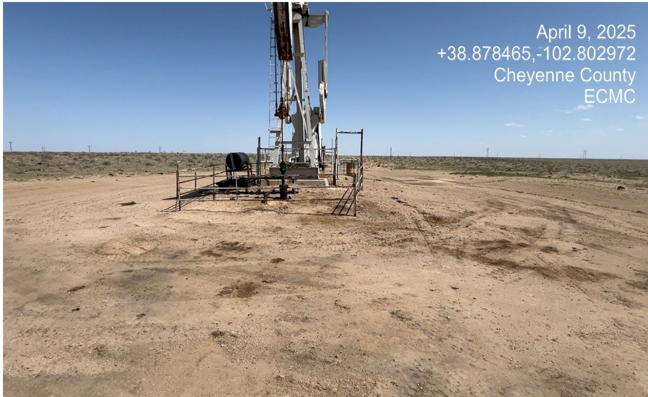
Photo 5. Facing east toward the wellhead. There are oil stained soils which have not been cleaned up since the previous inspection.