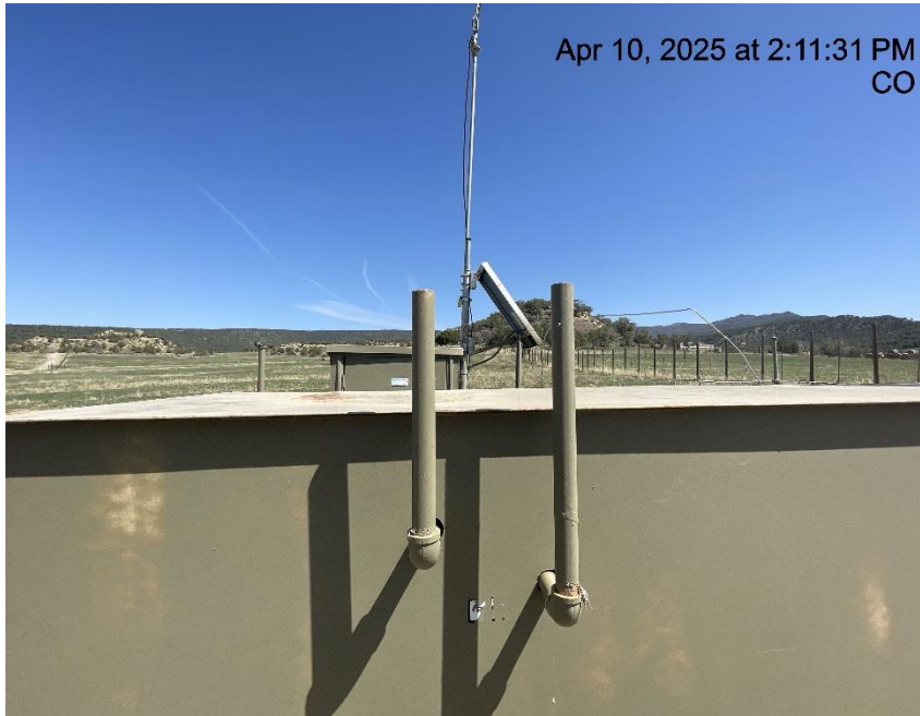
Photo # 482 PRV & rupture disc vent lines do not comply with CECMC pressure safety device rules