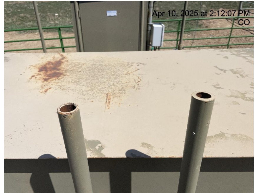
Photo # 483 PRV & rupture disc vent lines do not comply with CECMC pressure safety device rules