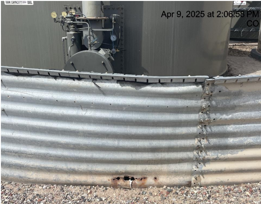
Photo # 9798 Secondary containment metal tank ring rusted /damaged & needs maintenance