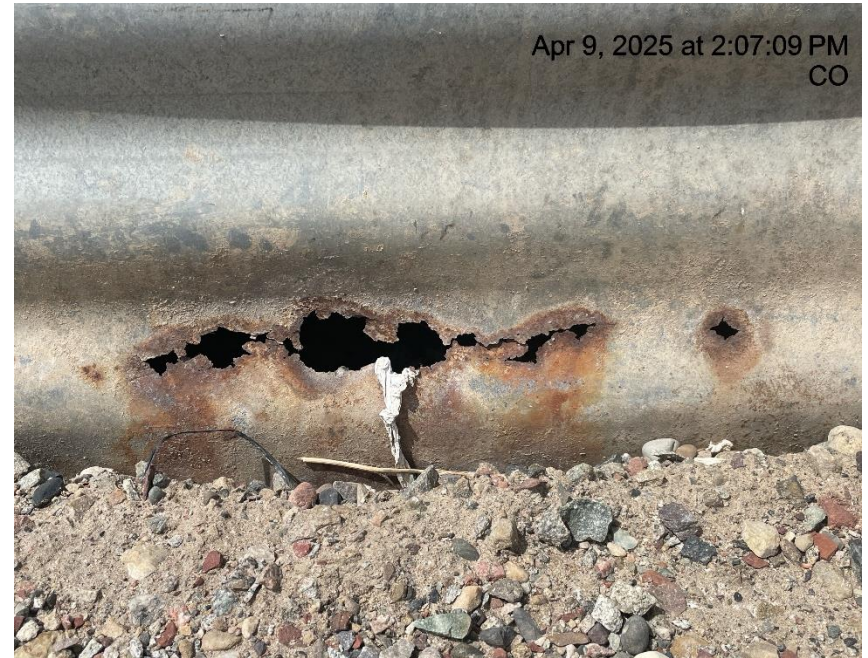
Photo # 9799 Secondary containment metal tank ring rusted /damaged & needs maintenance