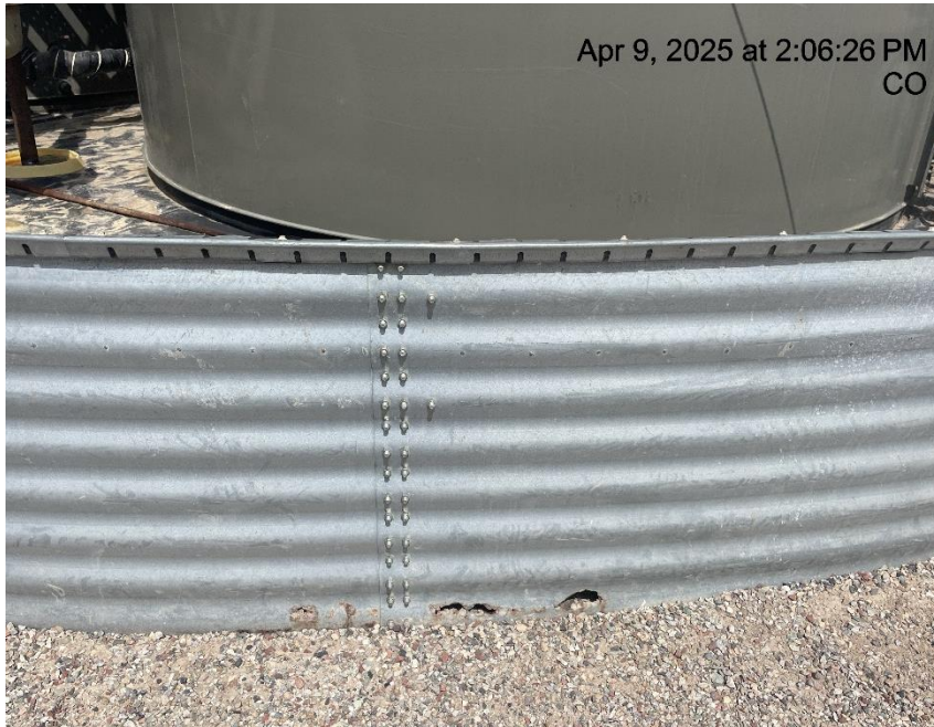
Photo # 9796 Secondary containment metal tank ring rusted /damaged & needs maintenance