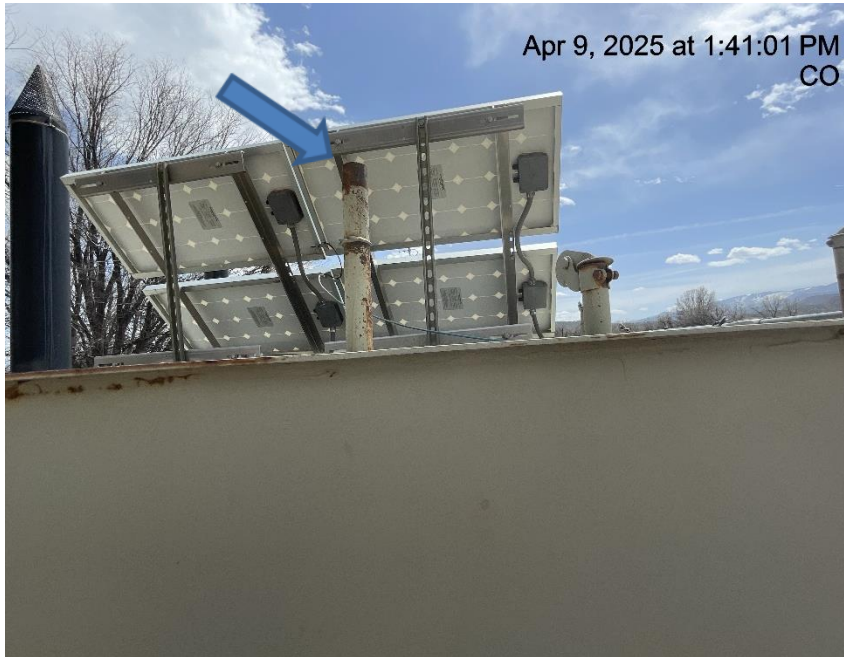
Photo # 9792 PRV vent line does not comply with CECMC pressure safety device rules