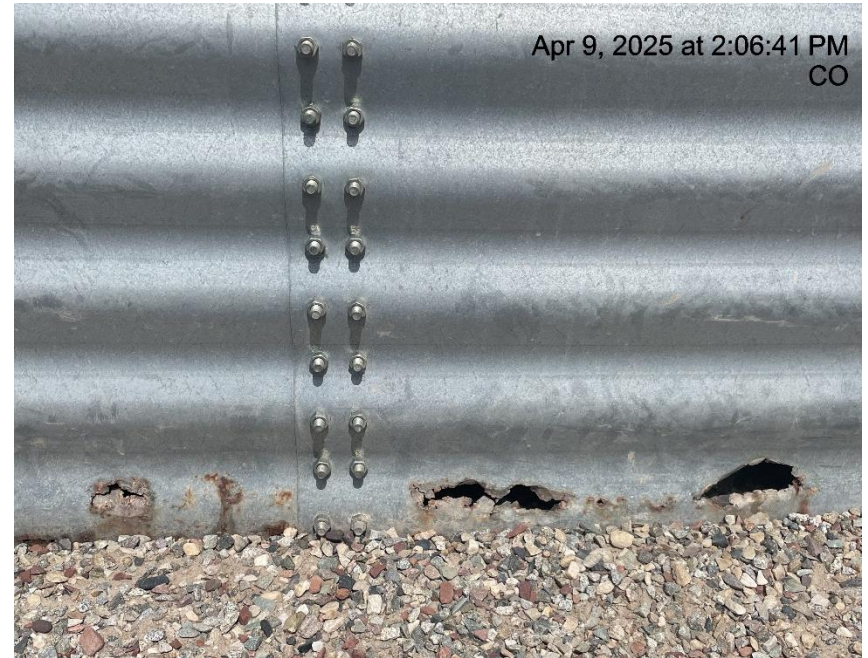
Photo # 9797 Secondary containment metal tank ring rusted /damaged & needs maintenance