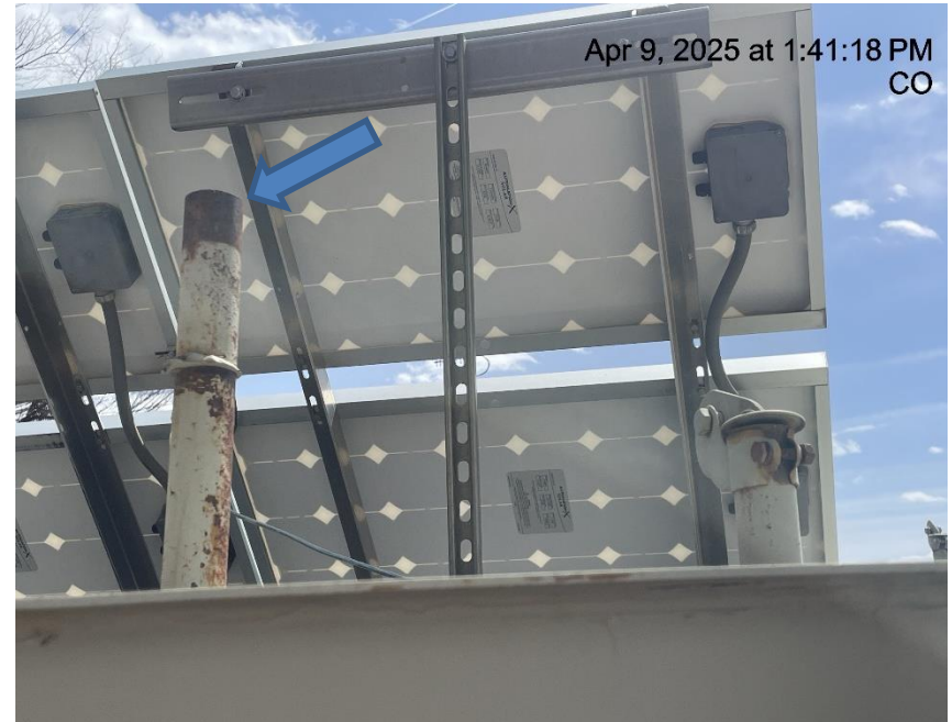
Photo # 9793 PRV vent line does not comply with CECMC pressure safety device rules