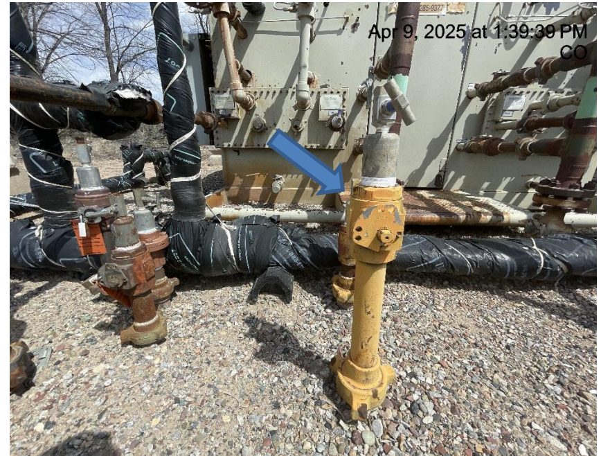
Photo # 9791 Unused flowline at separators lacks lockout tagout (OOSLAT)