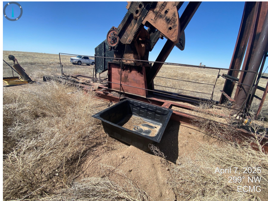
Photos 29 & 30. Stained soil and unused equipment at well location.