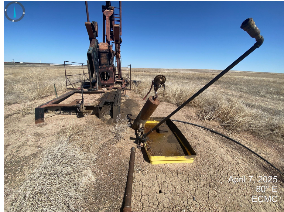
Photos 27 & 28. Unused equipment observed at well location.