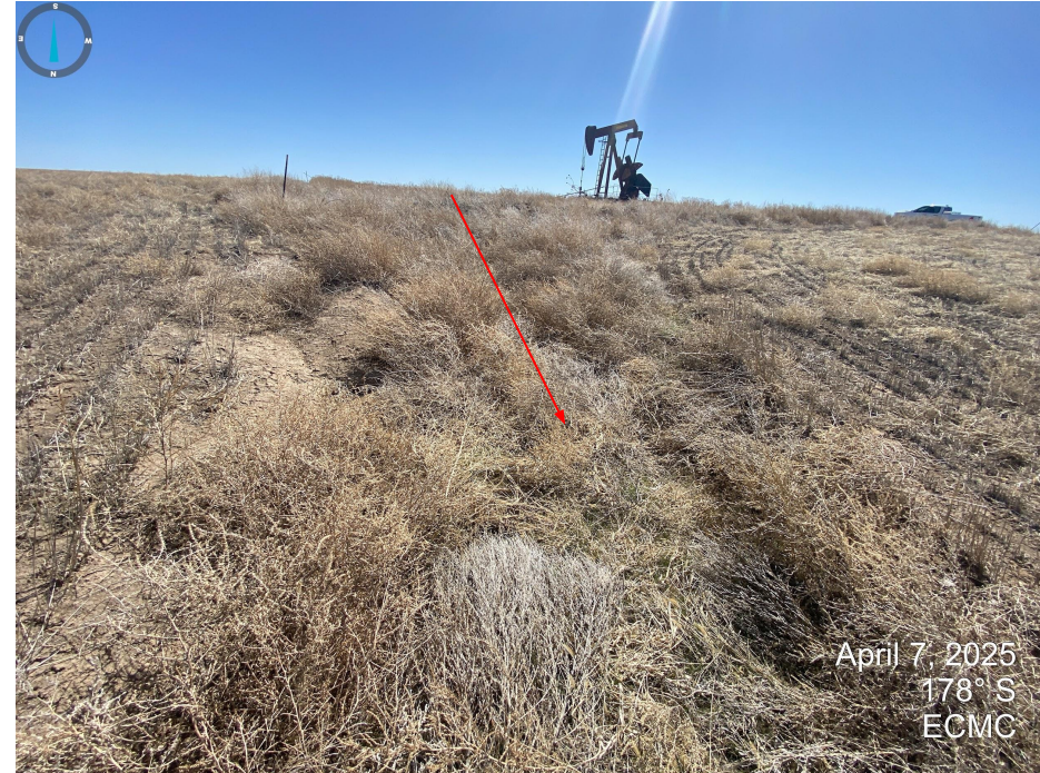
Photos 25 & 26. Erosion degradation observed on the northeast portion of the well location. Gullying obscured by undesirable vegetation.