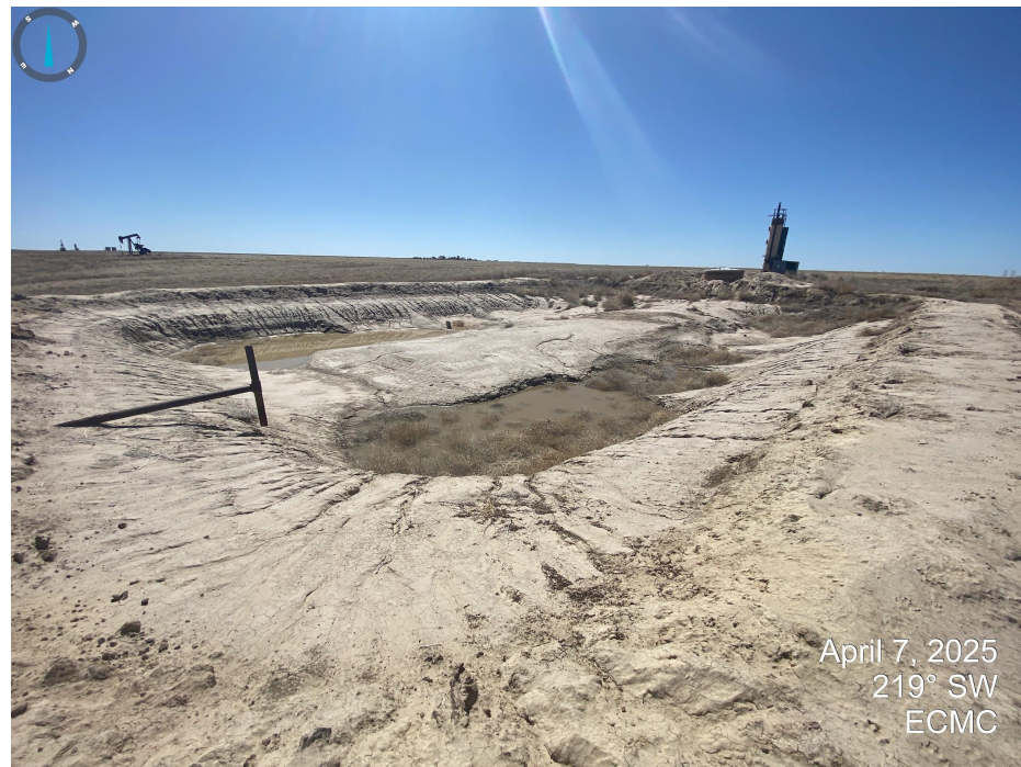
Photos 15 & 16. Unstabilized soils and erosion degradation evident at pits. Undesirable vegetation observed throughout pits.