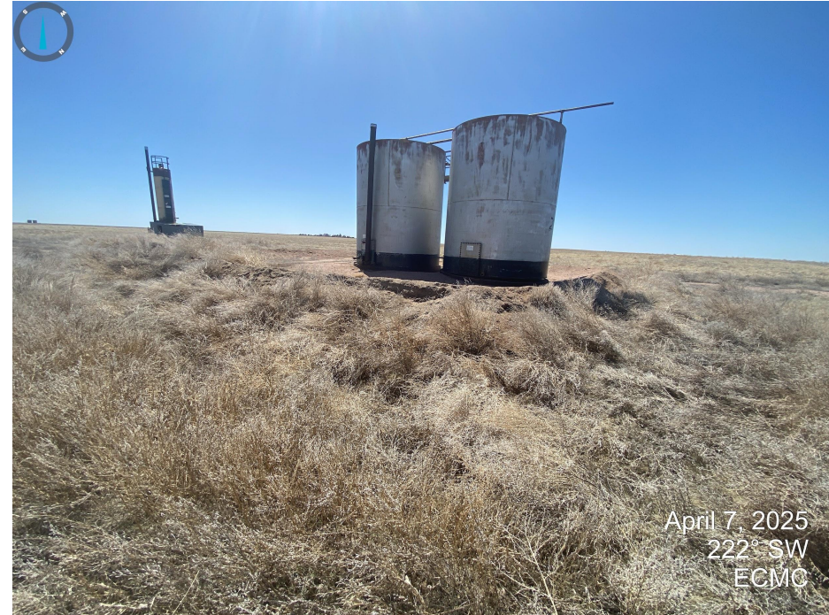
Photos 3 & 4. Undesirable vegetation around tank battery.