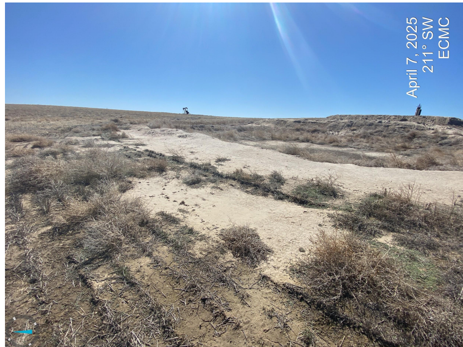
Photos 17 & 18. Sediment migration and erosion degradation observed at the unstabilized pit berms.