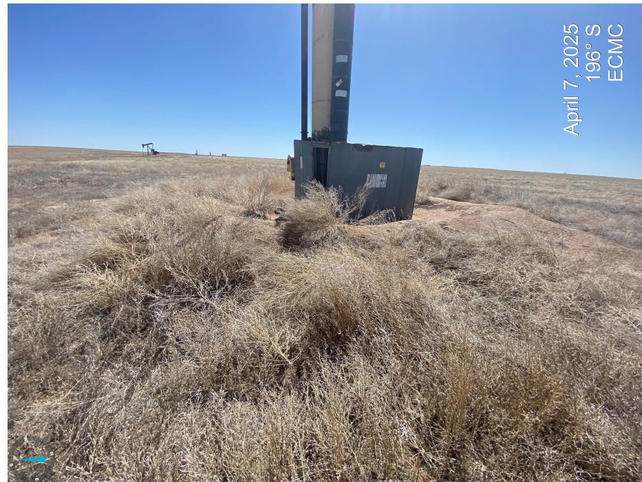
Photos 7 & 8. Stained soil at tank battery (Photo 7; left) and undesirable vegetation at separator (Photo 8; right).