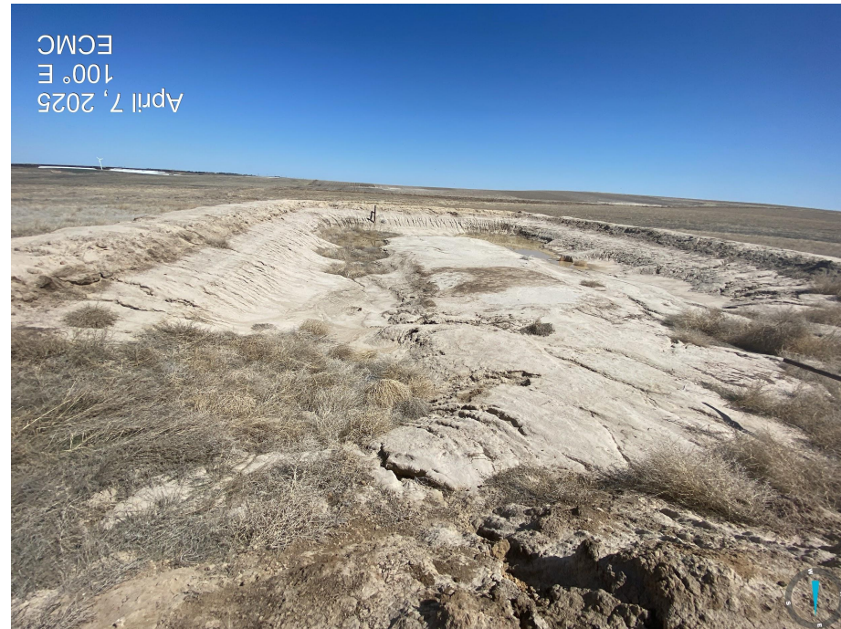
Photos 13 & 14. Unstabilized soils and erosion degradation evident at pits. Undesirable vegetation observed throughout pits.