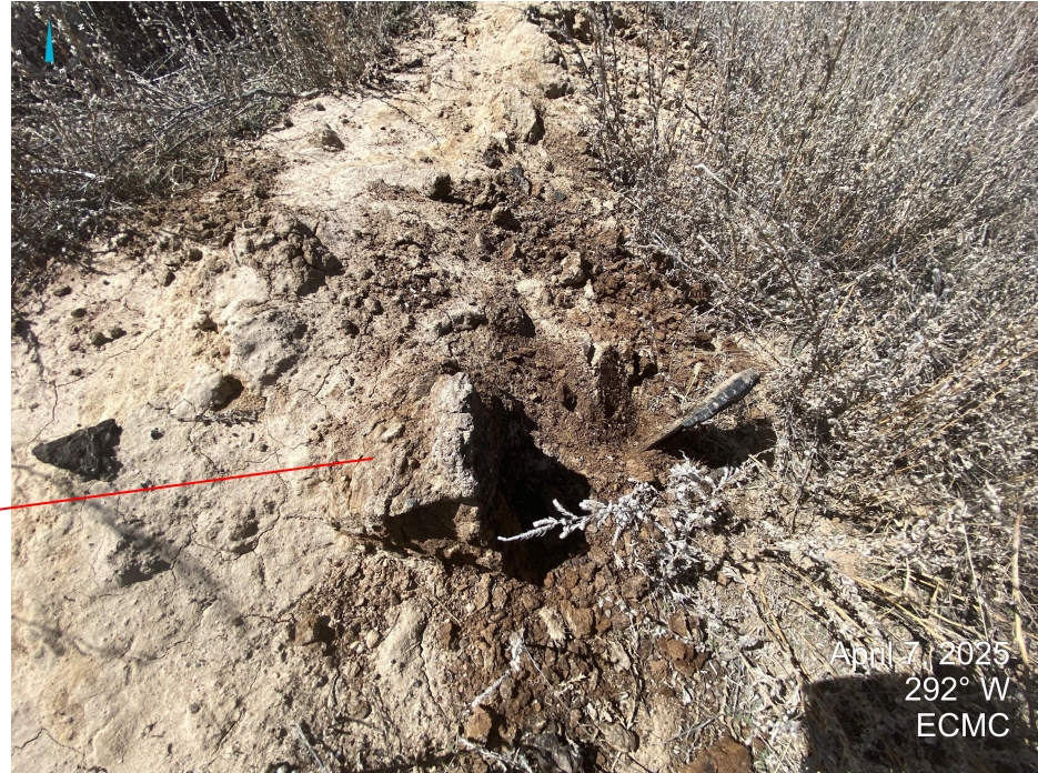
Photos 5 & 6. Stained soils observed near tank battery.