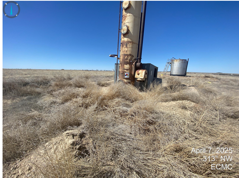
Photos 9 & 10. Undesirable vegetation and open excavation with no fencing observed near the separator (Photo 9; left).