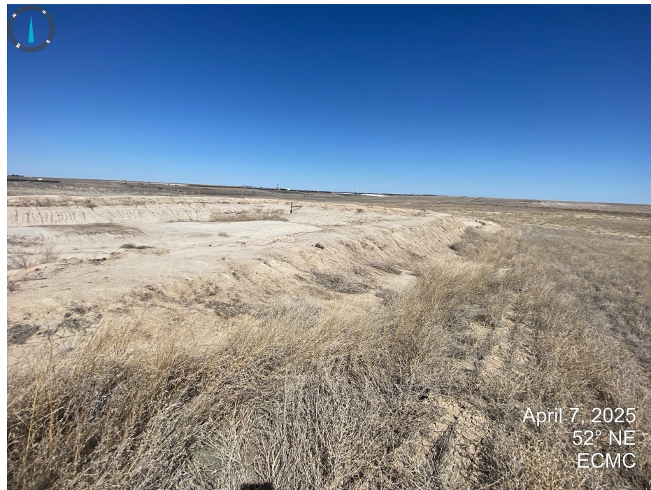
Photos 19 & 20. Undesirable vegetation, sediment migration and erosion degradation observed at the unstabilized pit berms.