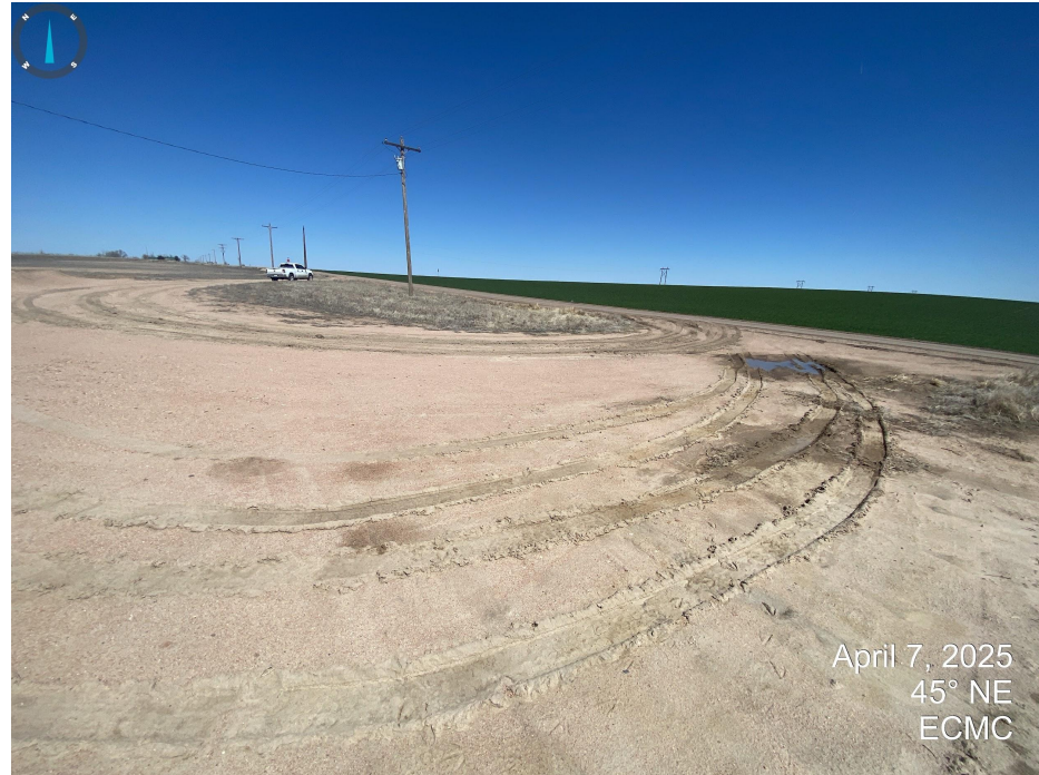
Photos 3 & 4. Maintenance advised on access points/production areas.