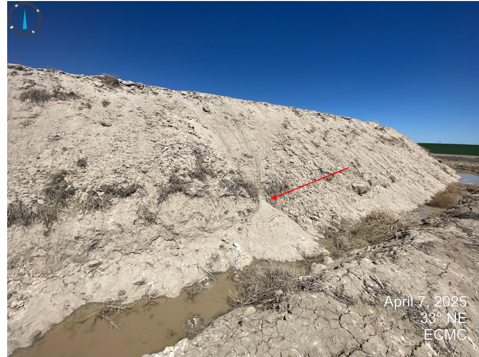
Photos 9 & 10. Evidence of erosion degradation observed at the pit walls.