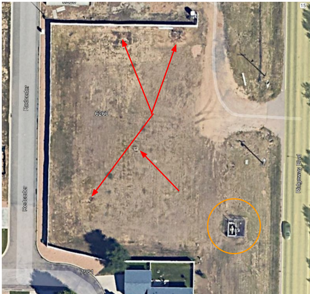
Photo 1. Google Earth aerial imagery illustrates risers/pipe that remain that all appear to be owned and operated by KPK (red arrows). Orange circle was DCP midstream equipment that has been taken over by KPK.