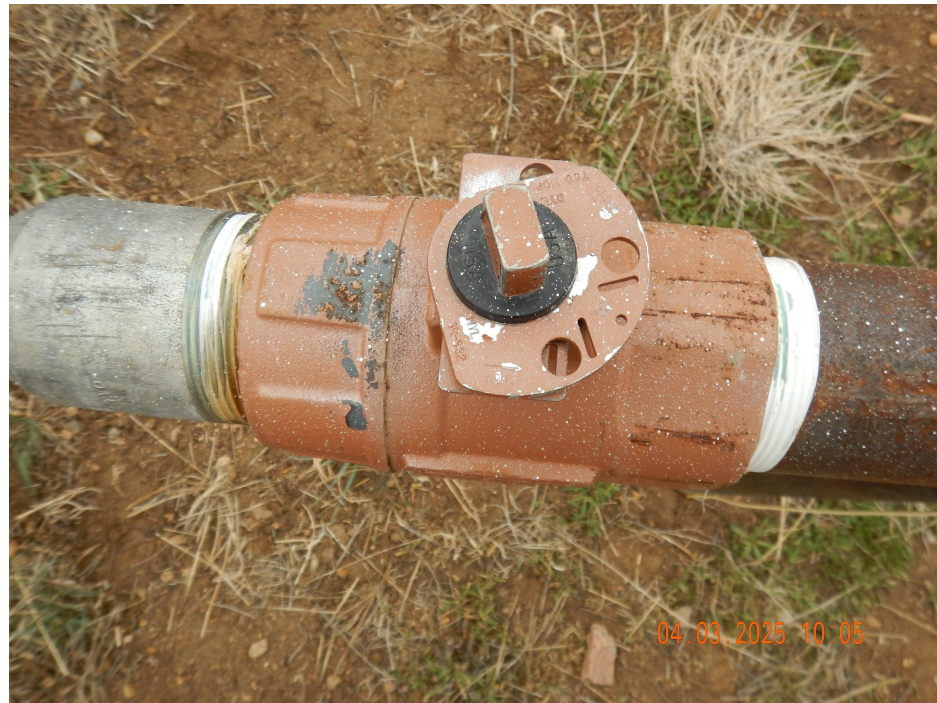
Photo 5. Photo taken from the northeastern riser. See comments under Photo 2.