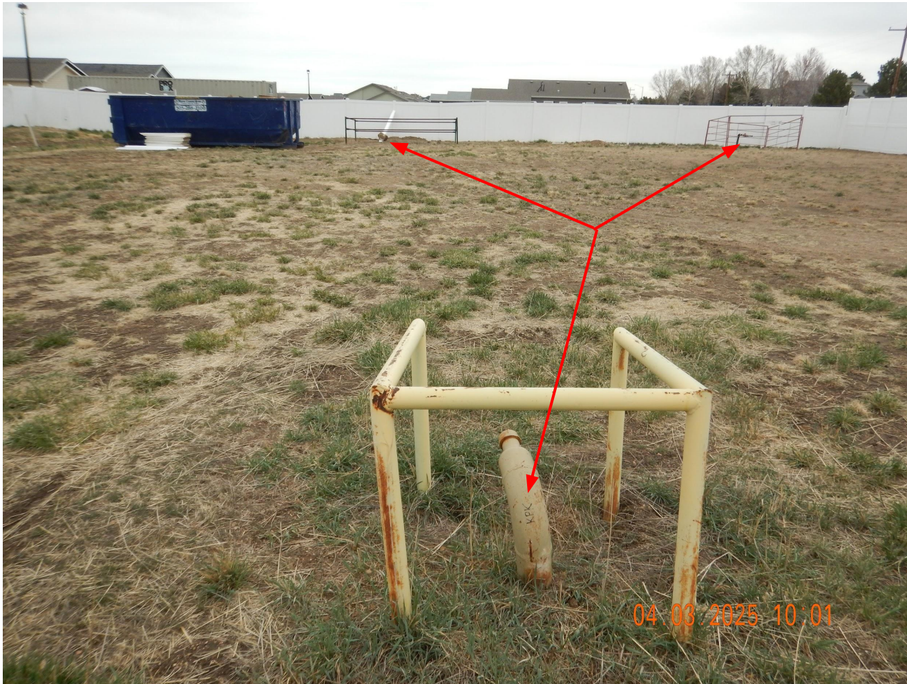
Photo 2. Photo taken from the location, facing North. Photo illustrates risers that remain all appear to be owned and operated by KPK. KPK signage was observed at the northeastern riser, northwestern risers have been confirmed by KPK and the yellow riser has KPK written on it.