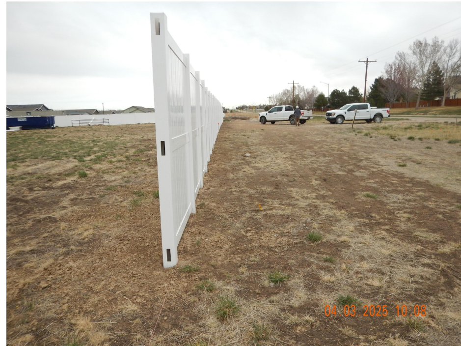
Photo 8. Photo taken from the eastern location, facing North. Photo illustrates a fence installed by housing development since the previous inspection.