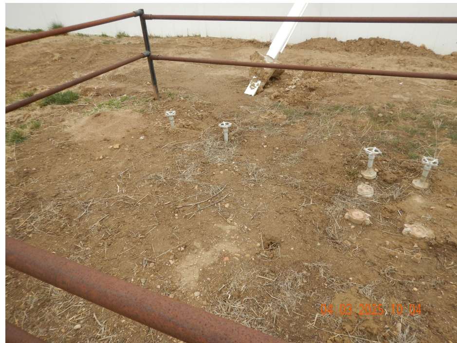
Photo 4. Photo taken from the northwestern risers. See comments under Photo 2.