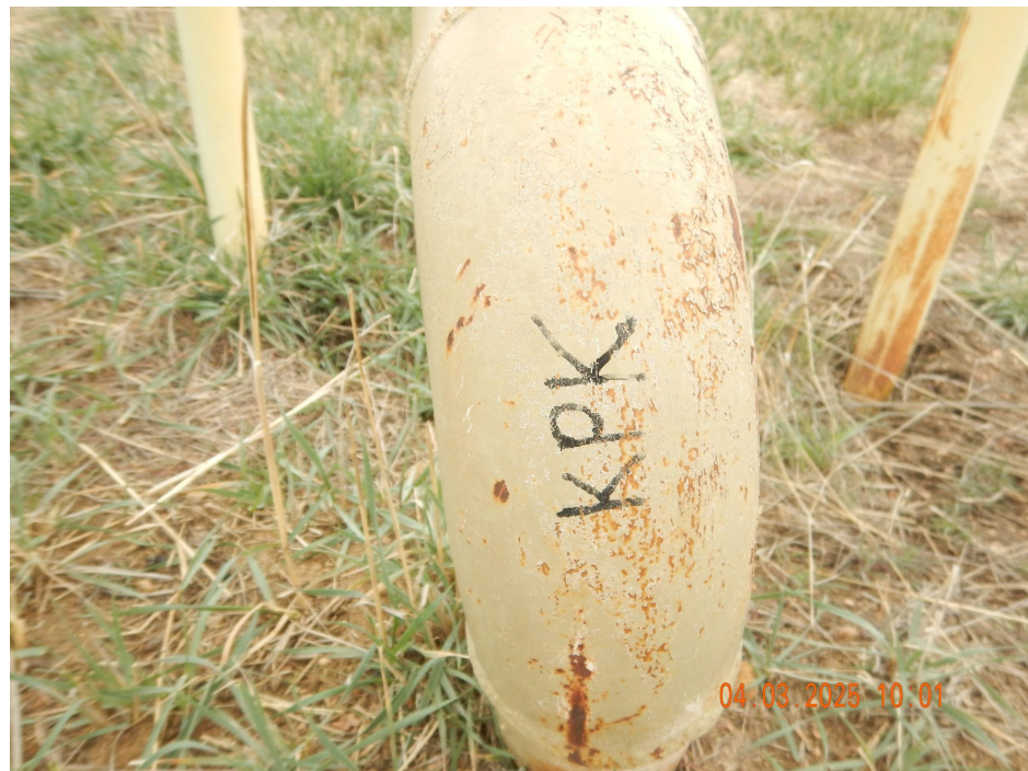
Photo 3. Photo taken of the yellow riser. See comments under Photo 2.