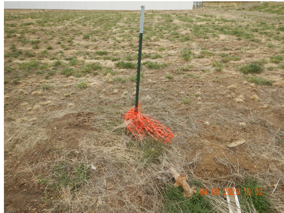
Photo 6. Photo taken from the southwestern pipe. See comments under Photo 2.