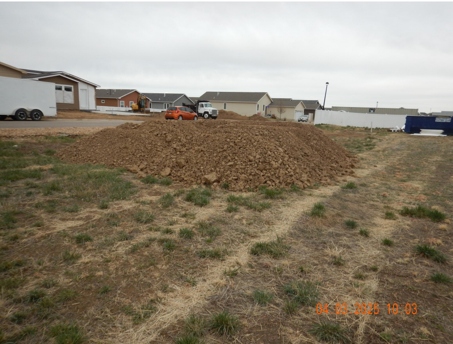
Photo 7. Photo taken from the western location, facing North. Photo illustrates housing development activity at the location.