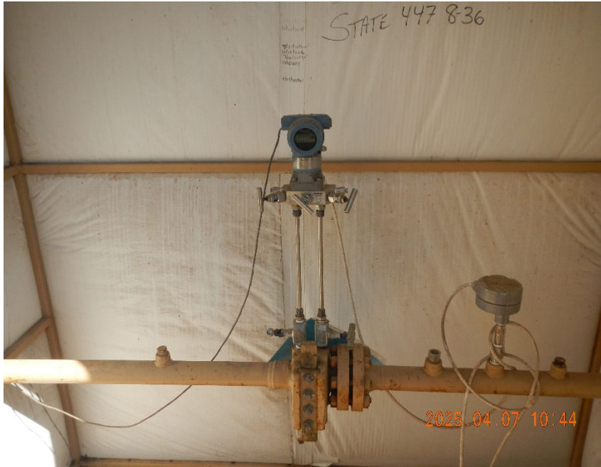
5. Gas meter inside meter shed.