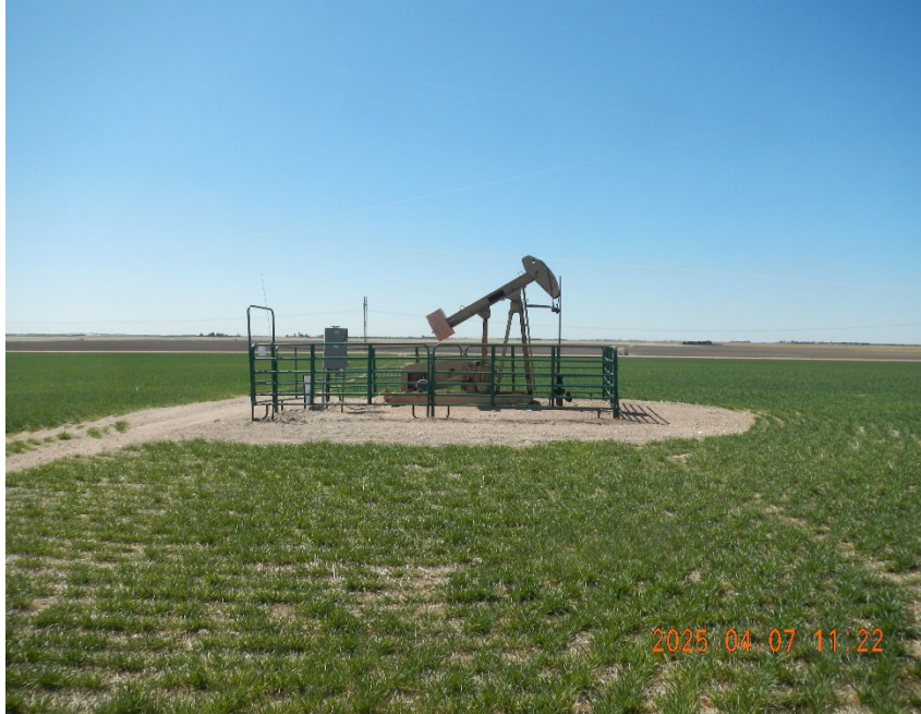
3. Well location overview.