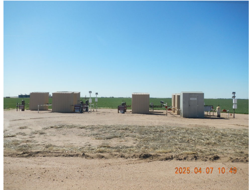
6. Gathering location overview.