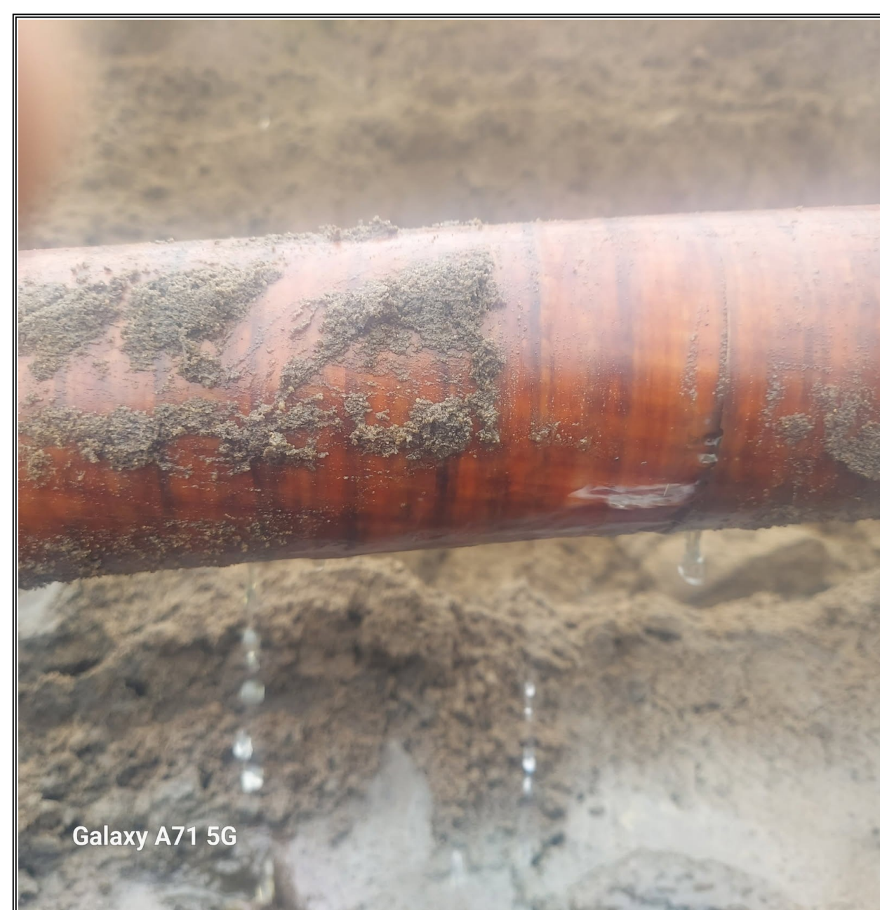
Galaxy A71 5G