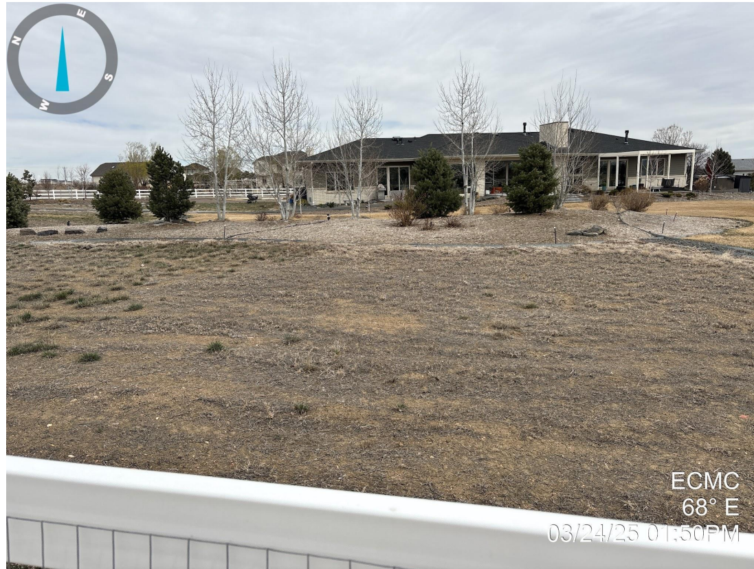
Photo 3. Photo taken of the well location, facing East. Photo illustrates that the location is now contained within a land use change to a residential property.