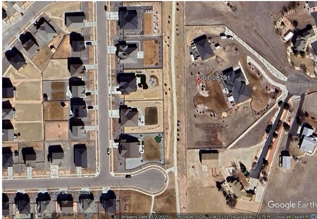
Photo 2. Google Earth aerial imagery from March 2, 2025. Photo illustrates the well location and access road after plugging operations. Photo illustrates that the location is now contained within a land use change to a residential area.