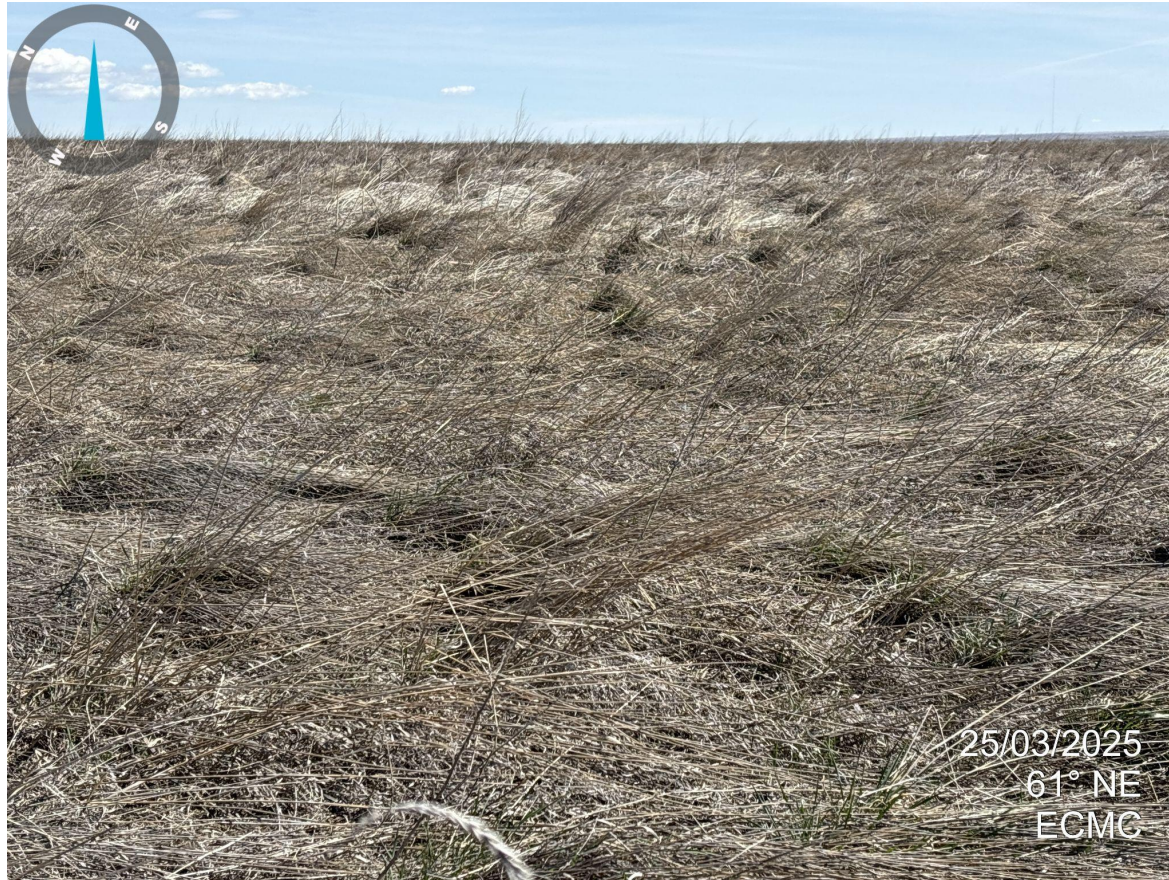
Photo 7. Reference vegetation to the east of well location.