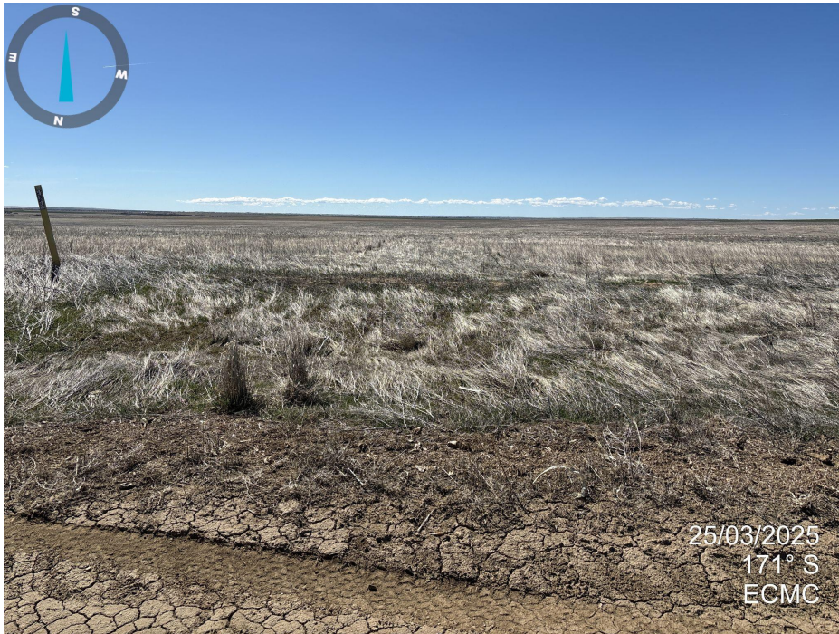
Photo 1. Looking south down former access road. A large amount of list C noxious weed Downy Brome is present on access road. Desirable perennial vegetation has established on the access road and appears to be progressing towards 80% of reference area coverage.