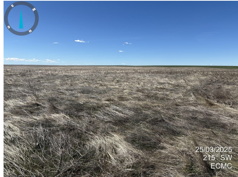
Photo 2. Looking southwest across the well location. All oil and gas equipment has been removed. Densely covered in Downy Brome. Desirable vegetation is present throughout the site and appears to be progressing towards 80% vegetation coverage.