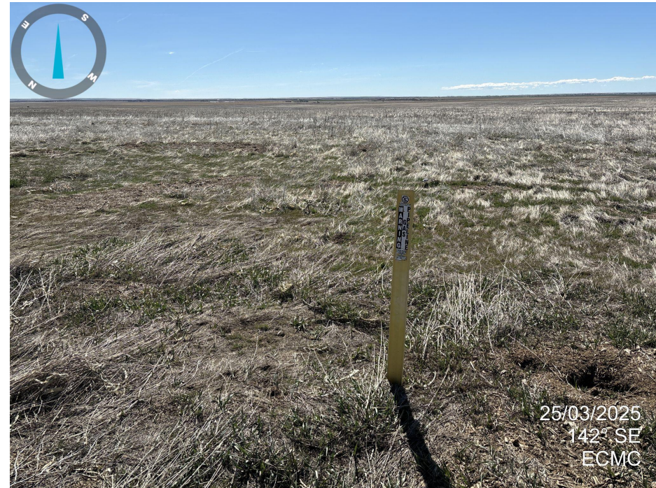
Photo 6. Looking southeast across flowline junction area. A sign marked gas pipeline. No other oil and gas equipment remains.