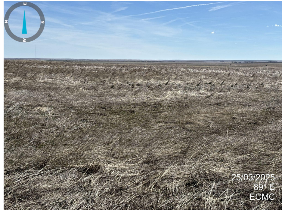
Photo 4. Looking east from wellbore. See photo 2 comments.