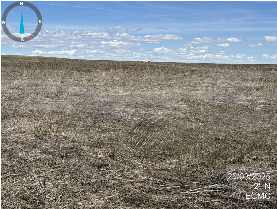
Photo 3. Looking looking north from wellbore across location. See photo 2 comments.