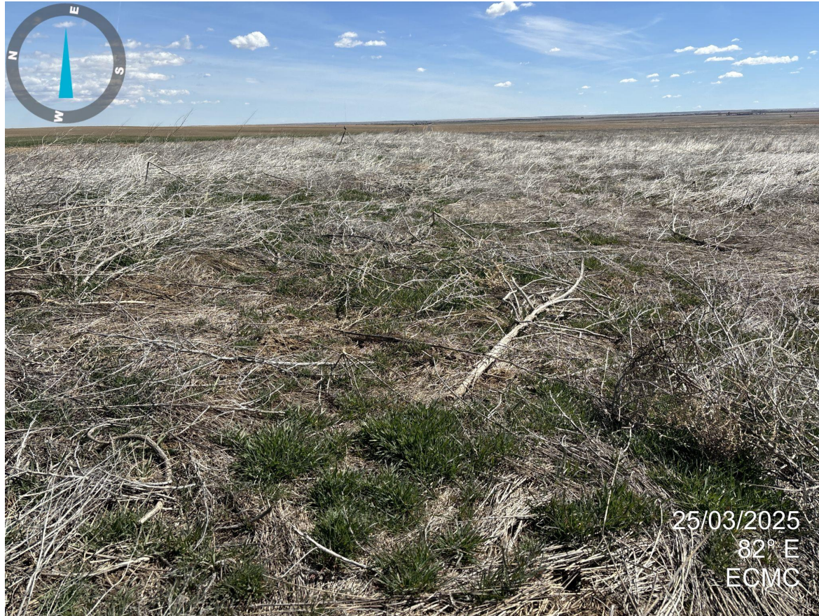
Photo 5. Reference vegetation to the east of well location. Vegetation near the road is lower quality and primarily Downy Brome though some desirable vegetation is present such as Smooth Brome.