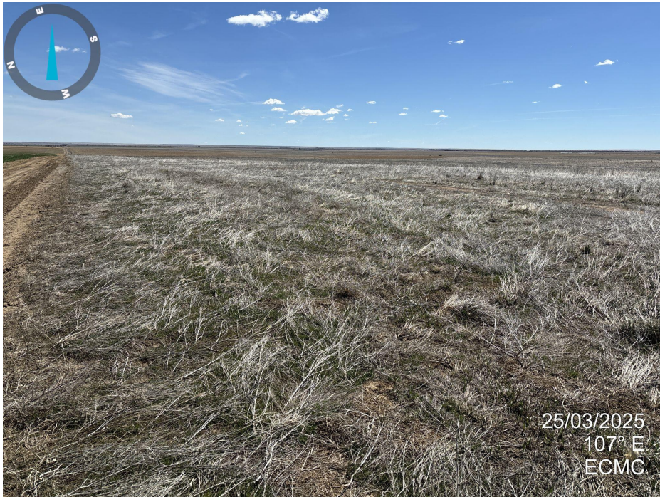
Photo 1. Looking southeast across tank battery location. No oil and gas equipment remains.