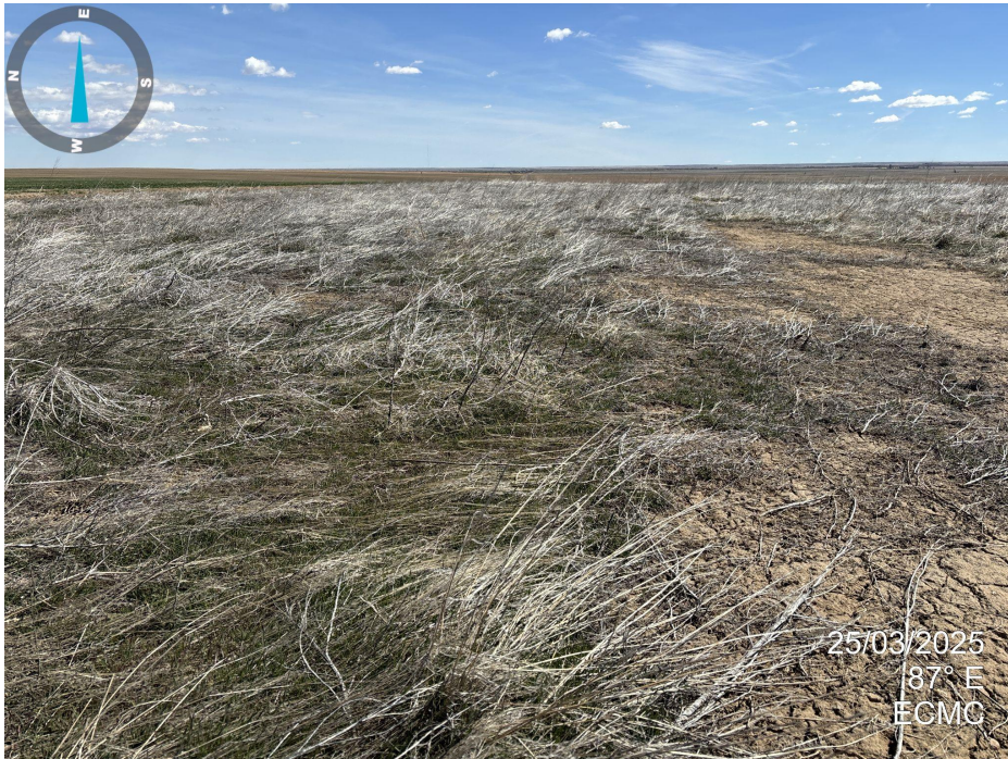
Photo 3. Vegetation and bare spot on tank battery.