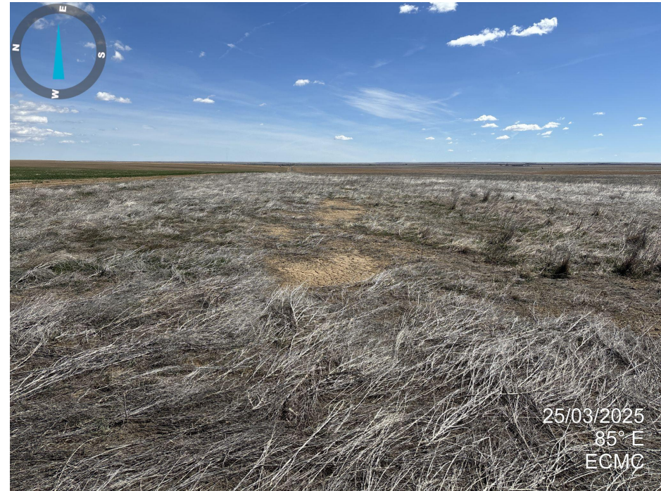
Photo 2. Looking east down the former tank battery. Large bare spot is present at the tank battery. Vegetation is primarily list C noxious weed Downy Brome. Undesirable weed Kochia is also present on location.