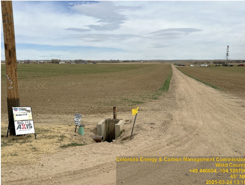
Colorado Energy & Carbon Management Commission Weld County +40.446604,-104.526796 66° NE 2025-03-24 13:18