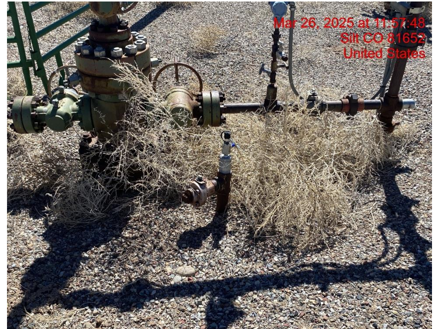
Weeds – Photo #07673