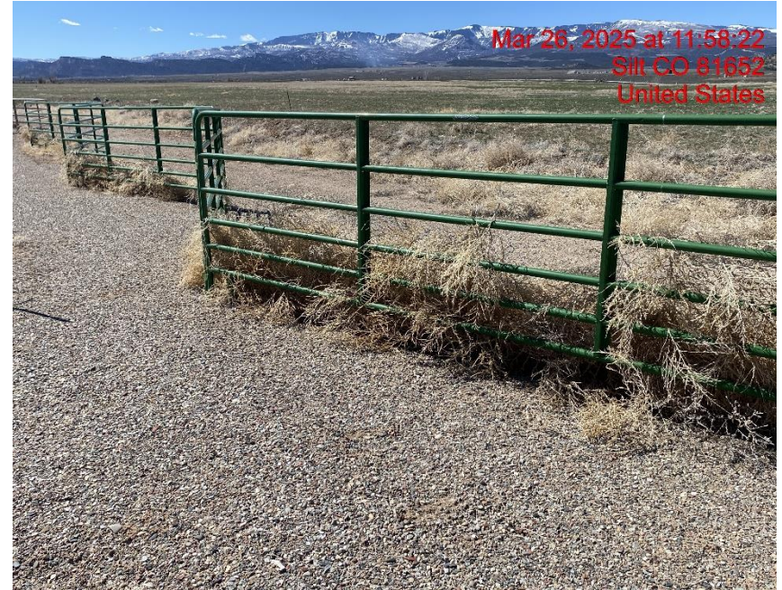
Weeds – Photo #07677