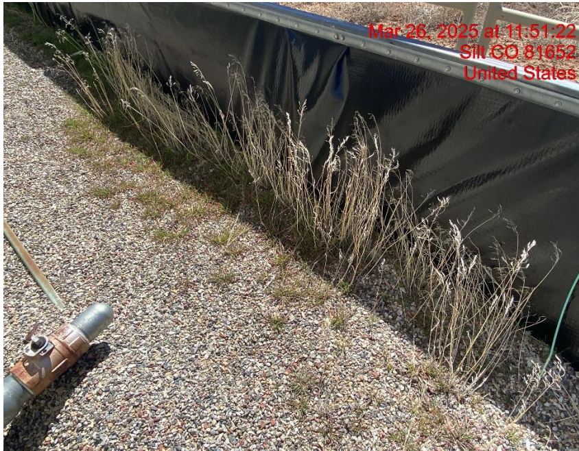
Weeds – Photo #07658