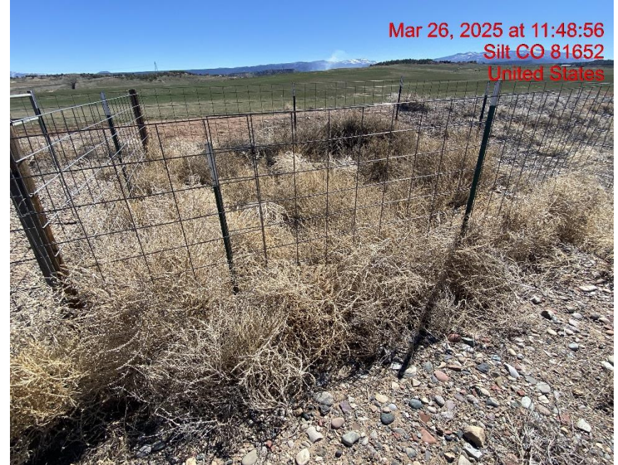
Weeds – Photo #07647