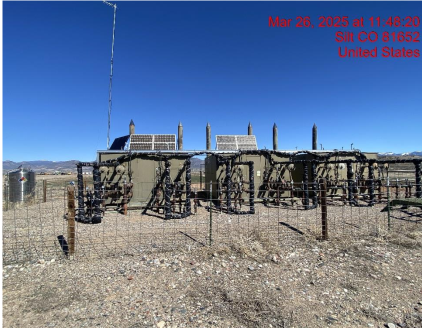
Location – Photo #07645