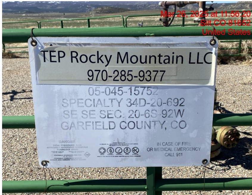
Illegible Wellhead Sign – Photo #07668