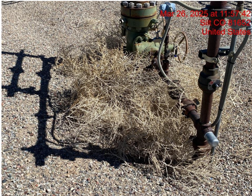
Weeds – Photo #07672