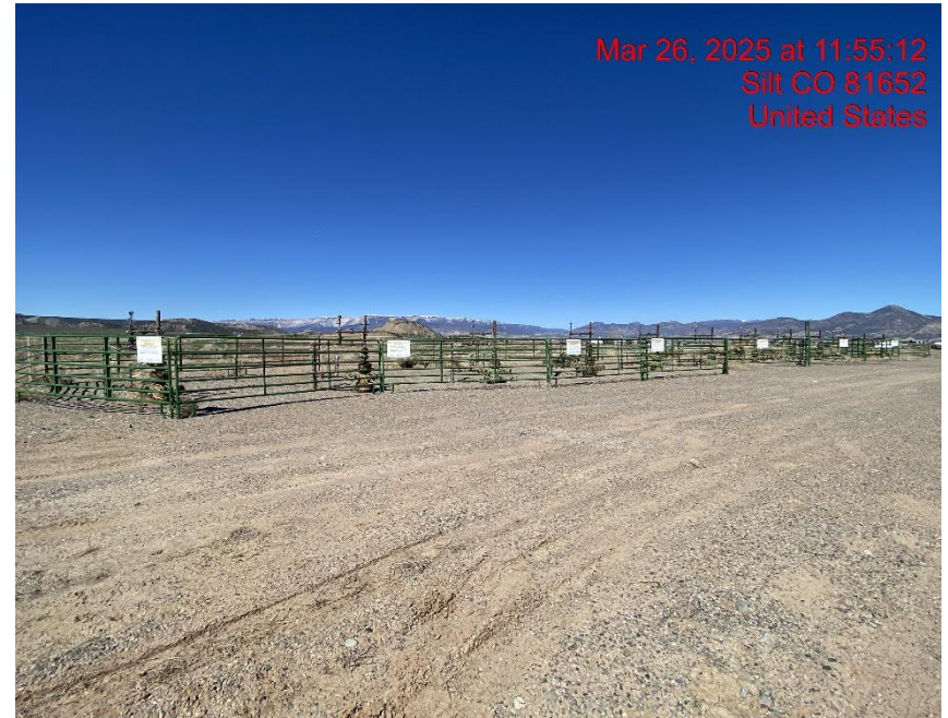
Location Overview – Photo #07644

Mar 26, 2025 at 11:55:12 Silt CO 81652 United States