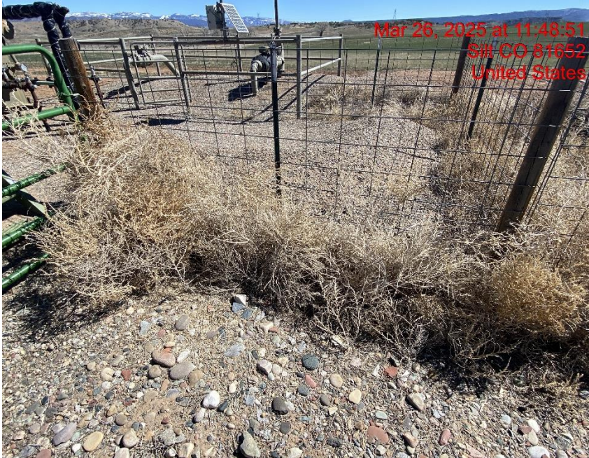
Weeds – Photo #07646