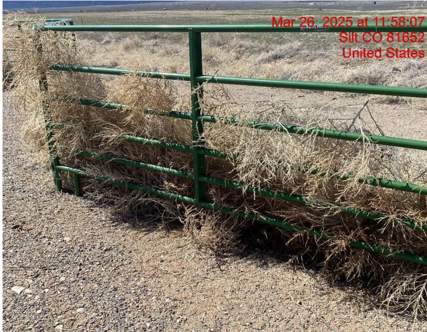
Weeds – Photo #07676