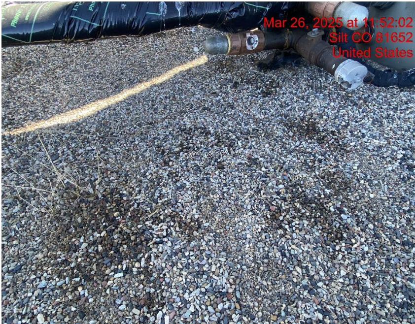
Staining – Photo #07661