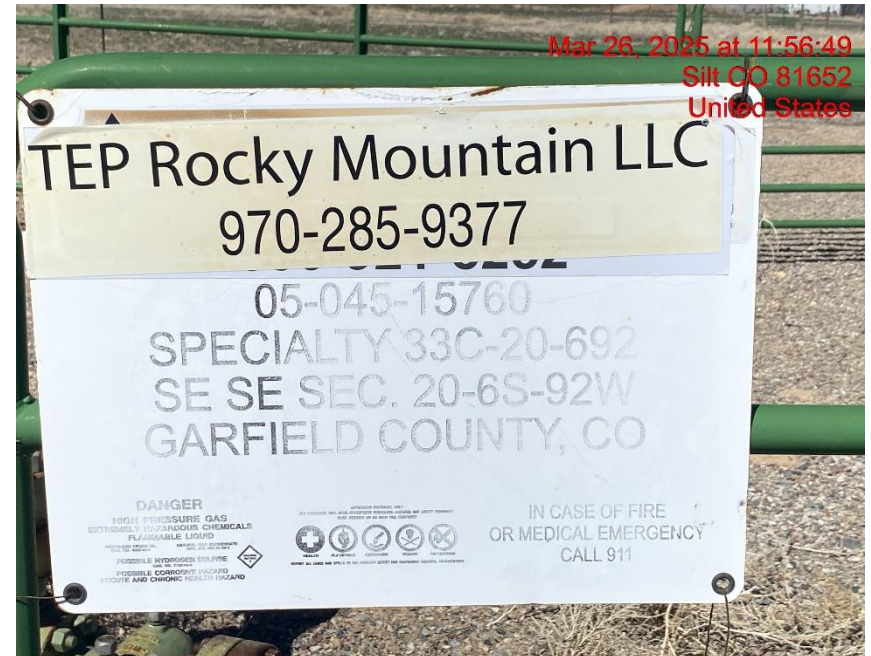
Illegible Wellhead Sign – Photo #07671