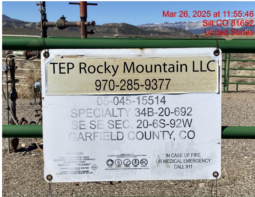
Illegible Wellhead Sign – Photo #07666