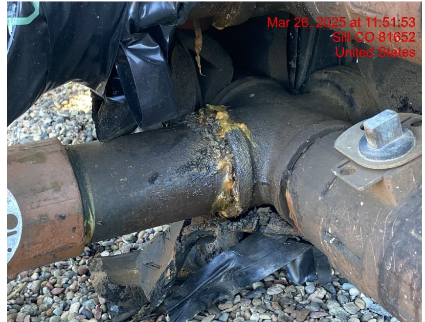
Leak on Load Line Fitting – Photo #07660