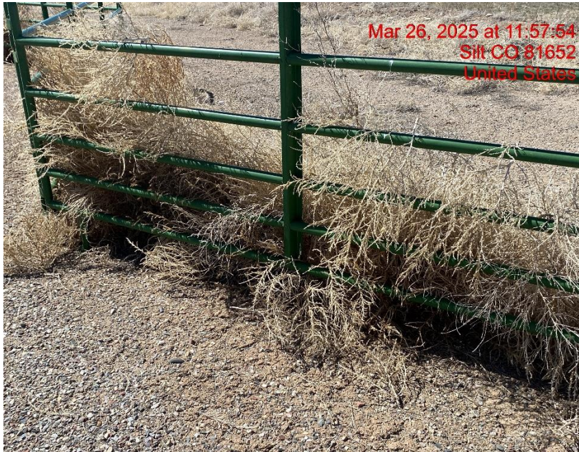
Weeds – Photo #07674