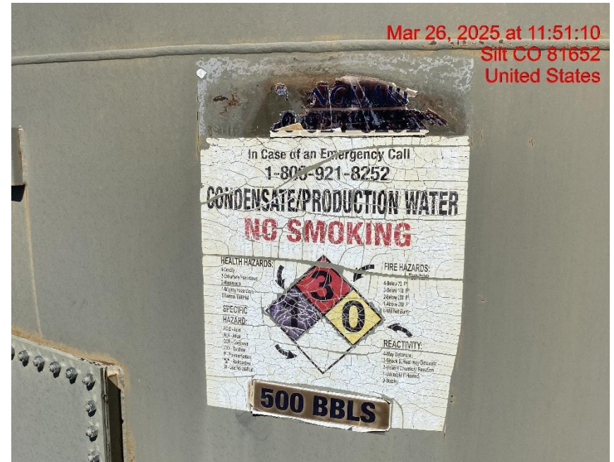
Illegible Tank Label – Photo #07657