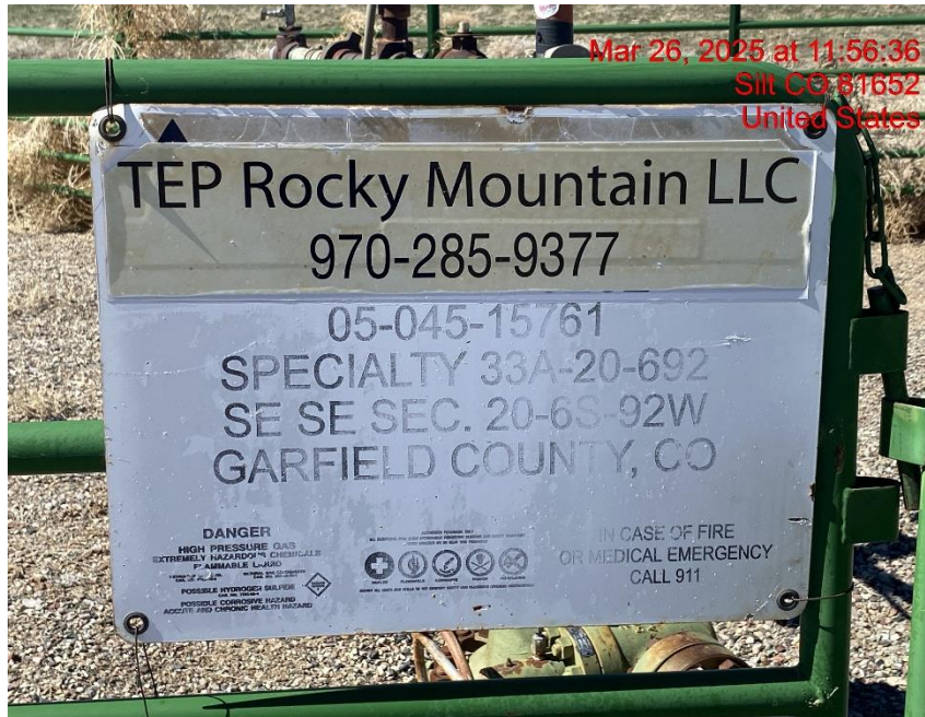
Illegible Wellhead Sign – Photo #07670