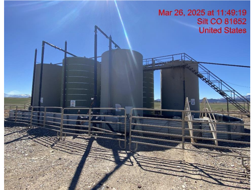
Location – Photo #07648