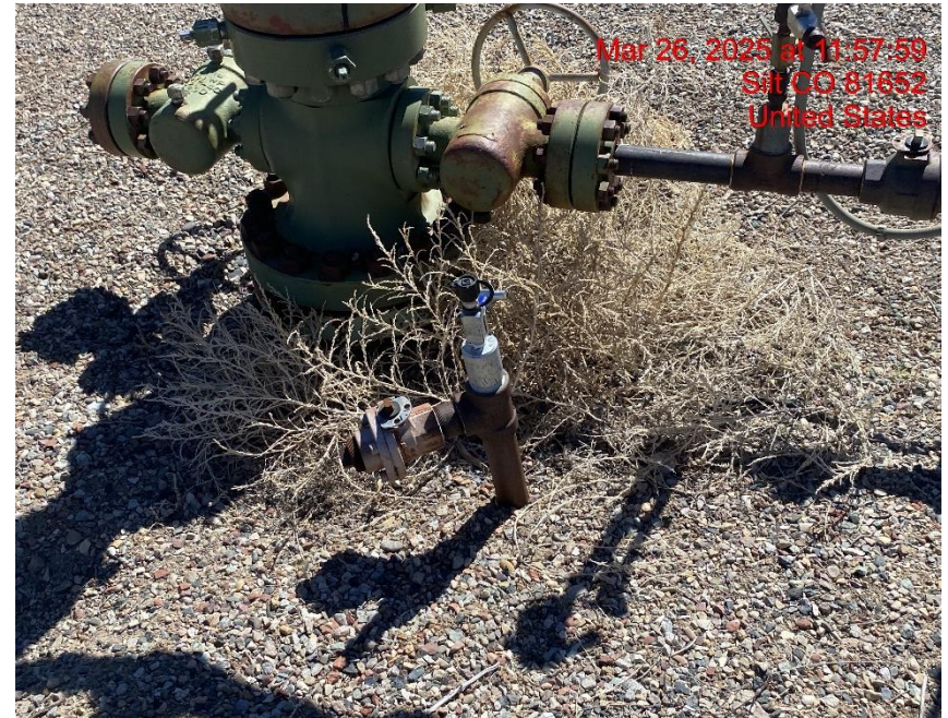
Weeds – Photo #07675