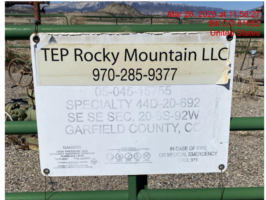
Illegible Wellhead Sign – Photo #07669