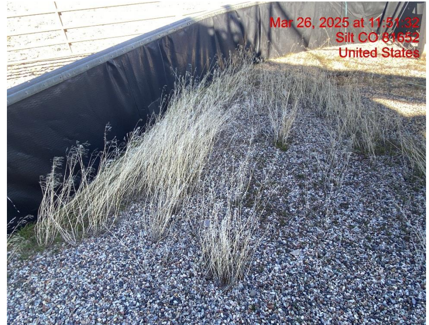
Weeds – Photo #07659