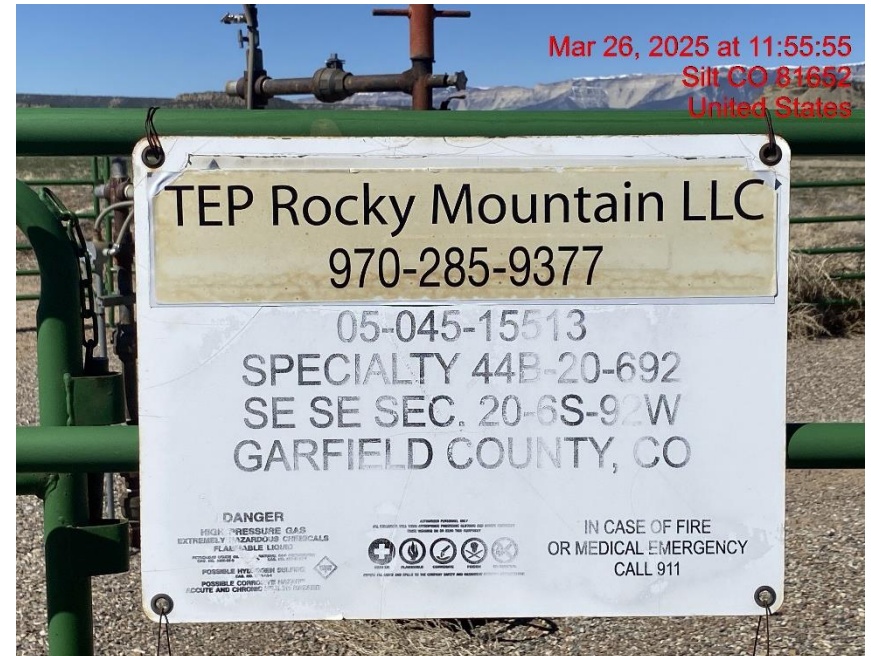
Illegible Wellhead Sign – Photo #07667