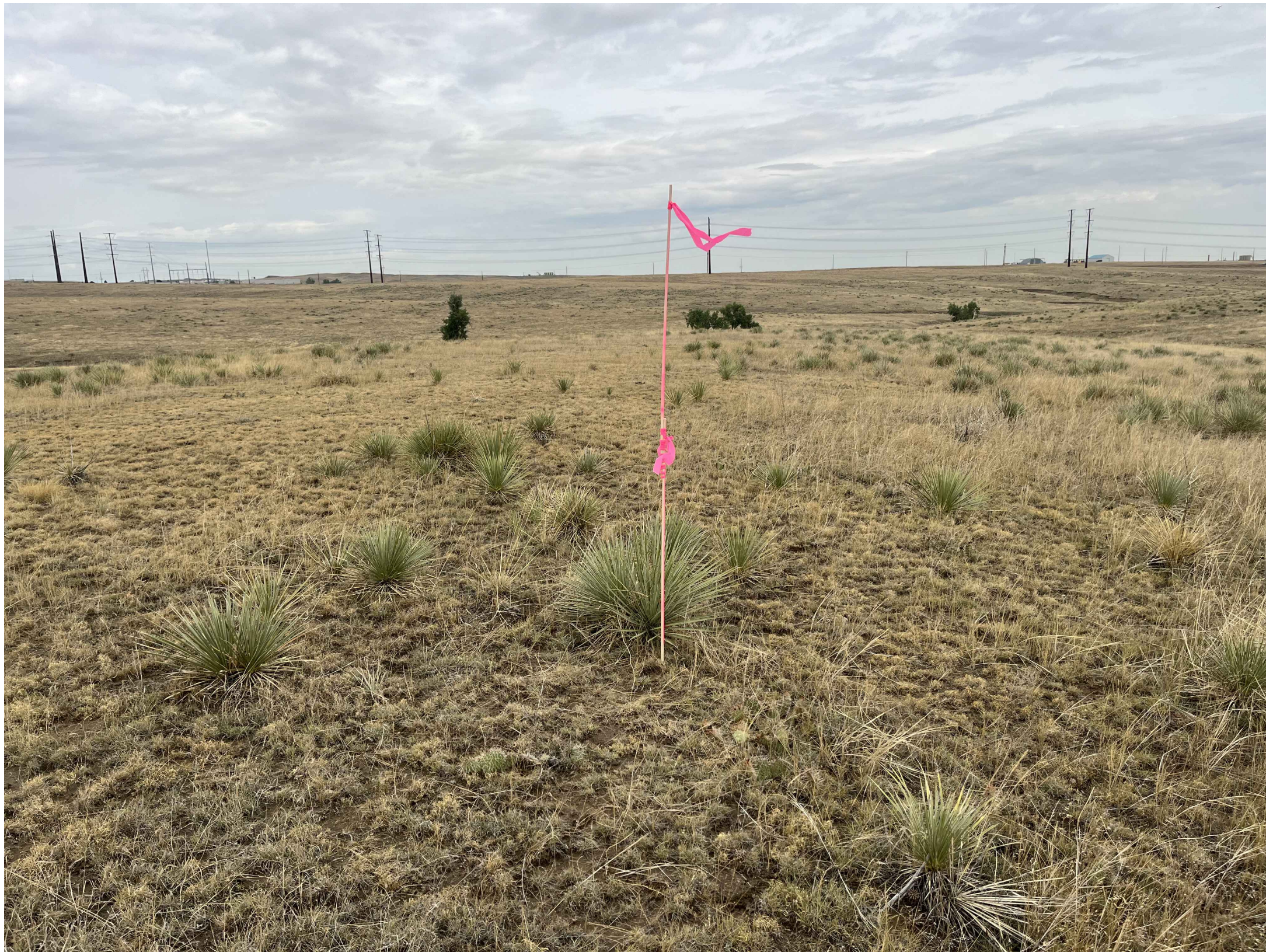
DATE PHOTOS TAKEN: 09/05/2024