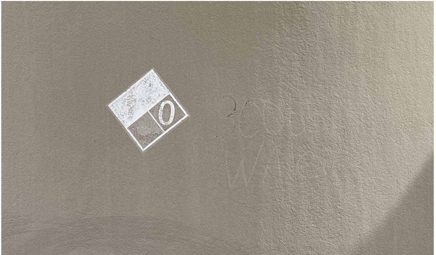
PHOTO 8: NFPA STICKER IS FADED AND NEEDS REPLACED, TANK CONTENTS AND CAPACITY LABEL IS NOT SUFFICIENT. Install sign to comply with Rule 605.h. CA DATE 4/27/2025.