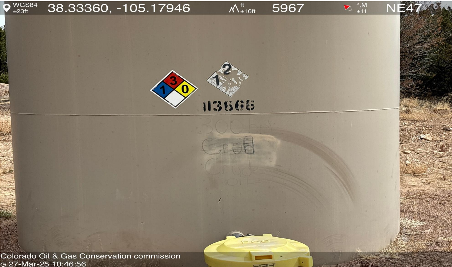
PHOTO 9: NFPA STICKER IS FADED AND NEEDS REPLACED, TANK CONTENTS AND CAPACITY LABEL IS NOT SUFFICIENT. Install sign to comply with Rule 605.h. CA DATE 4/27/2025.