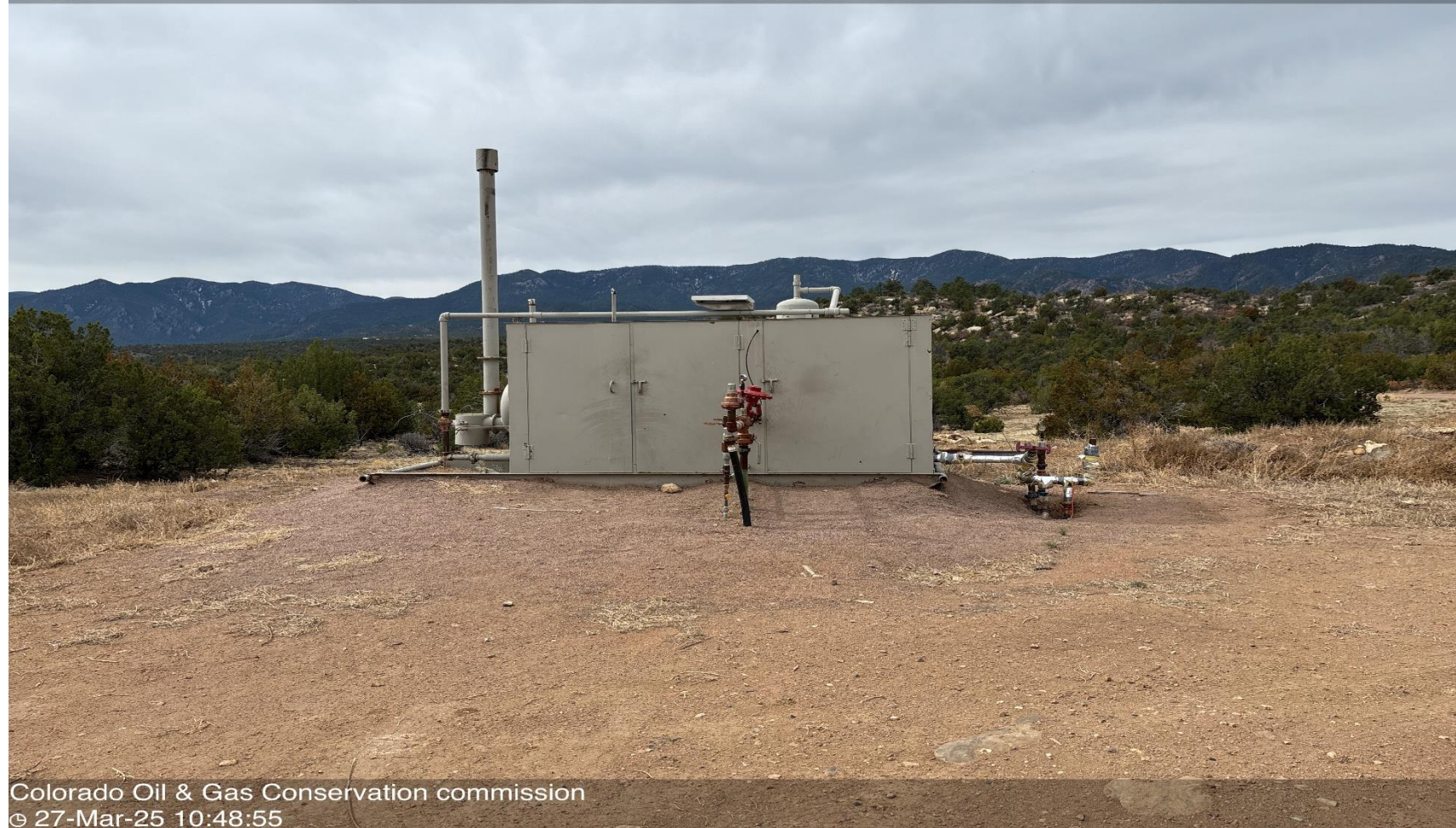
PHOTO 5: HEATED SEPARATOR. NOTE: THERE IS NO GAS METER IN SEPARATOR HOUSE.