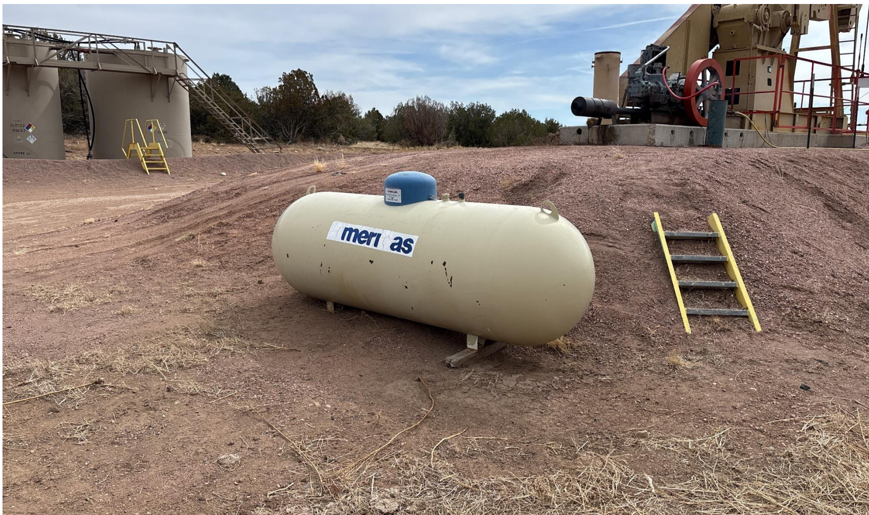
PHOTO 10 PROPANE TANK.