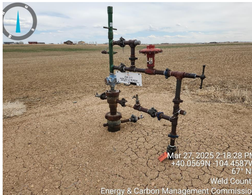
Photo 1 well head and equipment