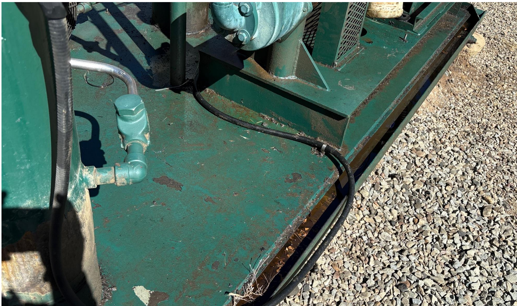
PHOTO 6: OILY WASTE IN OPEN CONTAINMENT (COMPRESSOR SKID). DRAIN OILY WASTE REPAIR ALL LEAKS AND REMOVE OR TREAT IMPACTED SOIL PER RULE 1002..(2).D & 1002.f.(2)B, Comply with general provisions of the oil and gas act for wildlife protection AND SB-181. CA DATE 3-26-2025.