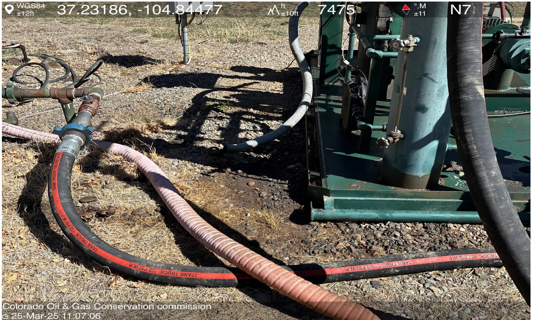
PHOTO 4: OILY WASTE NEAR COMPRESSOR. Conduct maintenance on equipment, cleanup stained material and review self inspection processes. COMPLY WITH RULE 1002,(2).D. CA DATE 3-31-2025.