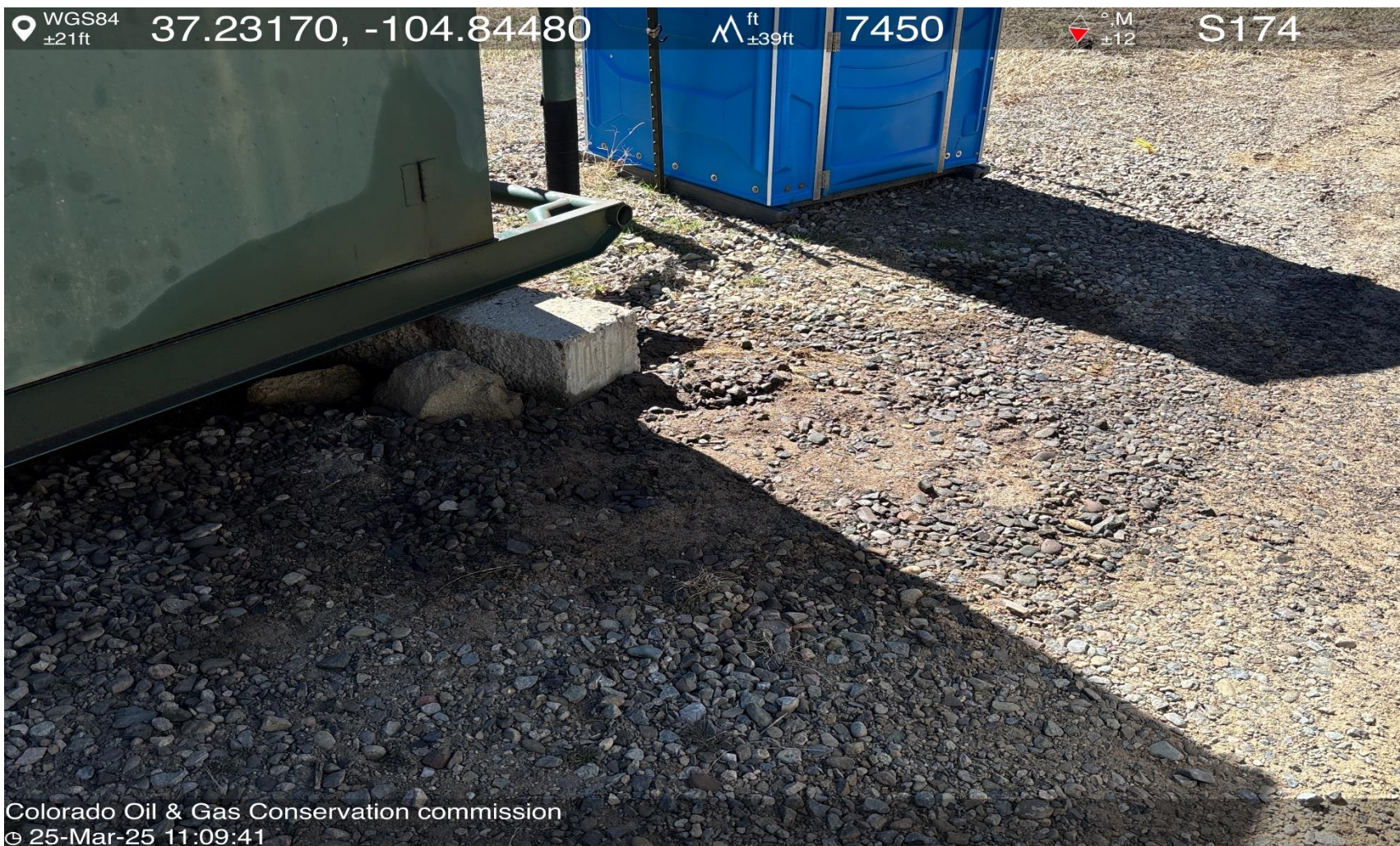
PHOTO 5: AREA OF IMPACTED SOIL NEAR METER HOUSE. Conduct maintenance on equipment, cleanup stained material and review self inspection processes. COMPLY WITH RULE 1002,(2).D. CA DATE 3-31-2025.