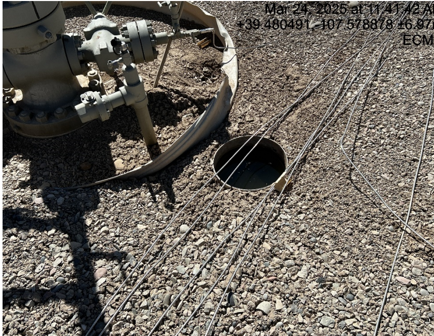
Open rat hole