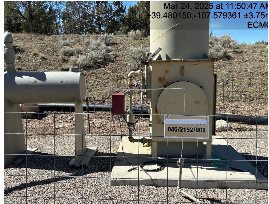
ECD not metered