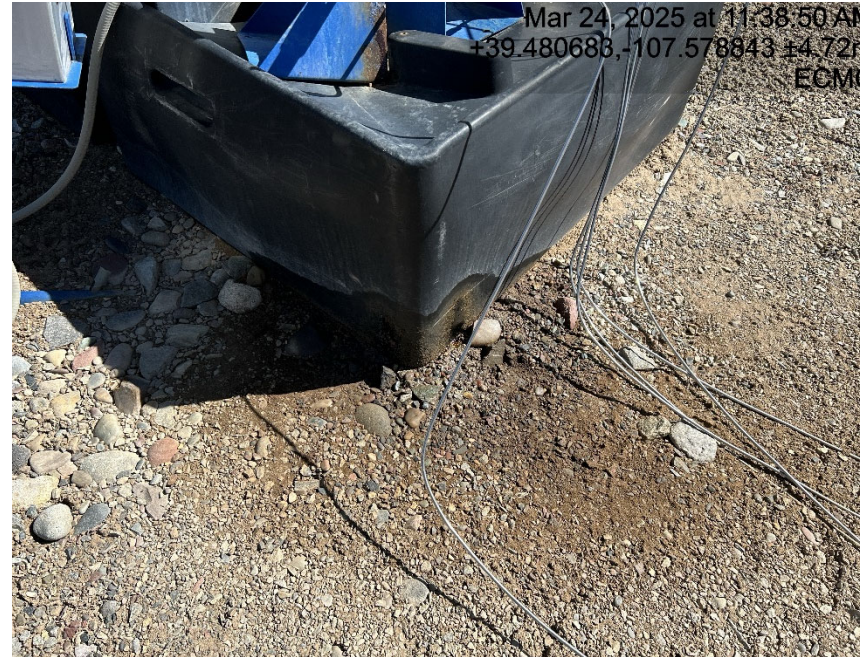
Chemical containment leaking possible chemical