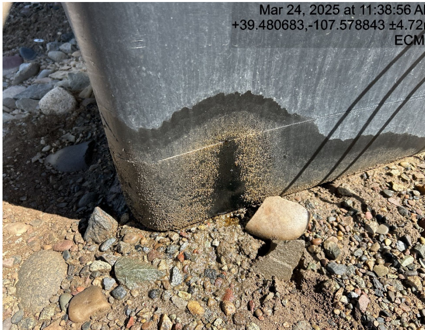
Chemical containment leaking possible chemical