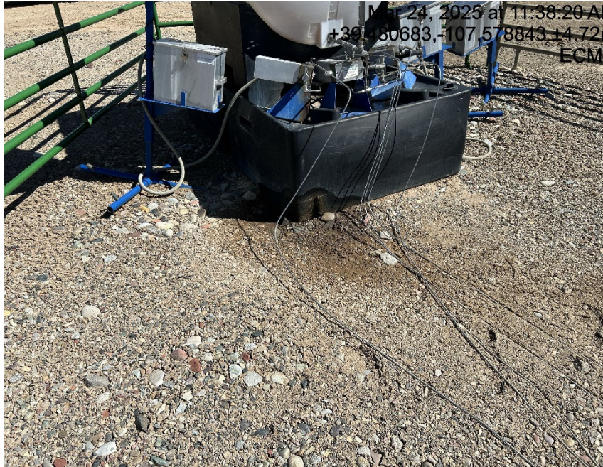
Chemical containment leaking possible chemical