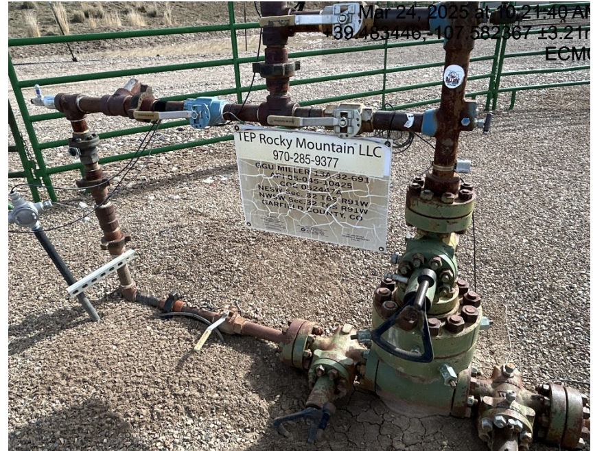
Well signage becoming illegible