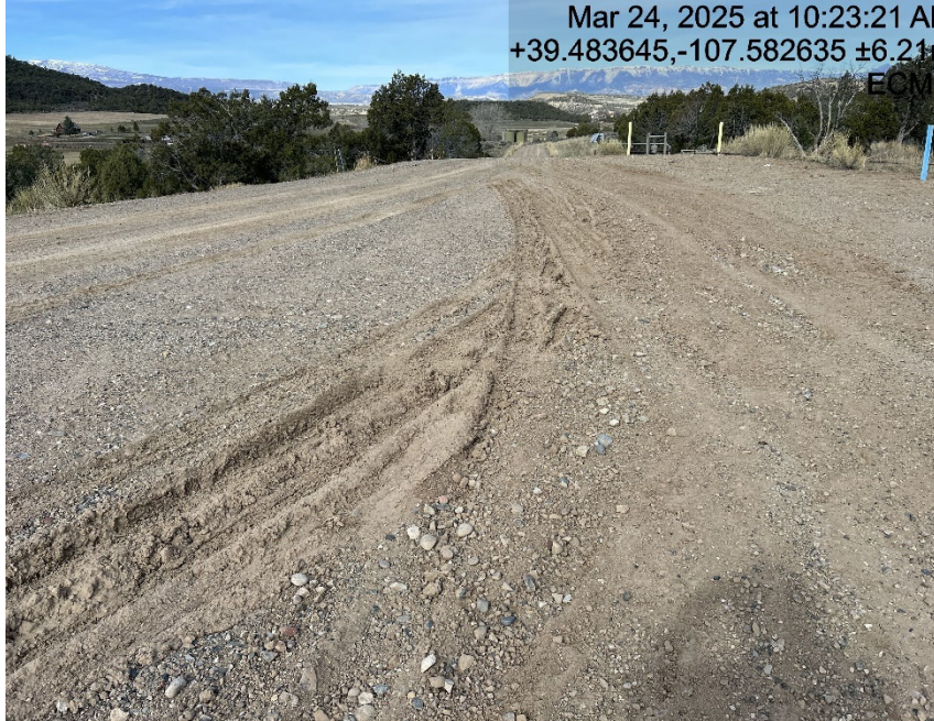
Lack of stabilization/compaction