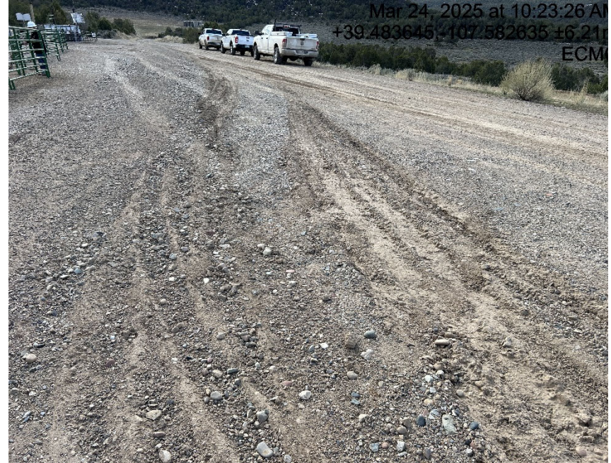
Lack of stabilization/compaction