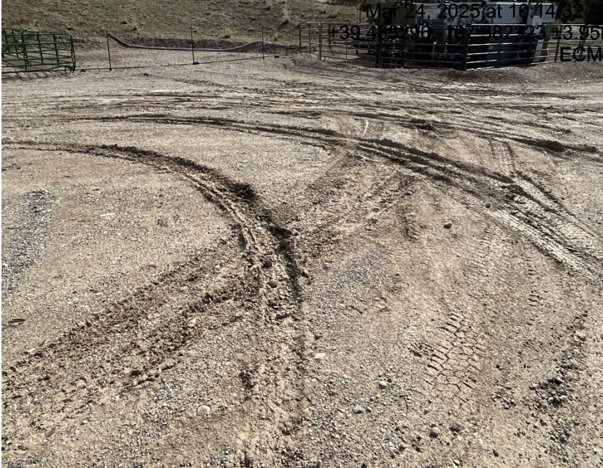
Lack of stabilization/compaction