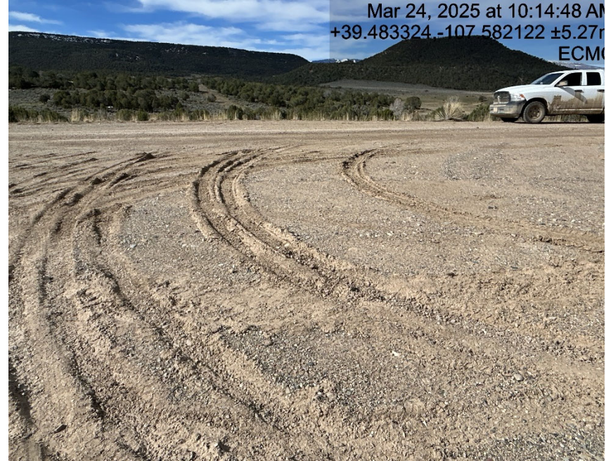
Lack of stabilization/compaction