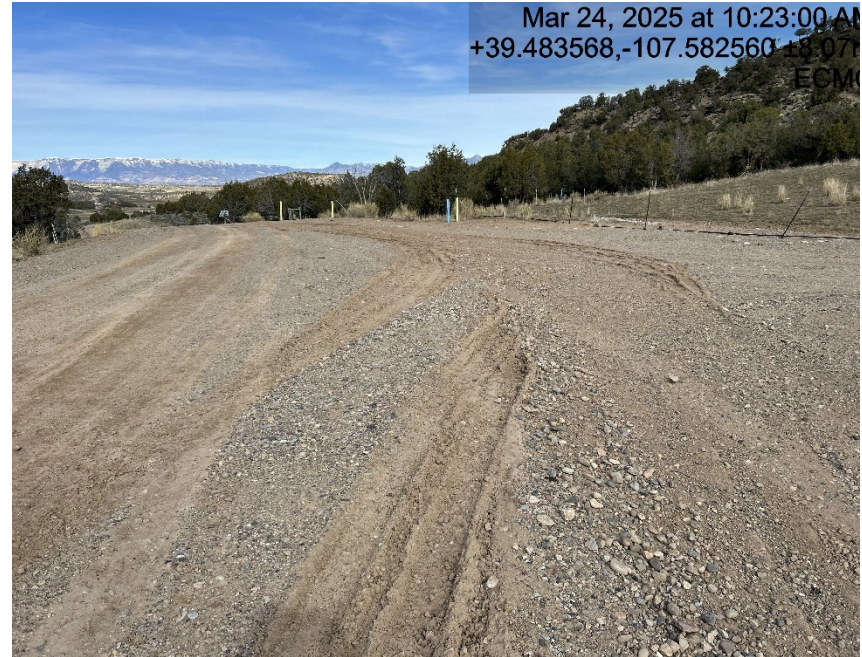
Lack of stabilization/compaction