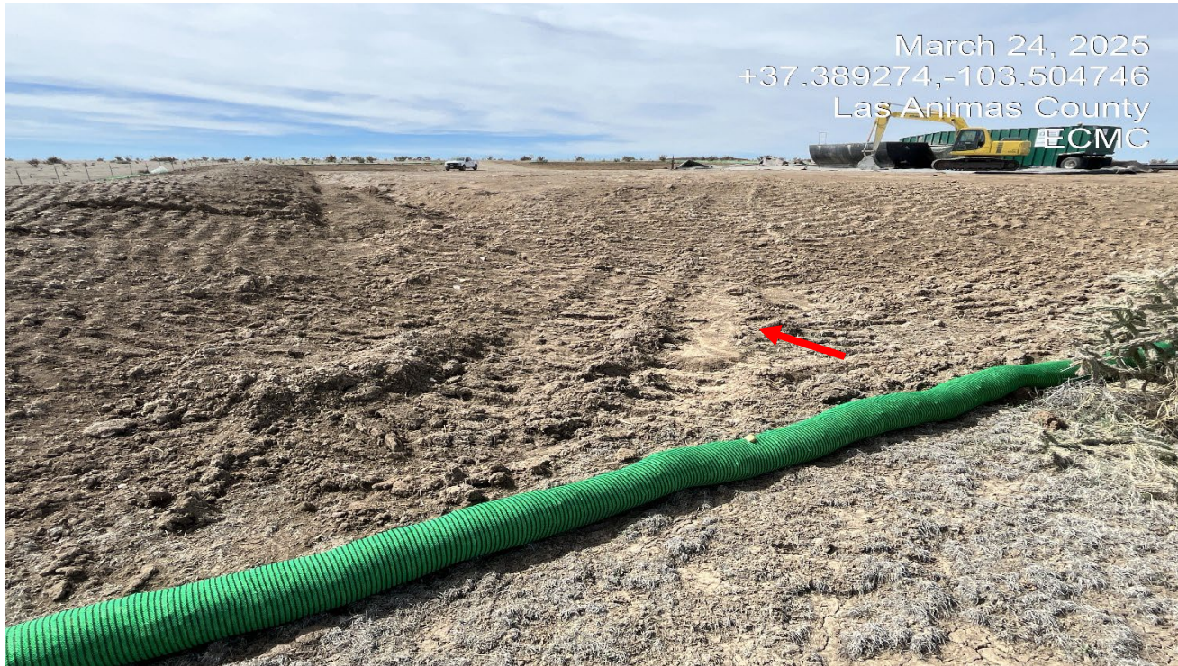
Photo 9. The entire location slopes to this northeast corner and there are insufficient BMP's to prevent erosion and offsite sediment transport.