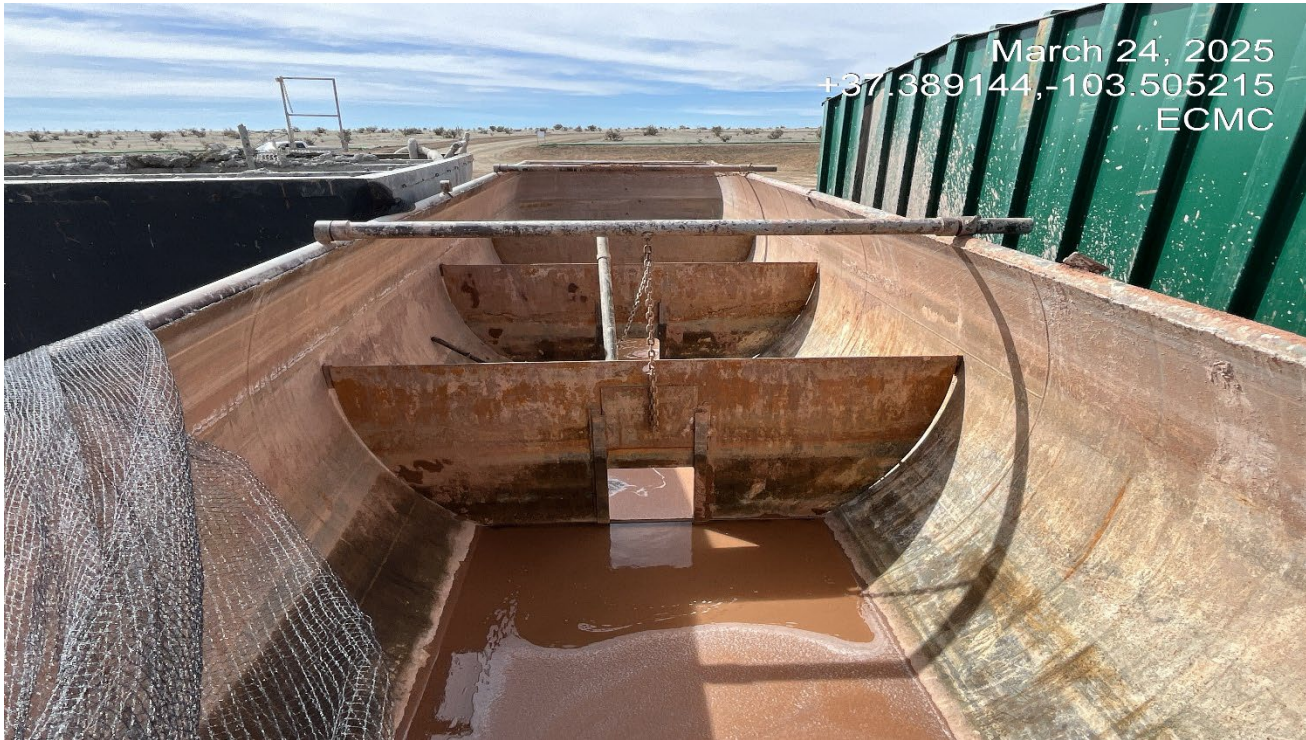
Photo 8. There are fluids that still remain in the open top tank. Wildlife protection must be installed to prevent entry.