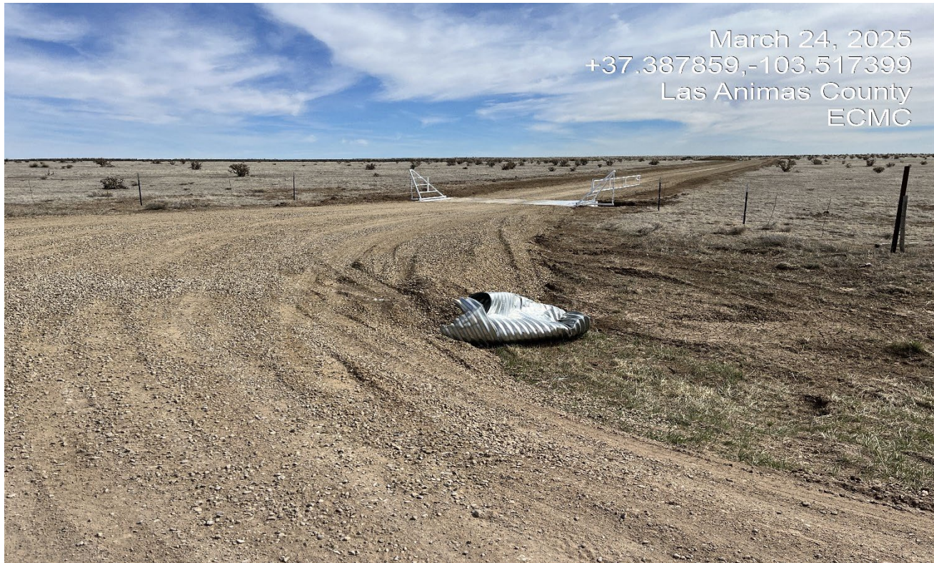
Photo 1. Facing northeast at the beginning of the access road. The culvert is damaged and will need to be repaired.