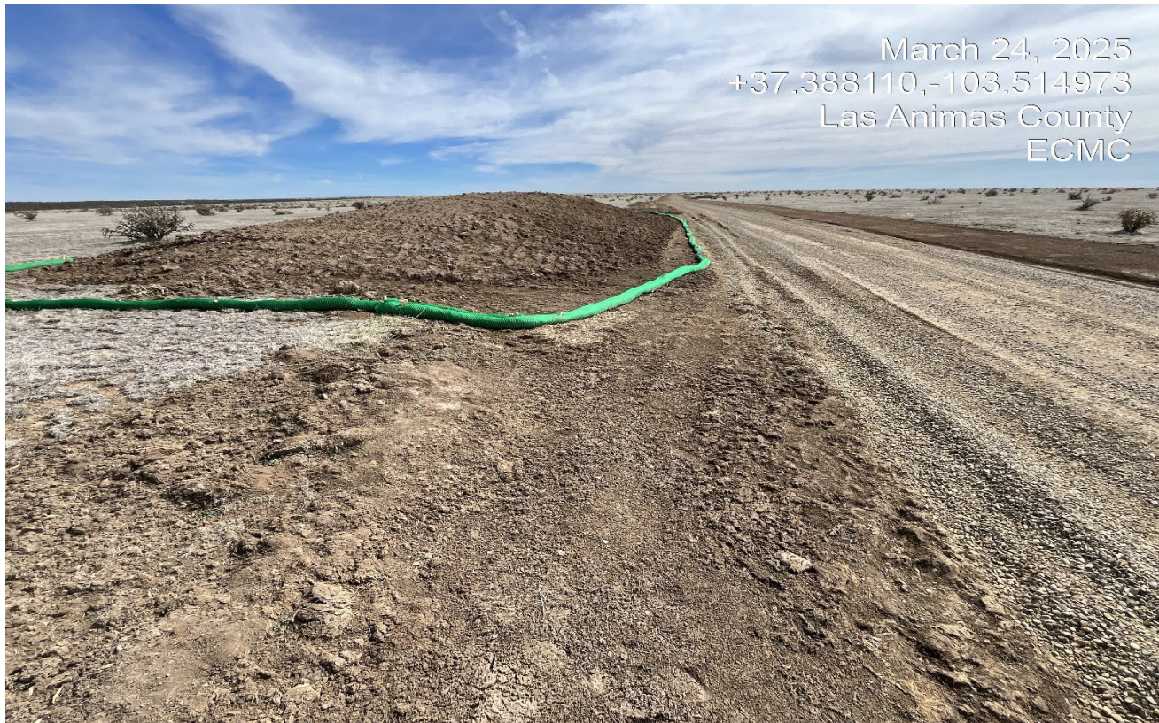
Photo 2. Facing east along the access road. The topsoil piles stored along the road will need to be seeded for long term stabilization..