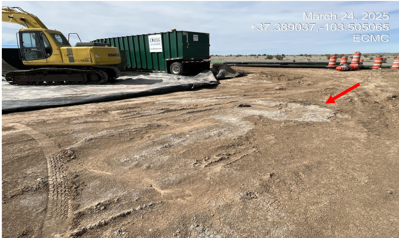
Photo 6. There are stained soils where fluids have leaked off the