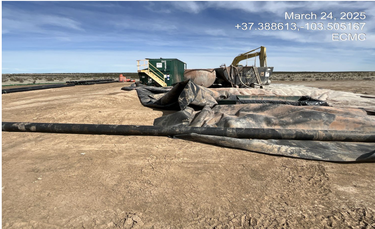
Photo 4. The liner has folded over with the wind and will need to be removed.