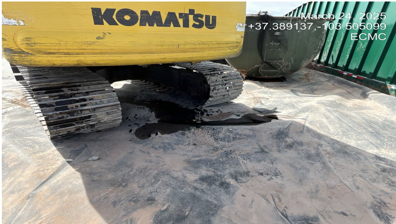
Photo 7. The excavator had a leak but was parked on the liner.