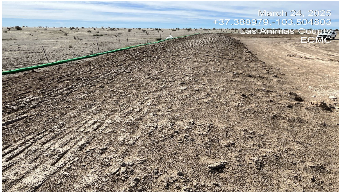
Photo 10. The topsoil pile at the east side of the location will need to be seeded and stabilized if stored for longer than 6 month since construction.