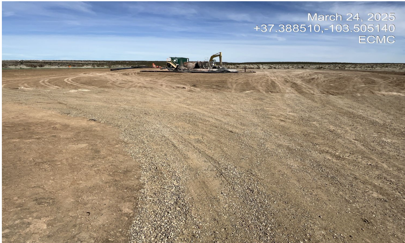
Photo 3. Facing north toward the recently drill wellsite..