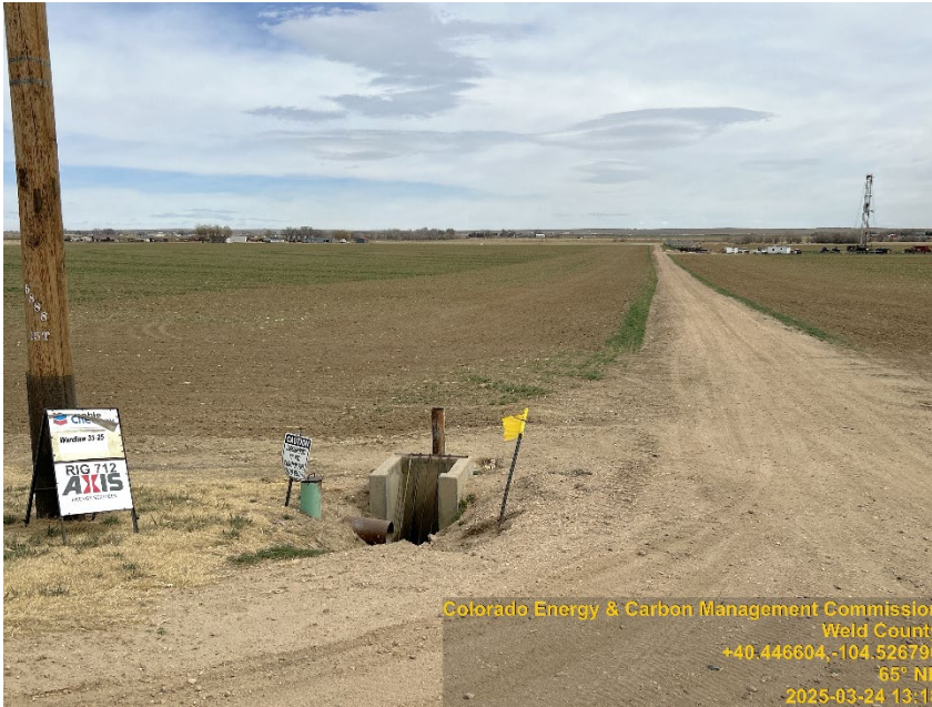
Colorado Energy & Carbon Management Commission Weld County +40.446604, -104.526796 65° NE 2025-03-24 13:18