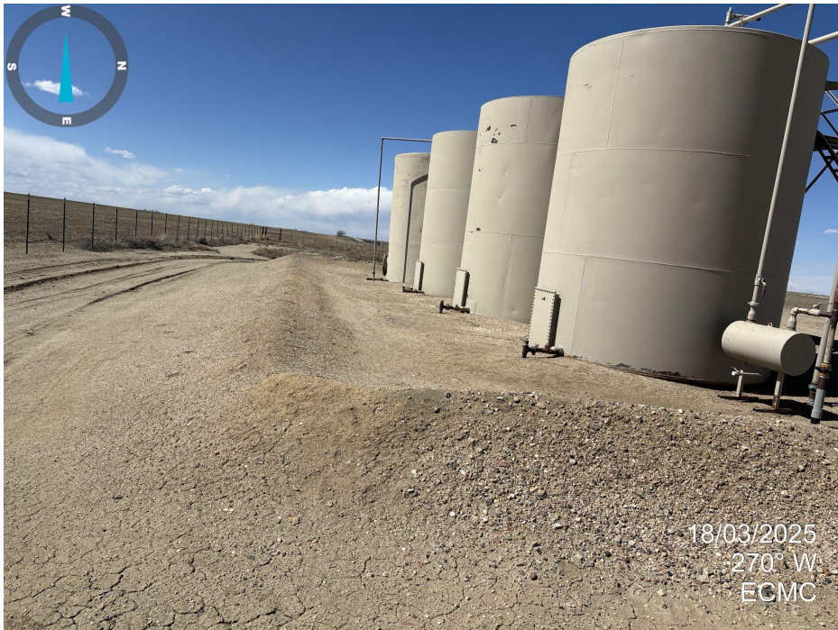
Photo 9. Looking west down south side of location.