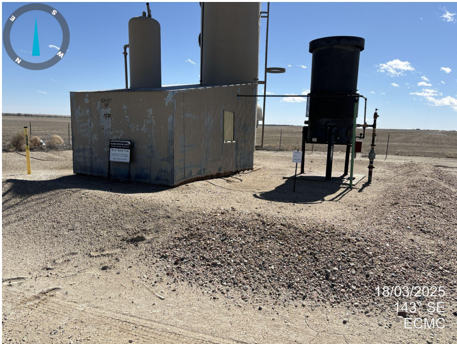
Photo 3. Separator shed on east side of location.