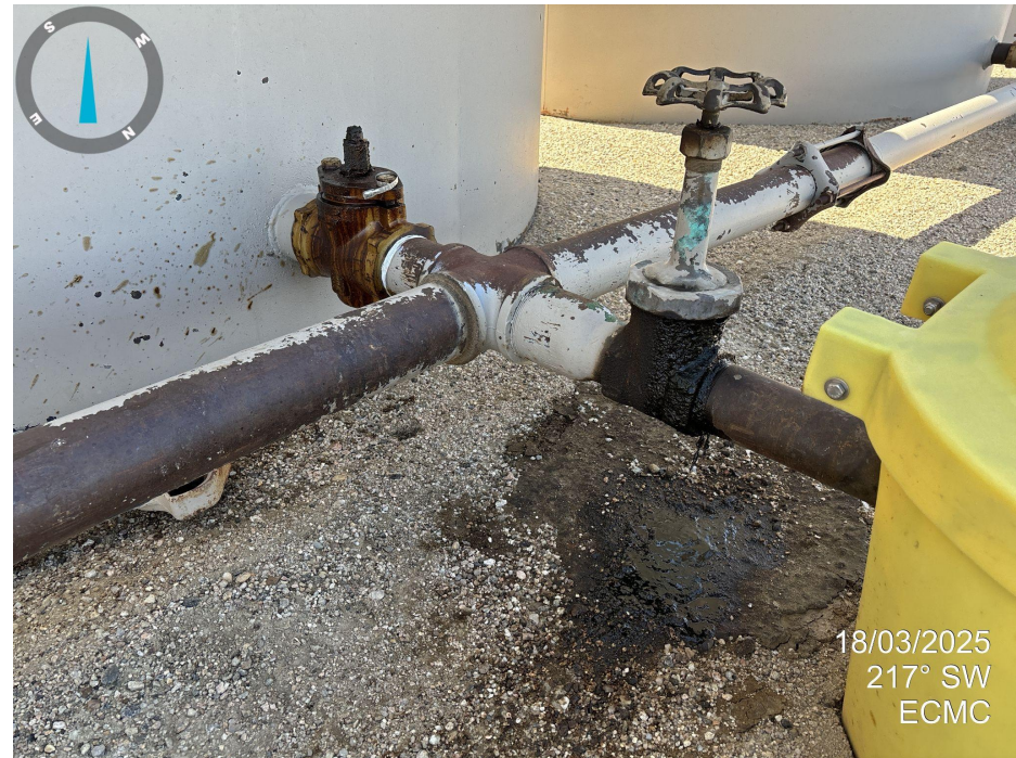
Photo 2. Valve is leaking. Stained soil is present beneath valve.