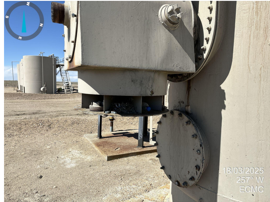
Photo 8. Air inlet of active separator. Multiple bird nests as well as trash, bolts and fittings.