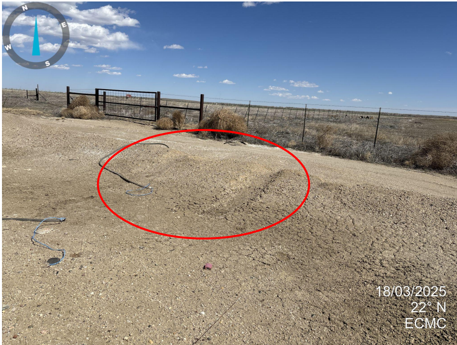
Photo 7. Eastern side of separator shed berm. Has been driven over and damaged.