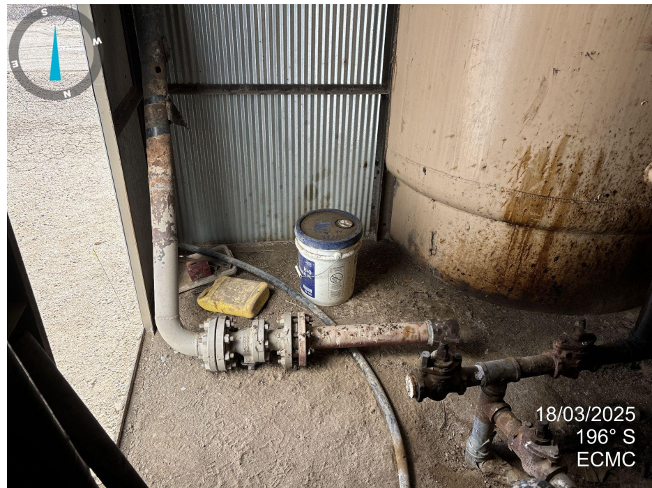
Photo 6. Unused equipment being stored in separator shed.