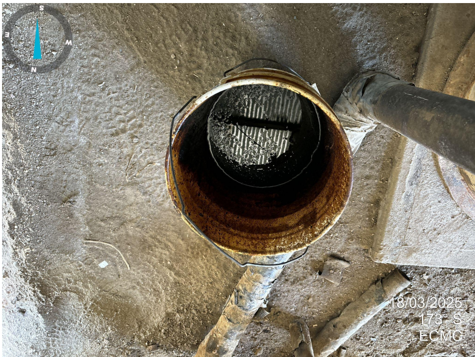
Photo 5. Oil in bucket