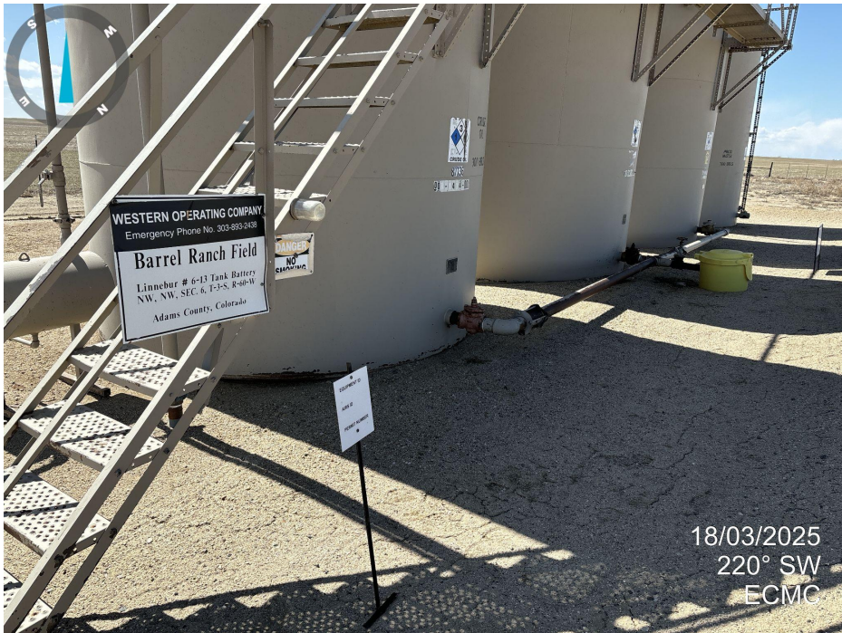
Photo 1. Looking across tank battery.