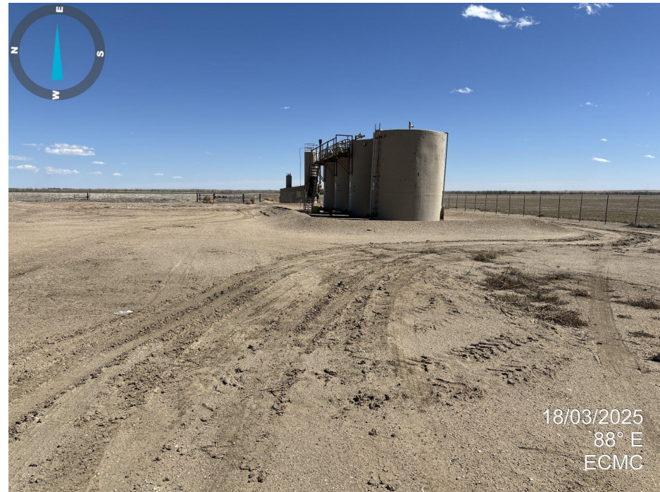
Photo 10. looking east overview of location. Location is free of weeds.