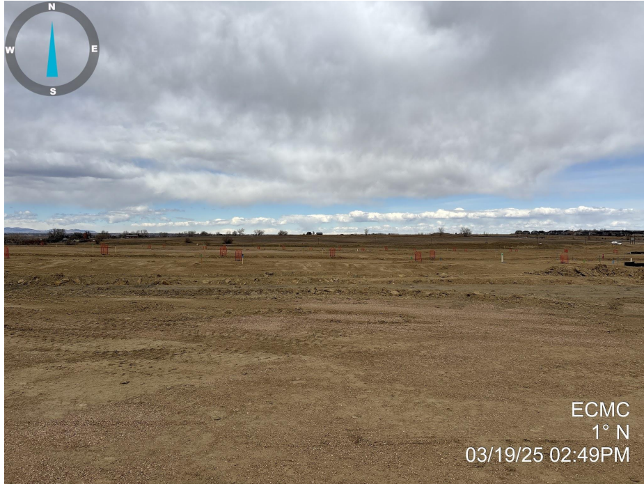
Photo 3. Photo taken from the multi-well location, facing North. Photo illustrates that the well location is contained within a land use change from cropland to a residential development.