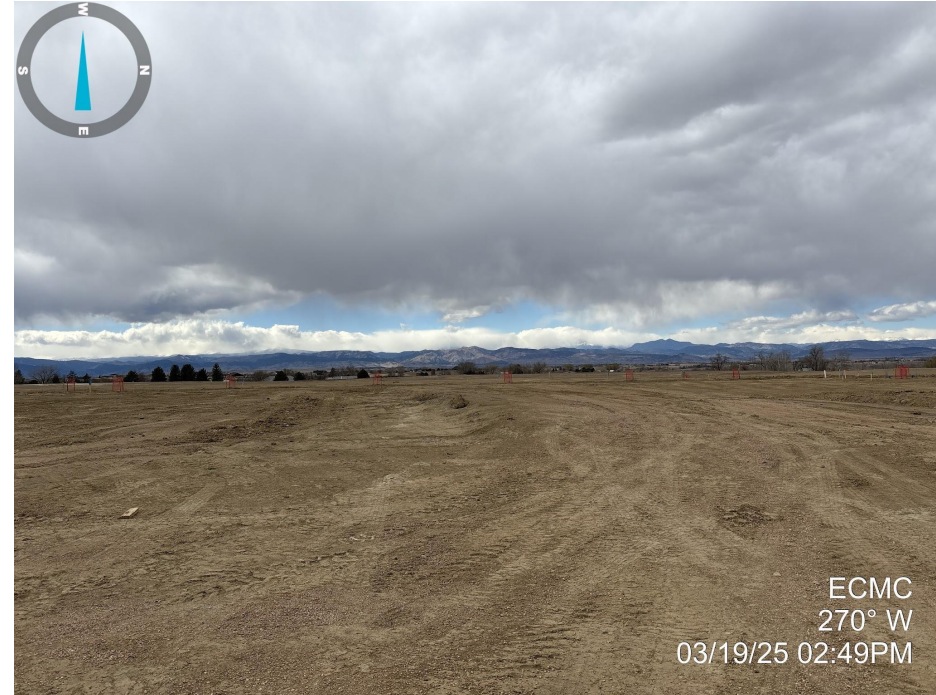
Photo 6. Photo taken from the multi-well location, facing West. See comments under Photo 3.