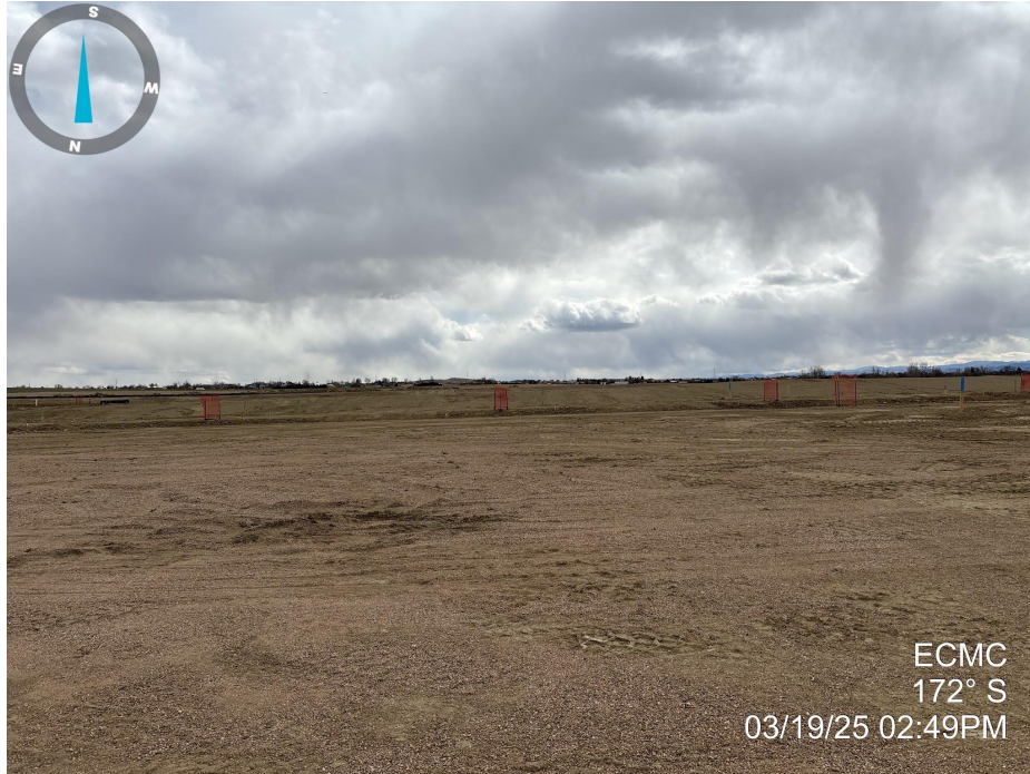
Photo 5. Photo taken from the multi-well location, facing South. See comments under Photo 3.