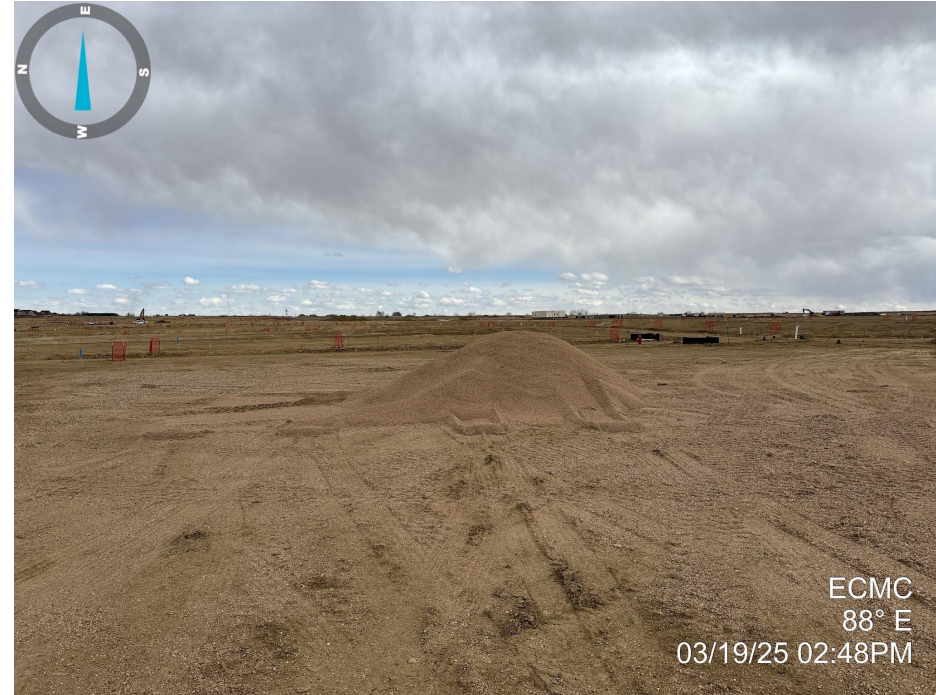
Photo 4. Photo taken from the multi-well location, facing East. See comments under Photo 3.