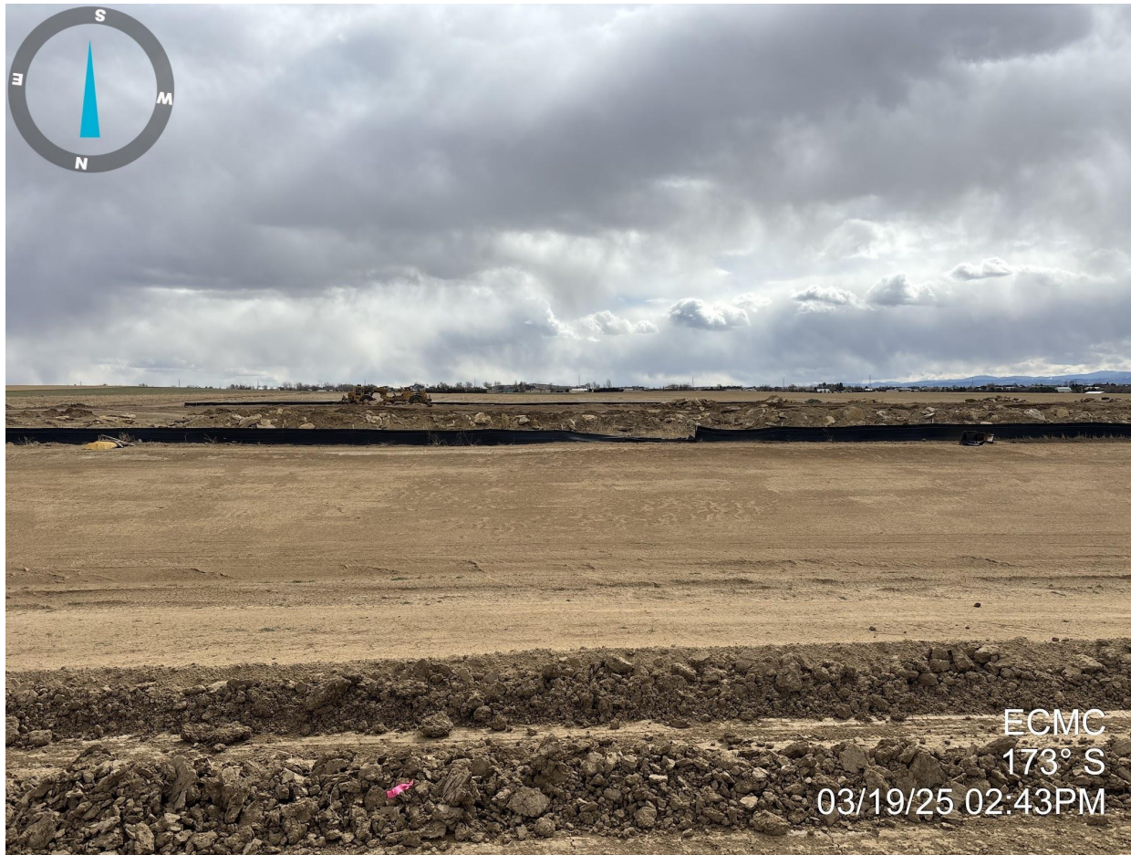
Photo 3. Photo taken of the well location, facing South. Photo illustrates that the well location is contained within a land use change from cropland to a residential development.