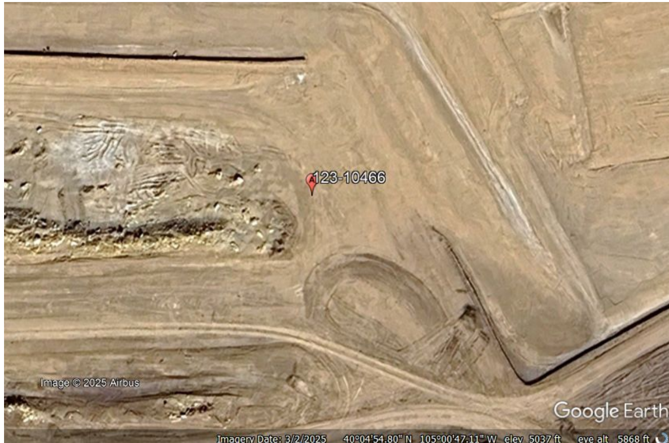
Photo 2. Google Earth aerial imagery from March 2, 2025. Photo illustrates the well location and access road after plugging operations. This imagery illustrates that the location disturbance is now contained within a land use change to a residential development.