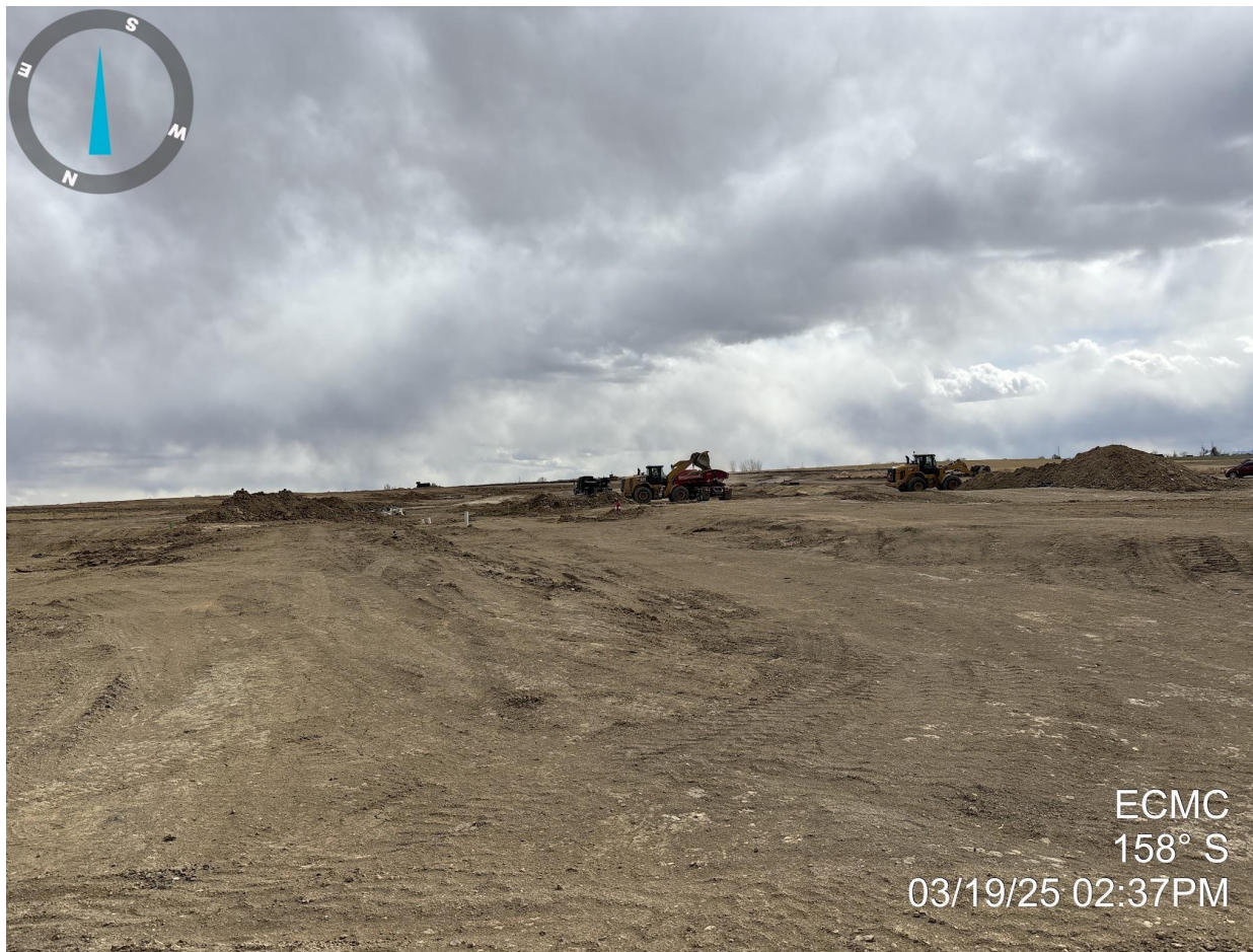
Photo 3. Photo taken of the well location, facing South. Photo illustrates that the well location is contained within a land use change from cropland to a residential development.