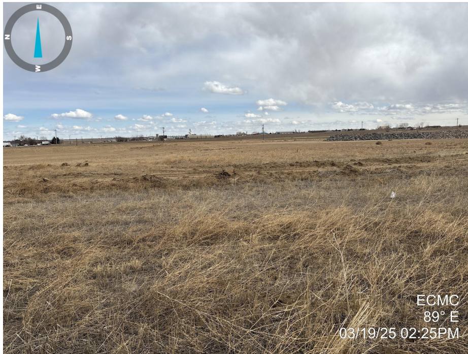
Photo 4. Photo taken from the well location, facing East. See comments under Photo 3.