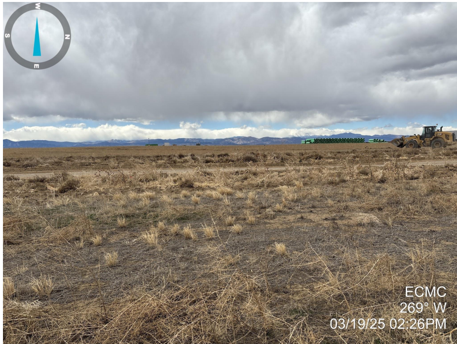
Photo 6. Photo taken from the well location, facing West. See comments under Photo 3.