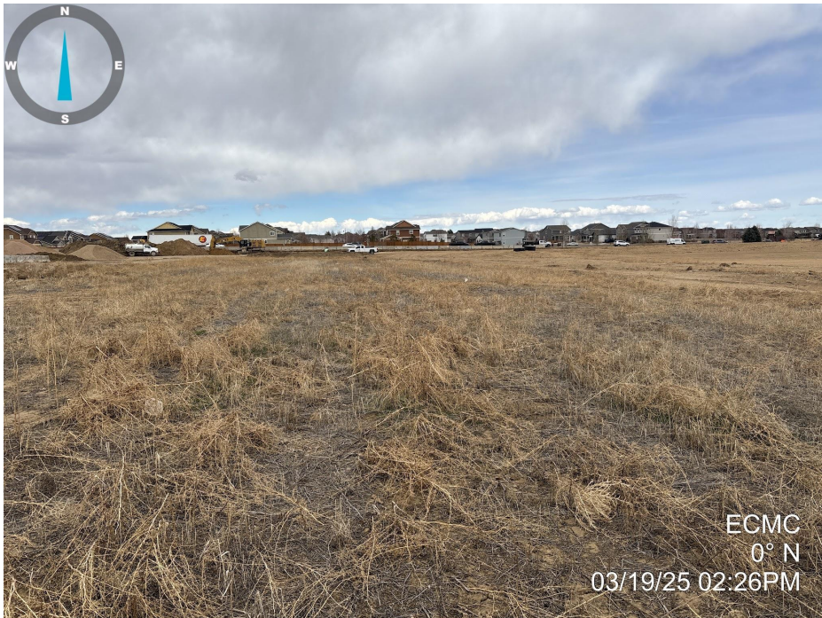
Photo 3. Photo taken from the well location, facing North. Photo illustrates that the well location is contained within a land use change from cropland to a residential development.