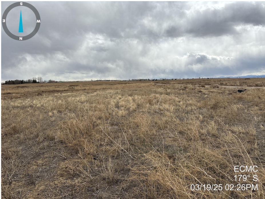
Photo 5. Photo taken from the well location, facing South. See comments under Photo 3.