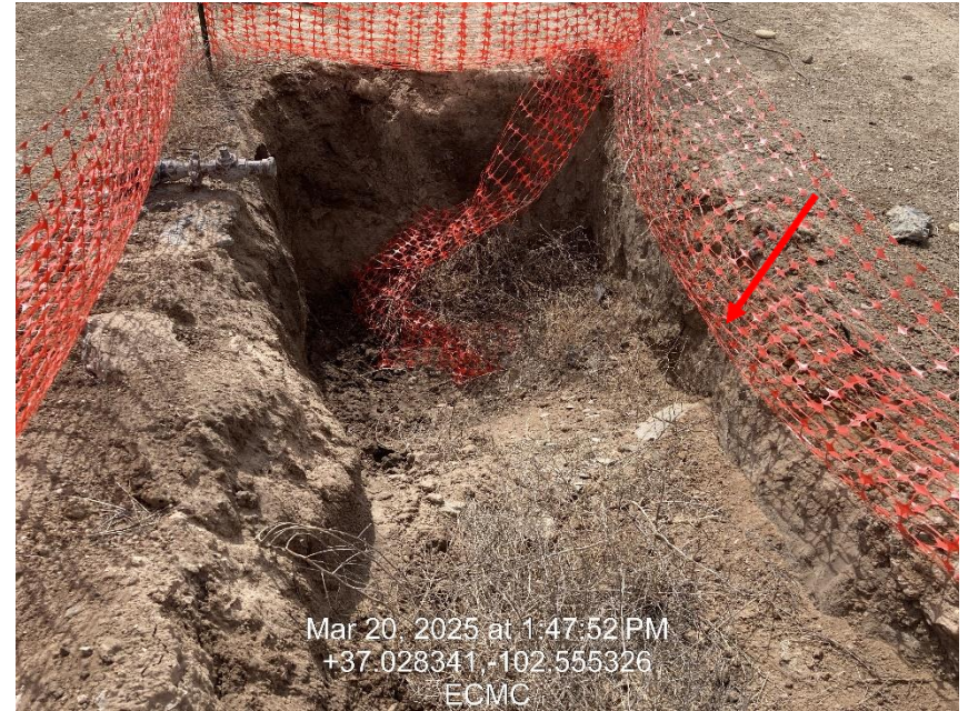
Photo 3 – Wellhead excavation Rem Project # 37141, Fencing not adequate