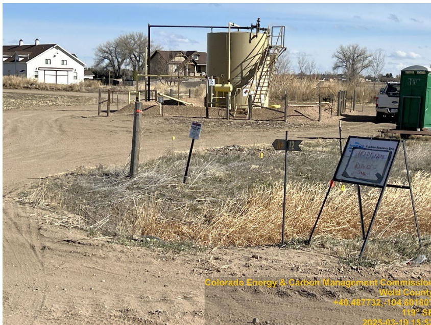
Colorado Energy & Carbon Management Commission Weld County +40.487732, -104.581607 119° SE 2025-03-19 15:52