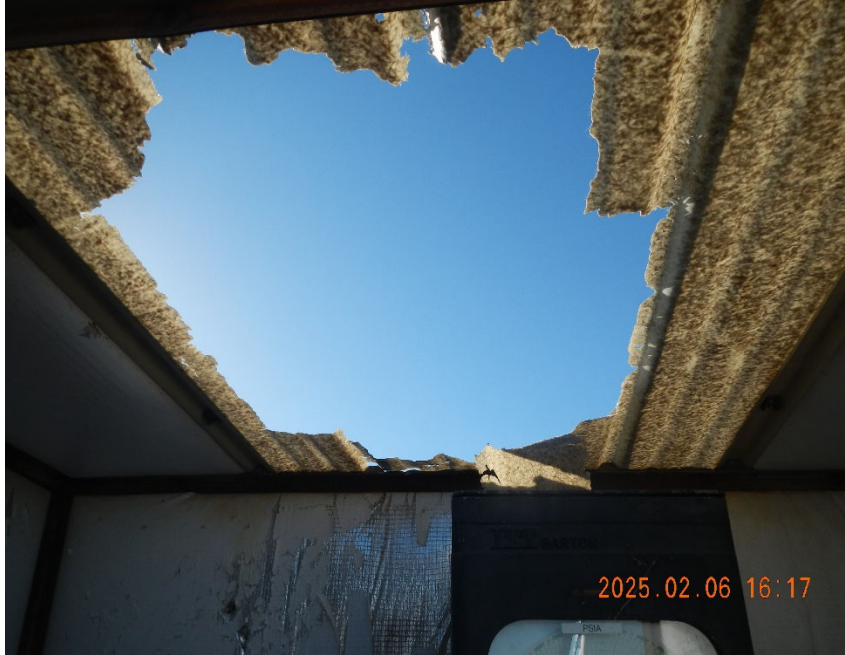
11. View of roof damage on meter shed as seen 02/06/2025.