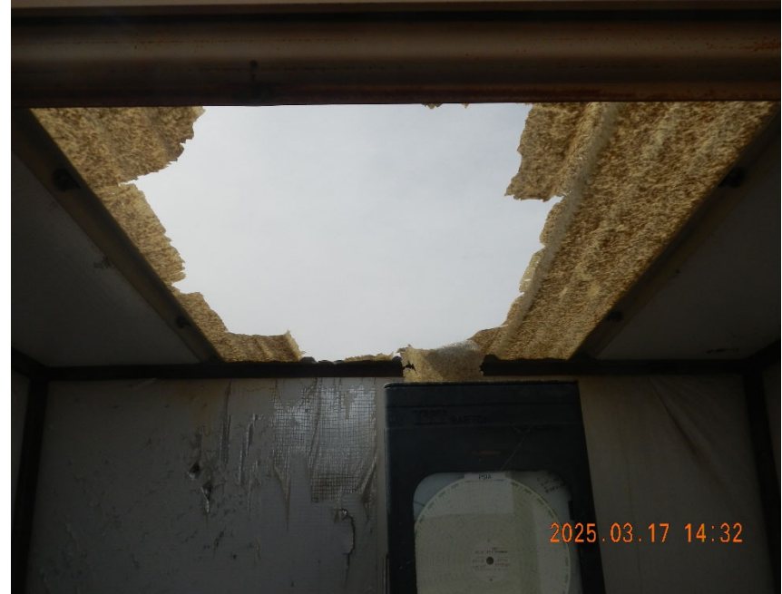
12. View of roof damage on meter shed as seen 03/17/2025.