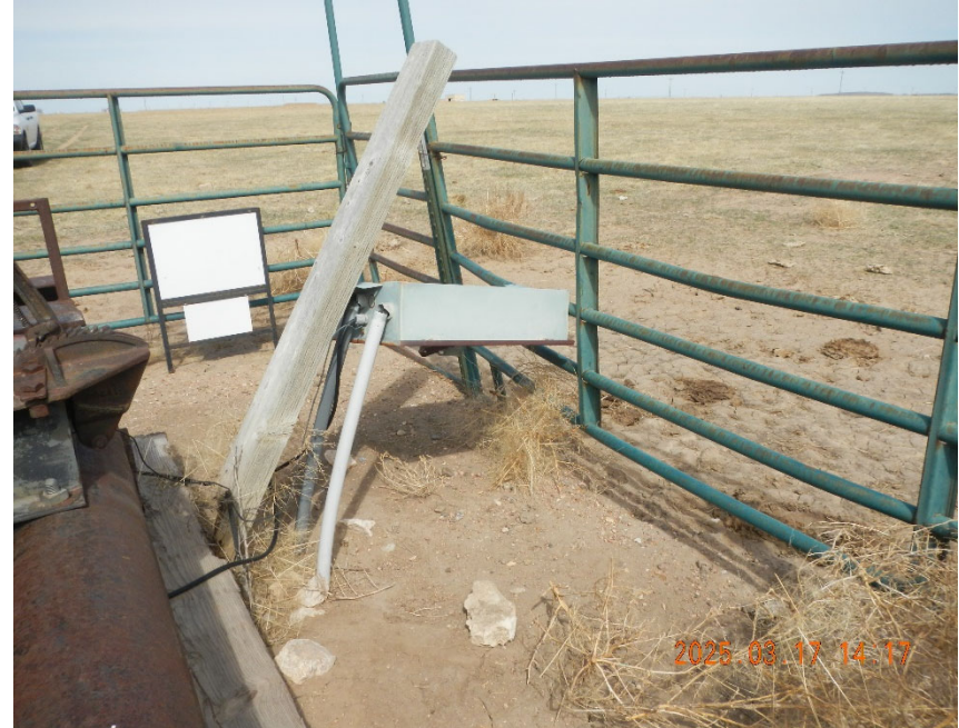
6. View of broken power panel post and panel as seen 03/17/2025.