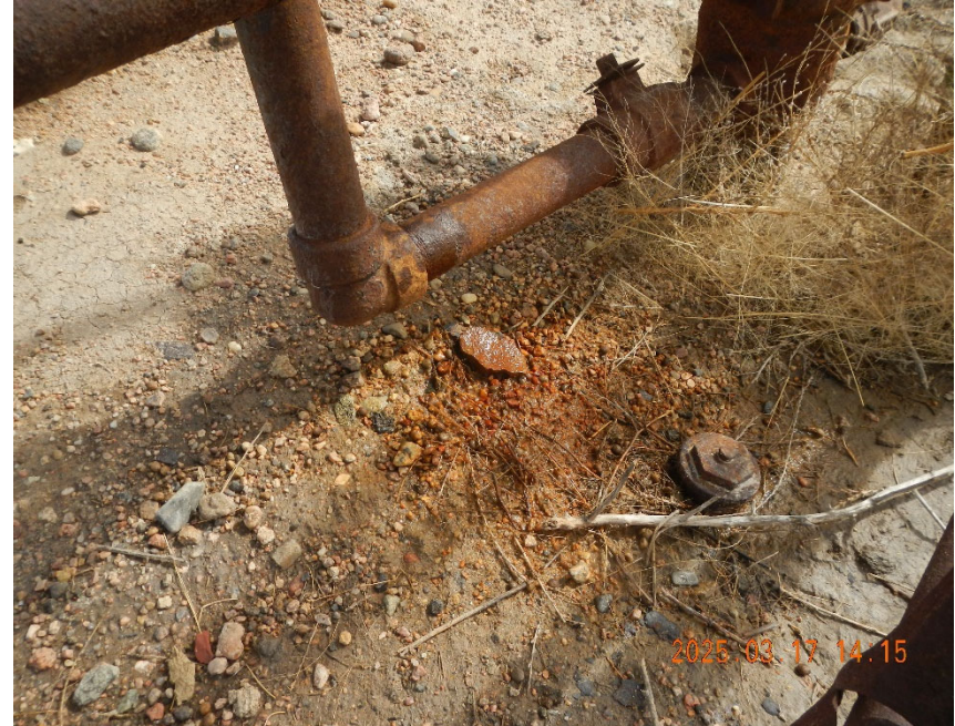
10. View of area below leaking check valve as spill release point. Note check valve cap on ground.