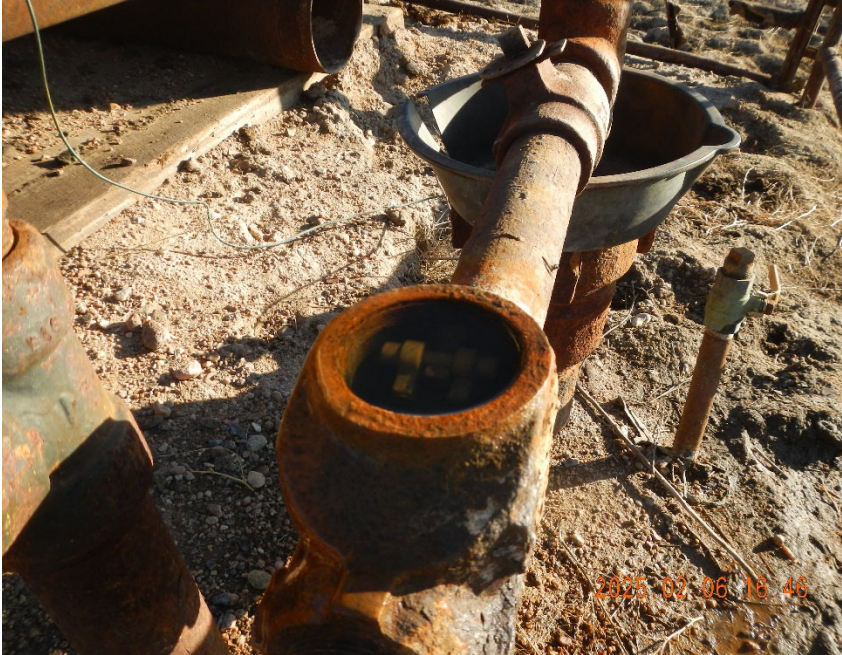
7. View of check valve with missing cap as seen 02/06/2025.