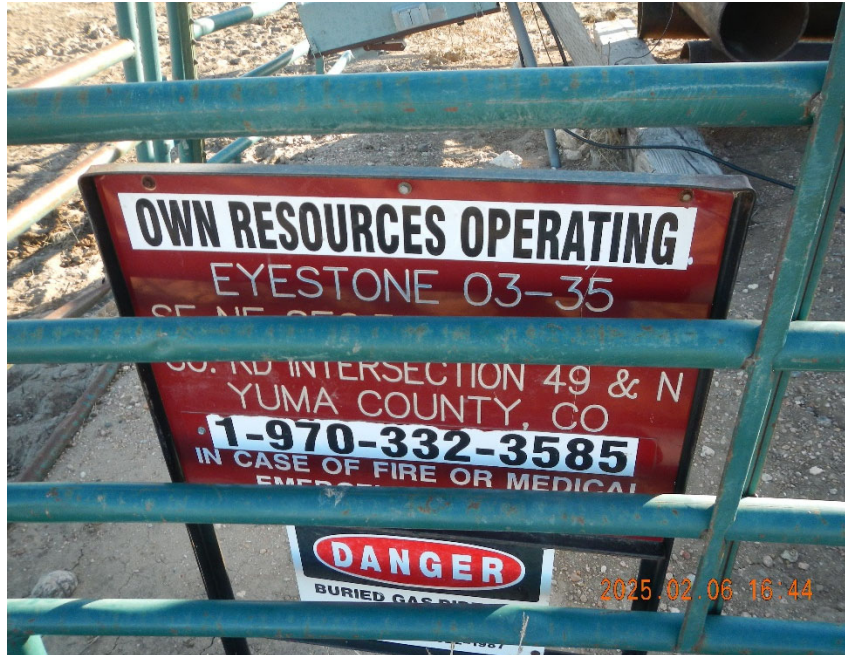
1. Lease sign at well location as seen 02/06/2025.