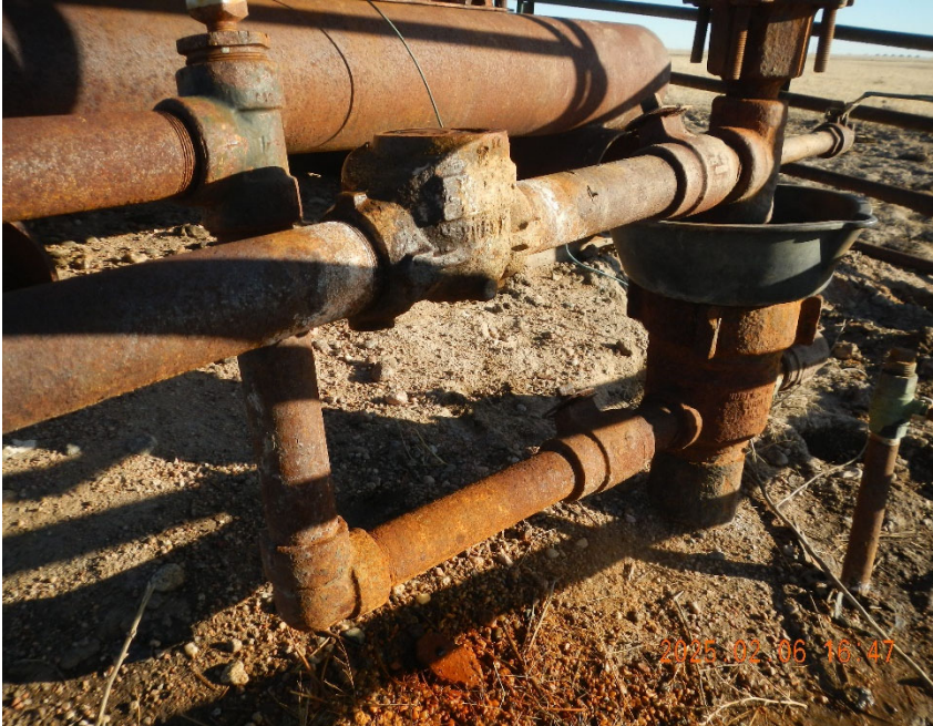
9. View of leaking check valve as spill release point as seen 02/06/2025.