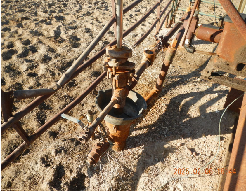
3. View of wellhead as seen 02/06/2025.