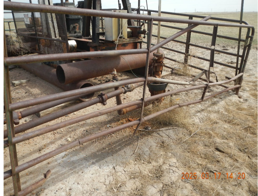
4. View of wellhead area as seen 03/17/2025. Note saturated soil around wellhead.