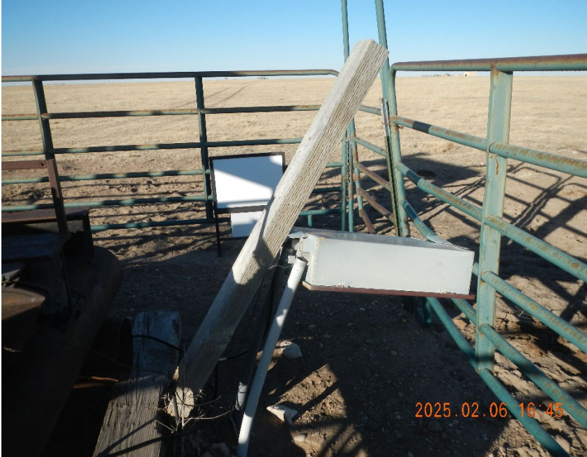
5. View of broken power panel post and panel as seen 02/06/2025.