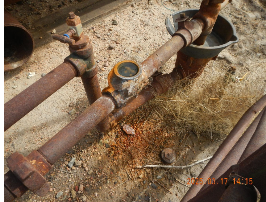
8. View of check valve with missing cap as seen 03/17/2025. Note check valve cap on ground at edge of rust stain.