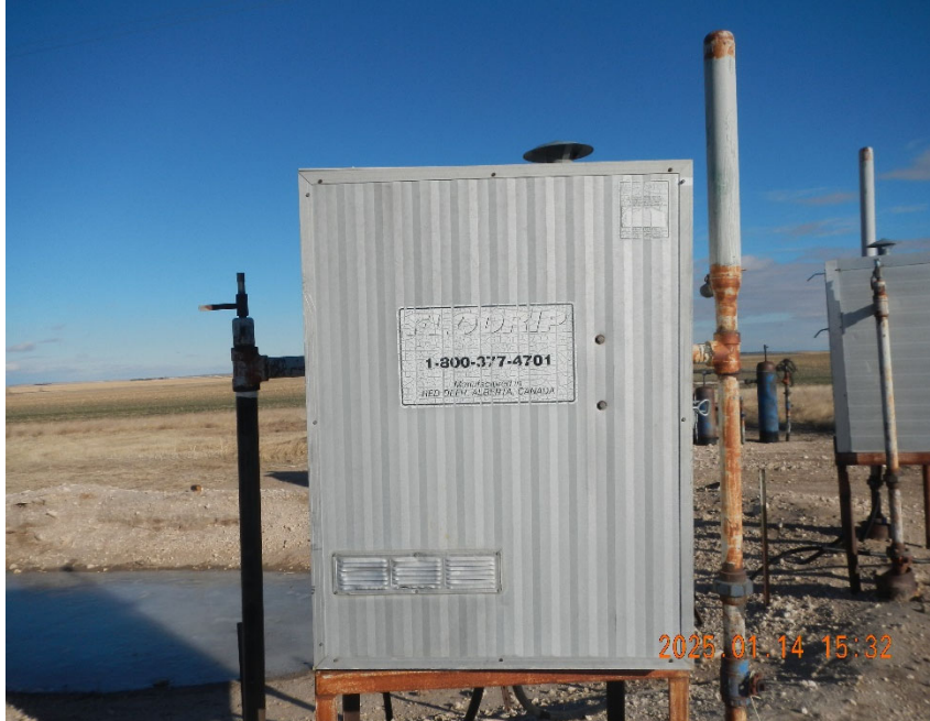
3. Separation equipment as seen 01/14/2025.