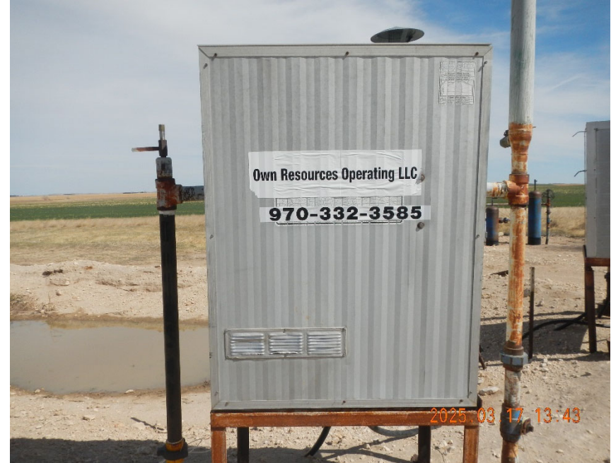
4. Separation equipment as seen 03/17/2025. Operator and contact information added. No associated well information.