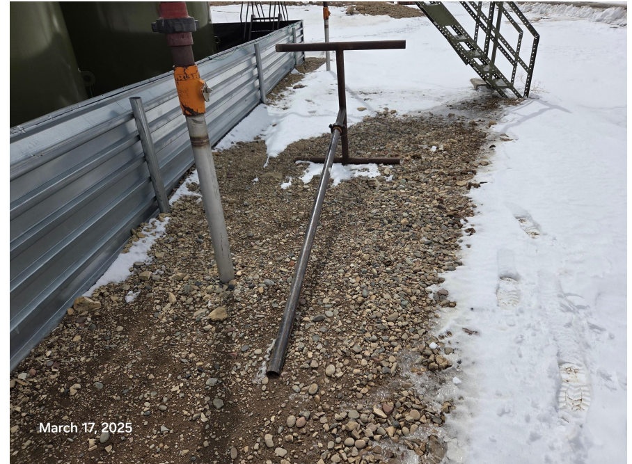
Photo 5: Various trash, debris and/or unused equipment observed on the Location.