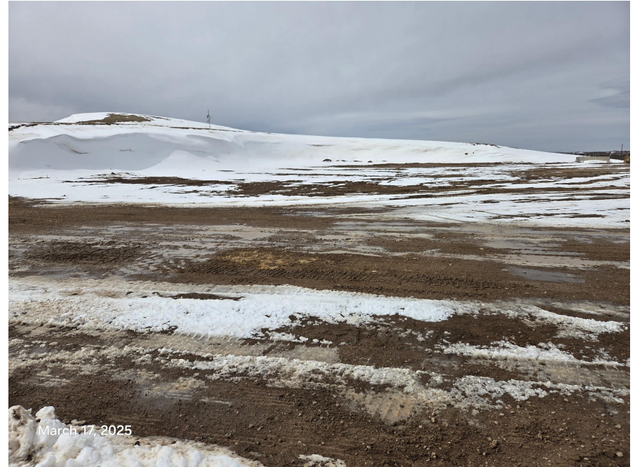
Photo 3: Photos examples showing areas on the east, and southwest end of the Location that are subject to 1003 reclamation requirements.