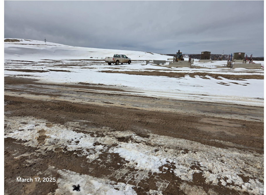
Photo 1: Photos 1-2 taken from the east end of the Location. Photos provide an overview from north, northeast, southeast to south.