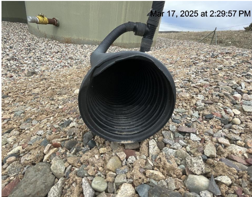
Photo # 4760 Flowline heating insulation open ended /wildlife hazard/available for entry by wildlife