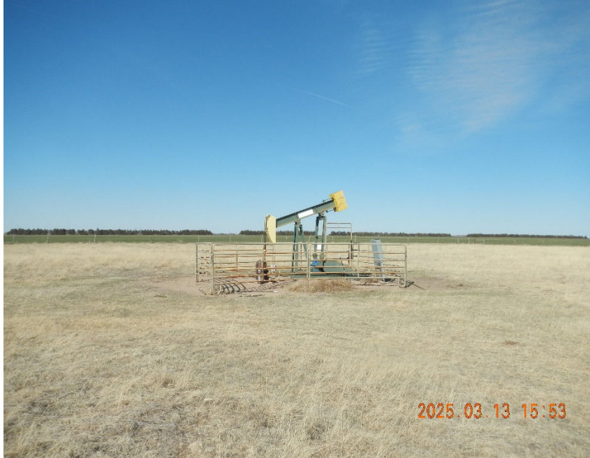
3. Well location overview.