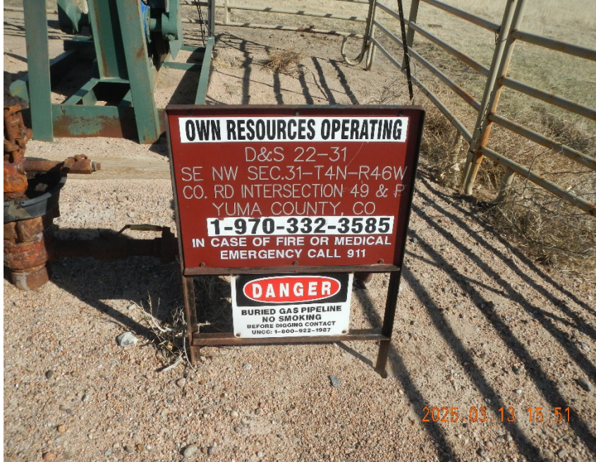
1. Lease sign at well location.