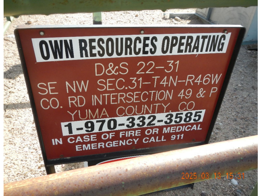
4. Lease sign at gathering location.