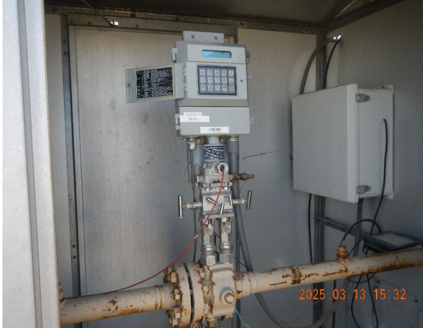
5. Gas meter inside meter shed.