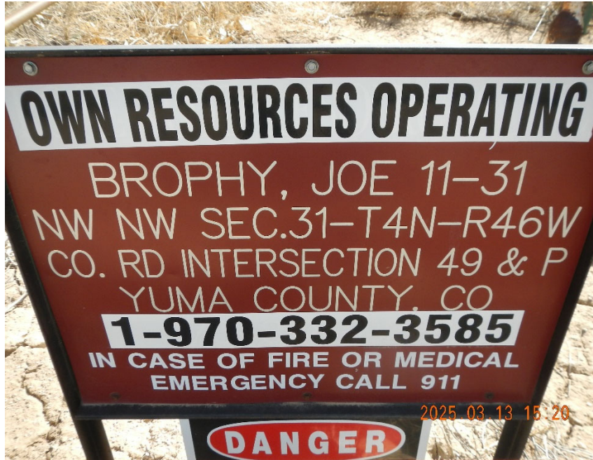
5. Lease sign at gathering location.