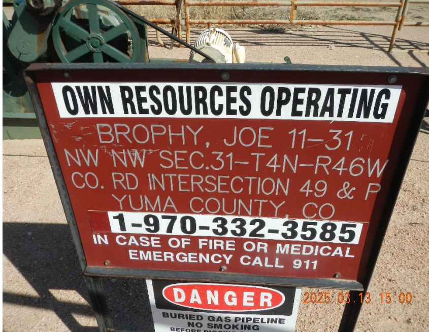
1. Lease sign at well location.