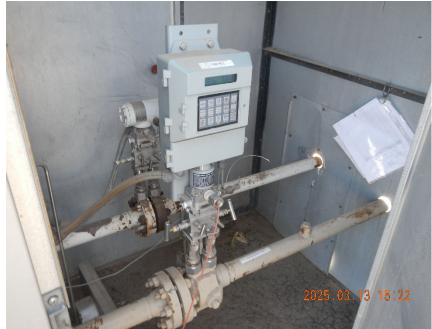
6. Gas meter inside meter shed.