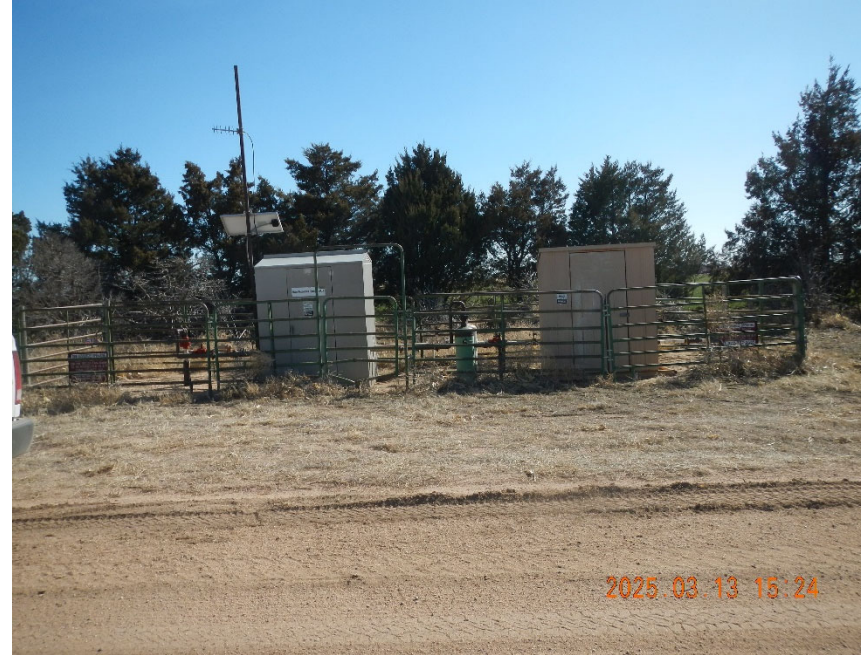
8. Gathering location overview.