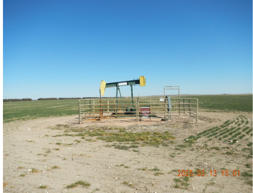
4. Well location overview.