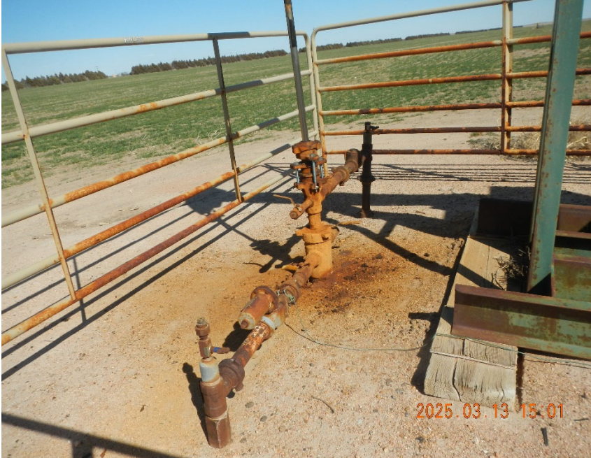
3 Additional view of wellhead. Note stained soil around wellhead.