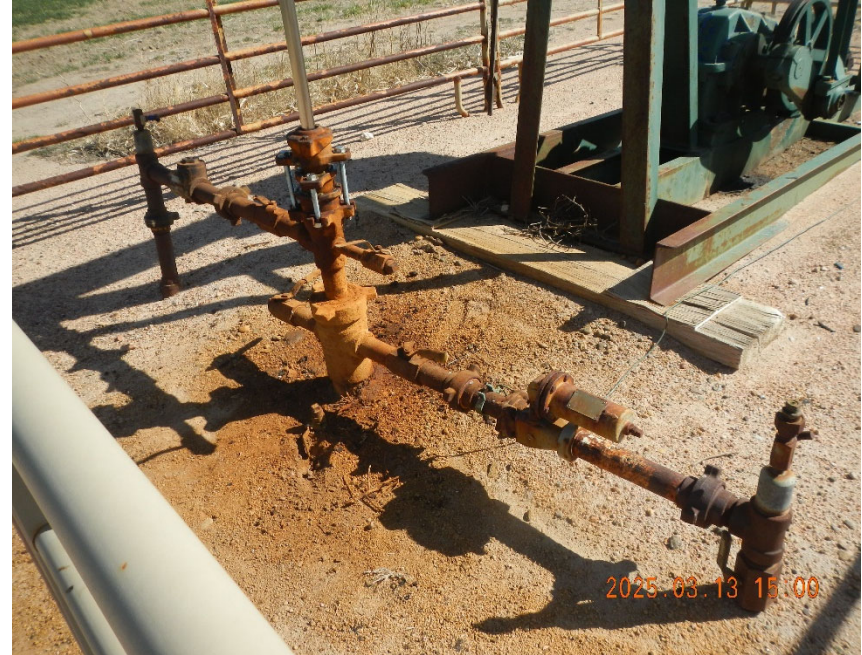
2. View of wellhead. Note stained soil around wellhead.