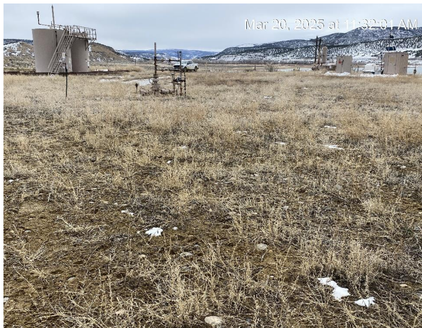
Location from North corner