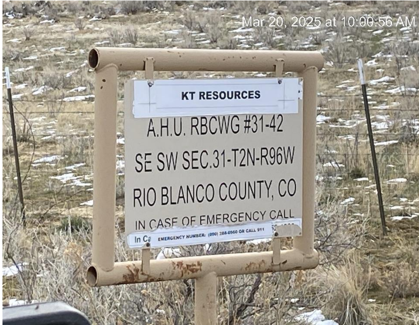
When replaced additional information is required