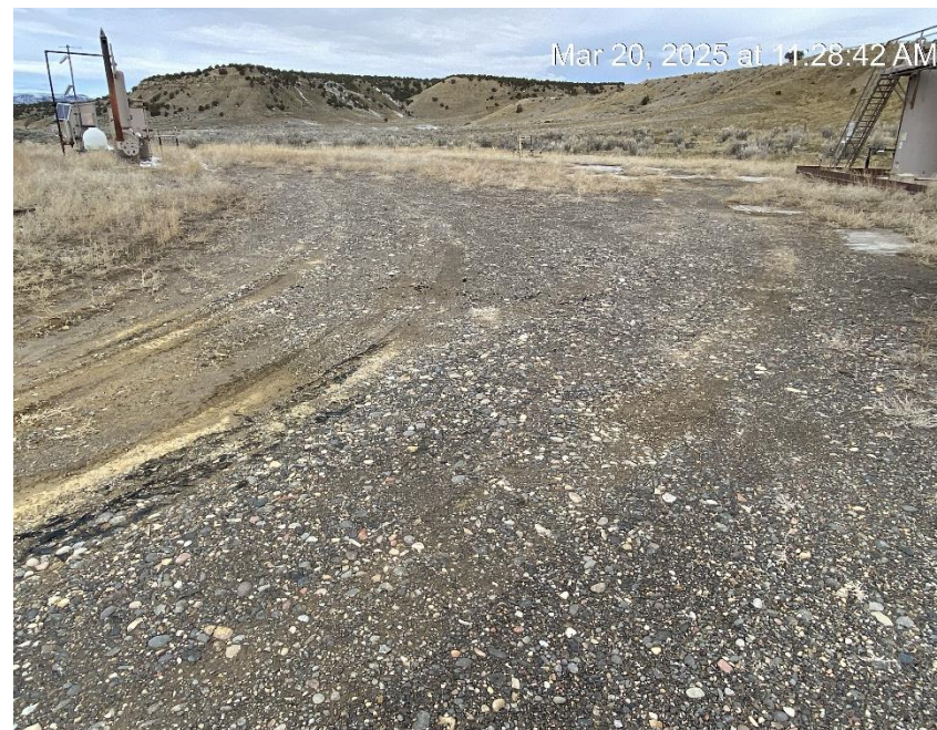
Location from South entrance