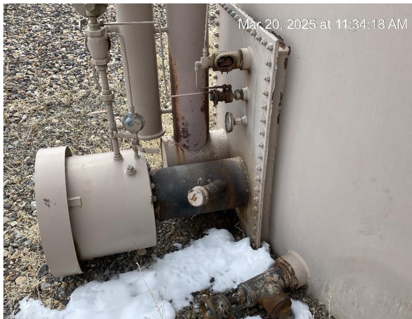
Leaking equipment. Oily waste below burner.