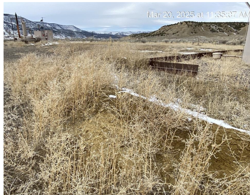
Location from East corner