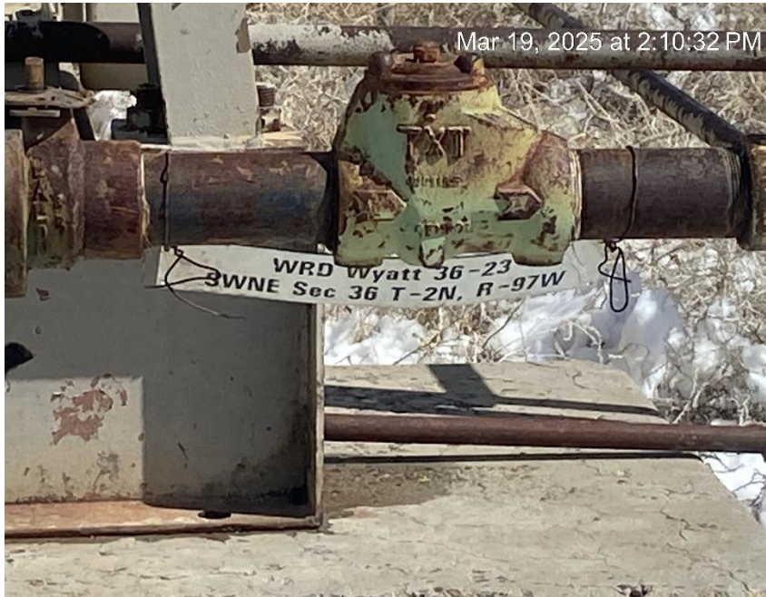
Missing required information