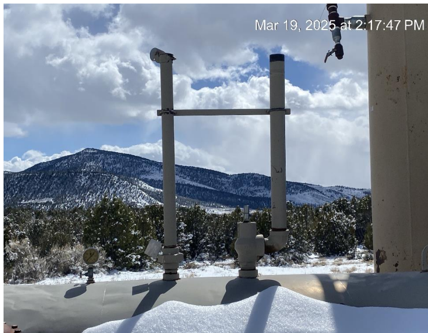
Unprotected relief vent riser