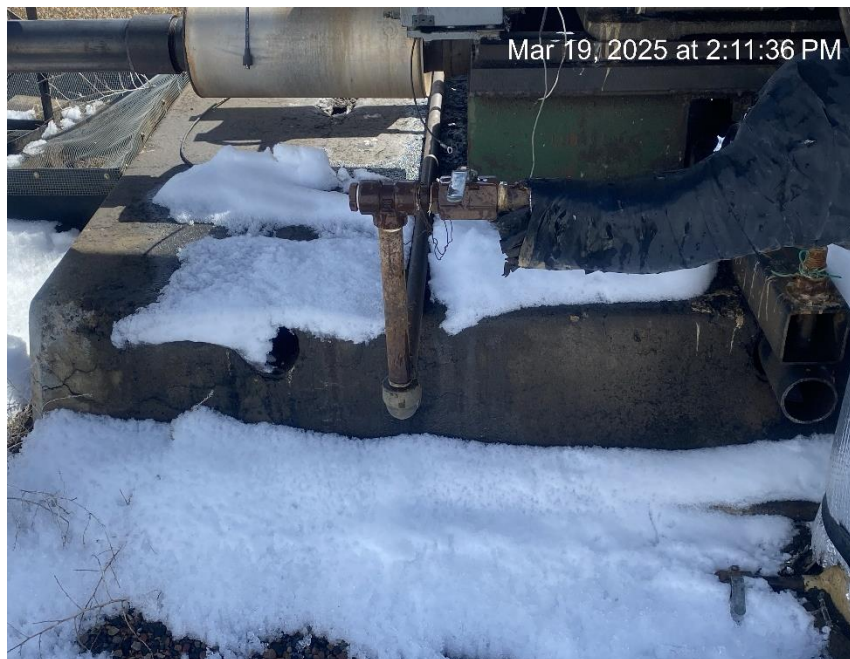
Oily waste and staining