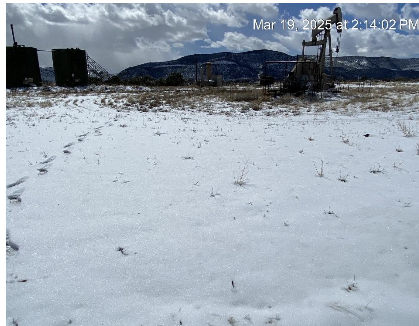
Location from Northeast corner