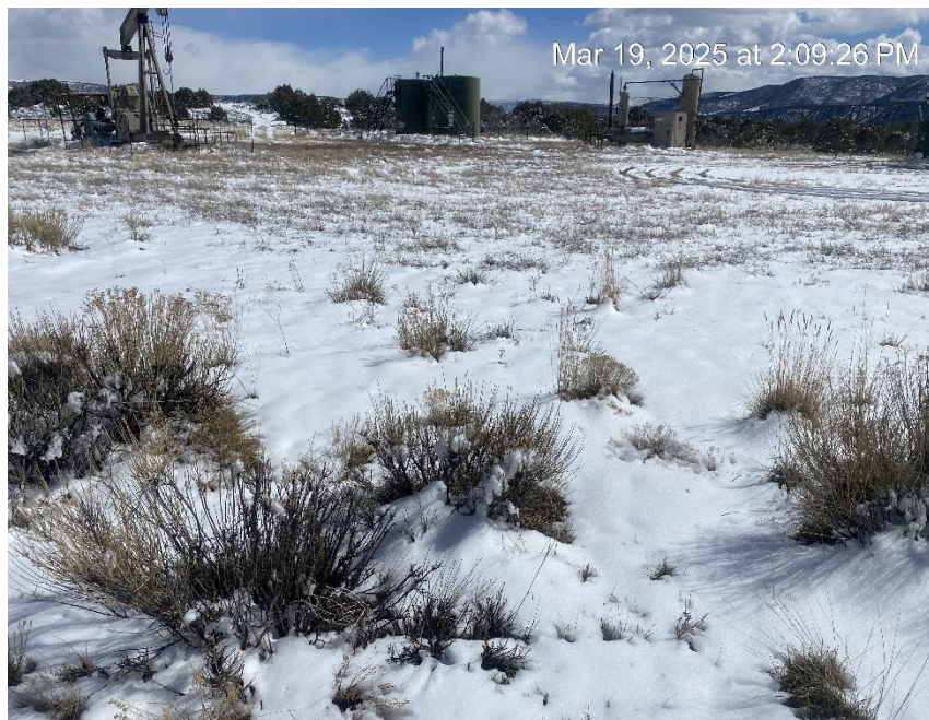
Location from Northwest corner