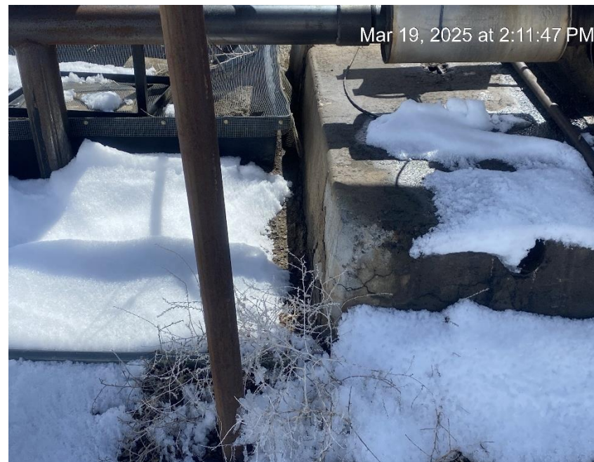
Oily waste and staining