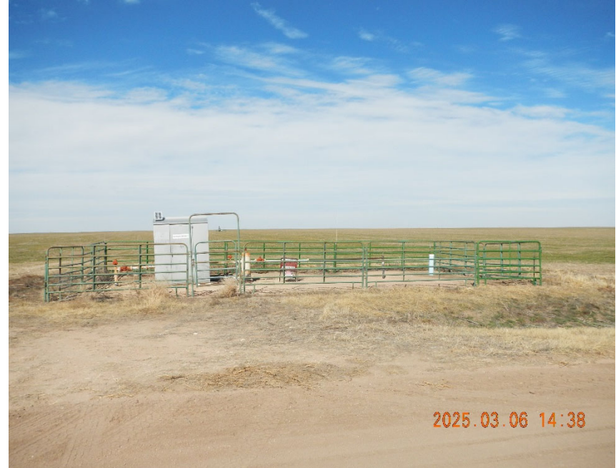
8. Gathering location overview.