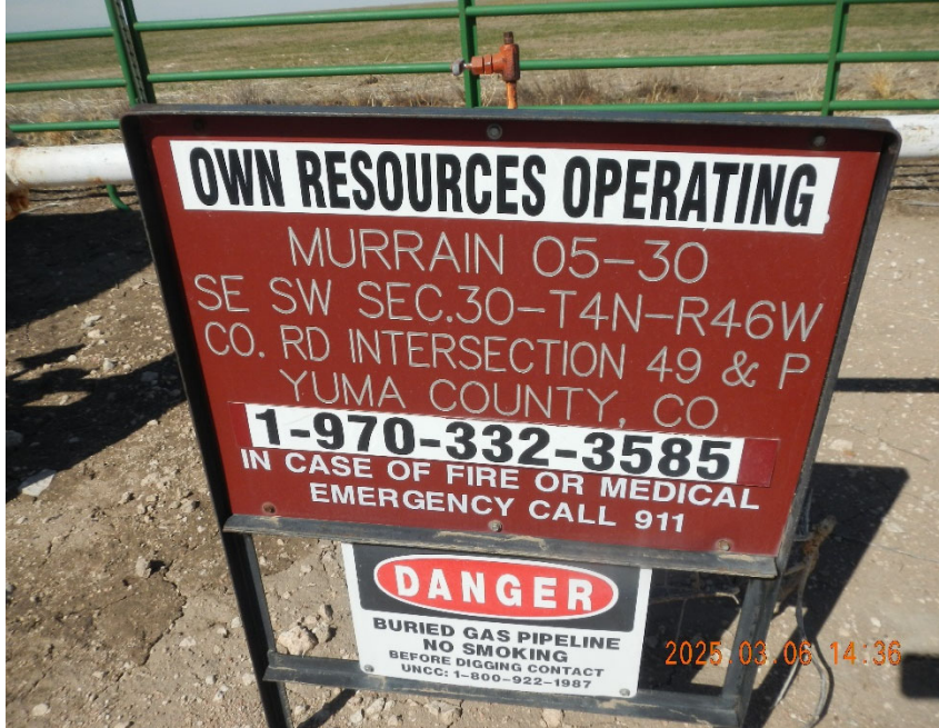
5. Lease sign at gathering location.