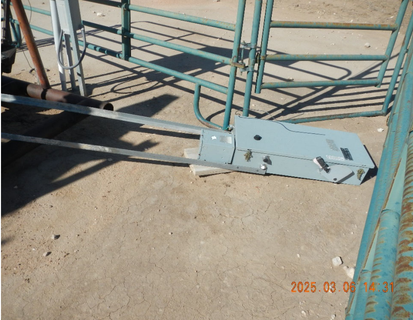
3. Disconnected power and control panel on ground inside well fencing.