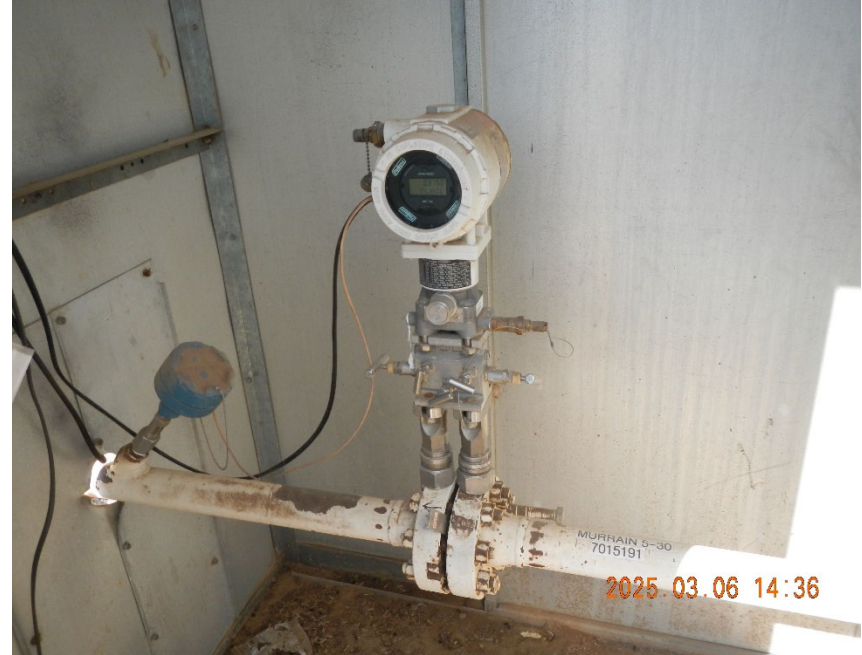
6. Gas meter inside meter shed.