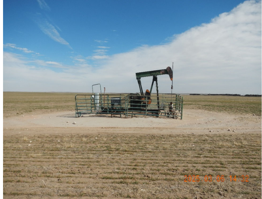
4. Well location overview.