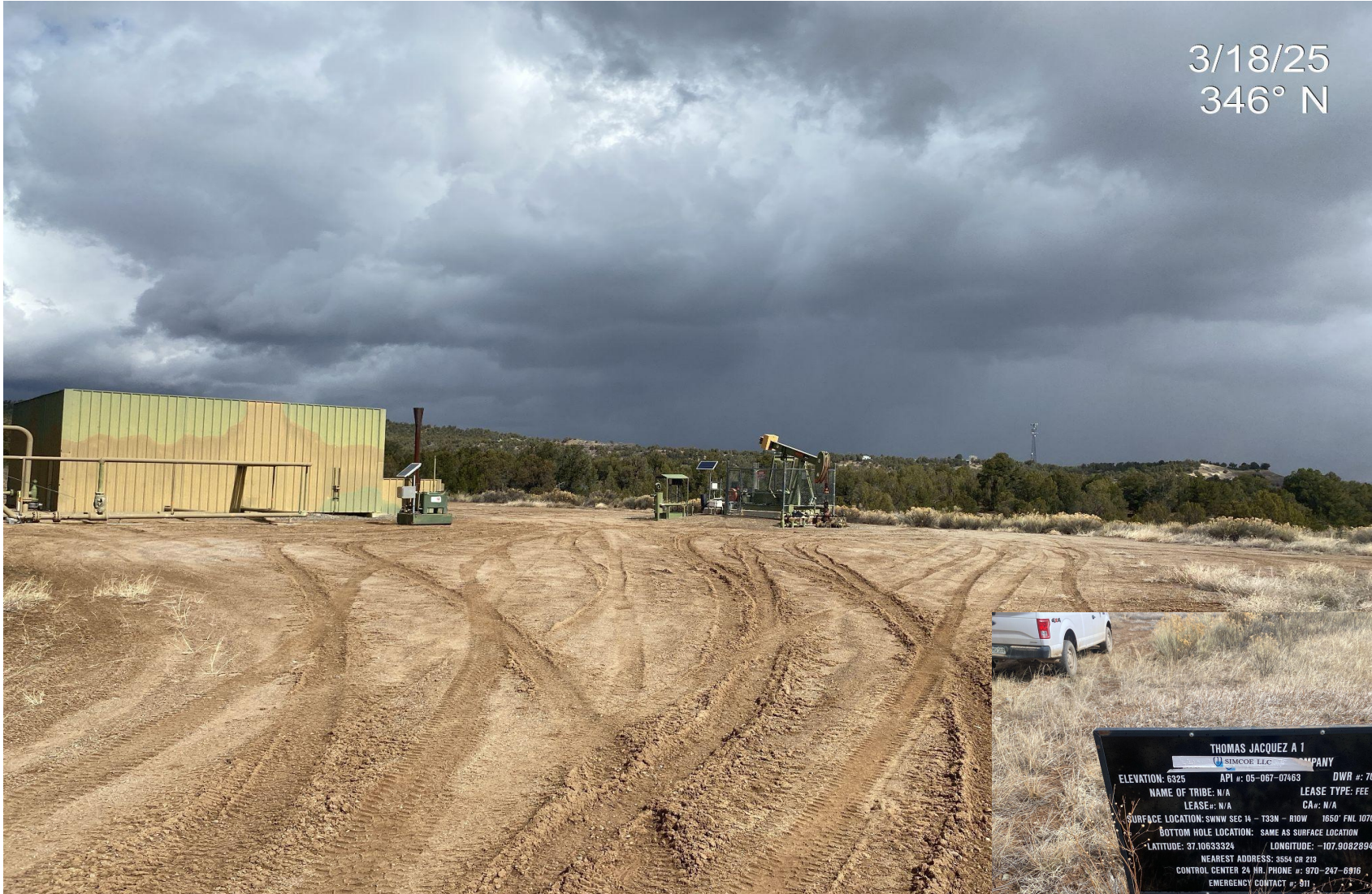
Photo 1. View of well pad taken from the access point facing center.