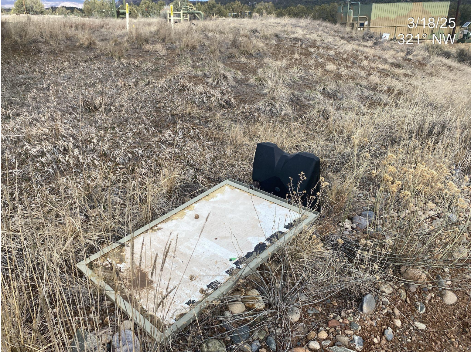
Photo 4. Unused sign/trash observed along the access point to the location.