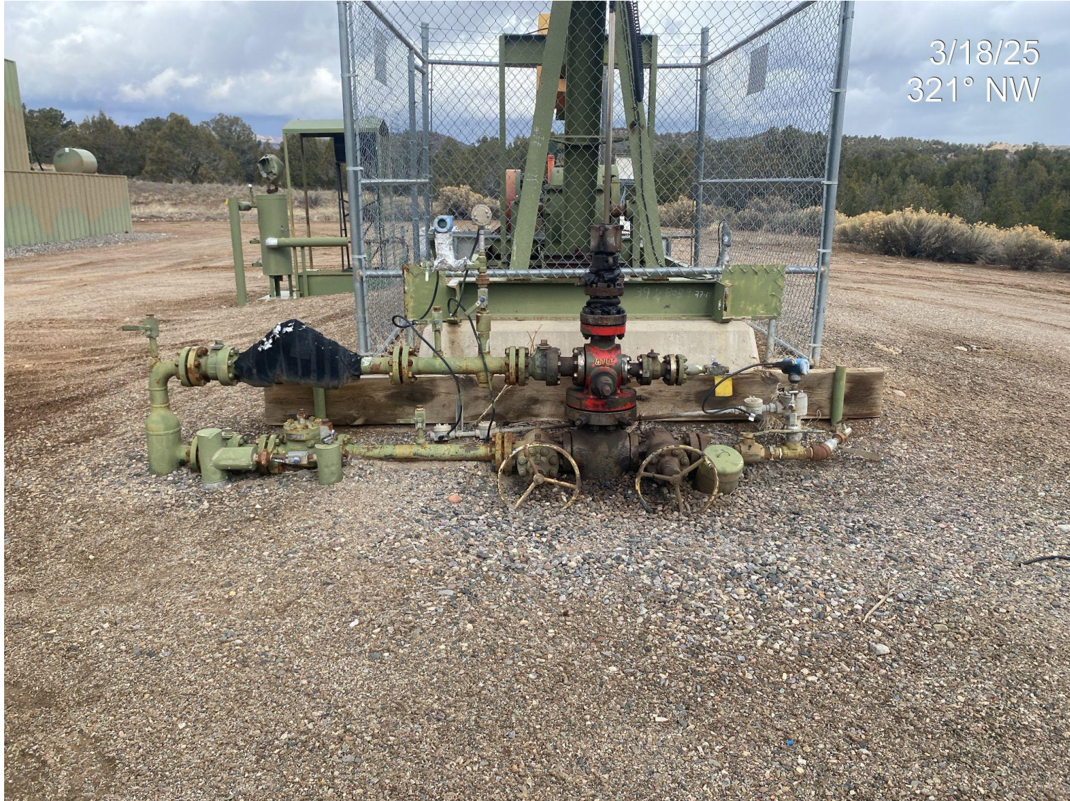
Photo 3. Stained soils/gravel at wellhead have been removed.