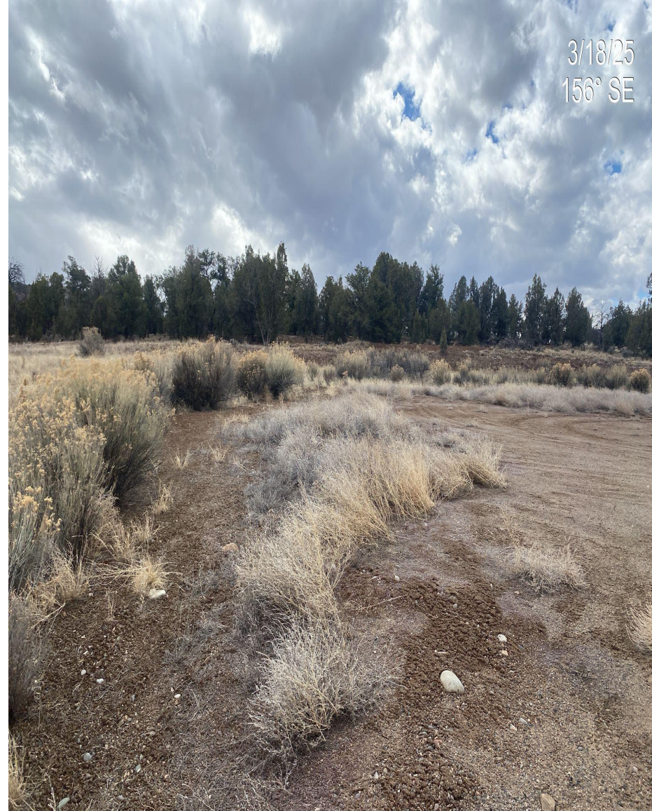
Photo 2. View of weedy kochia and russian thistle debris observed on the edge of the active pad.