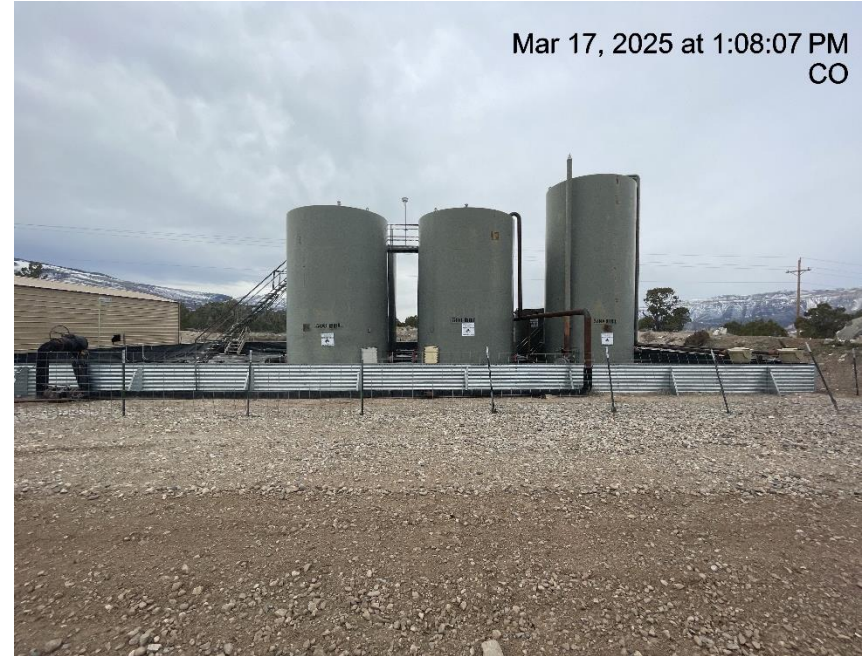
Photo # 4656 Battery lacks required signage/not in compliance with CECMC rules