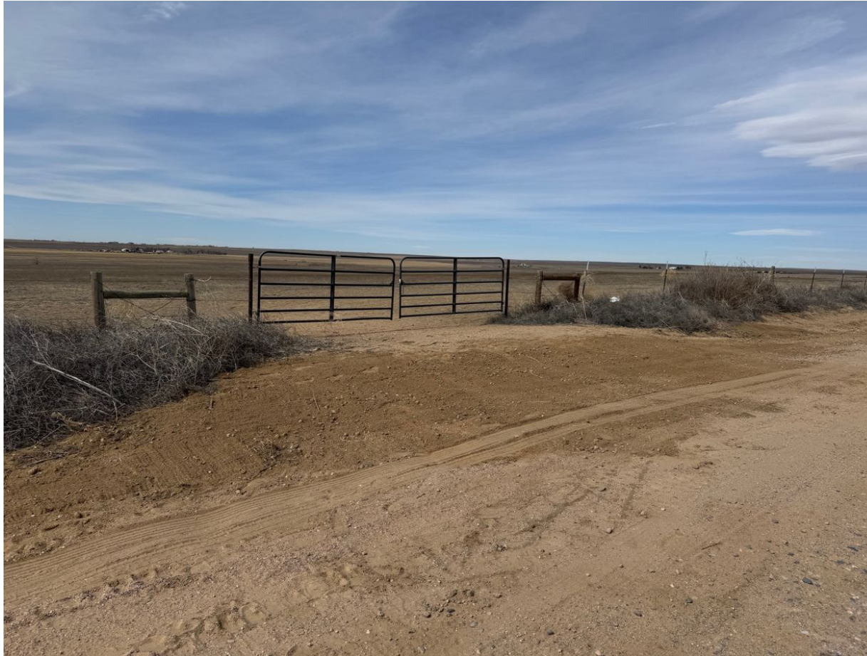
Photo 3. Photo taken by the Operator on March 11, 2025 from the well location entrance of CR85, facing Northwest. Photo illustrates that the Operator removed the culvert per Rule 1004.a.