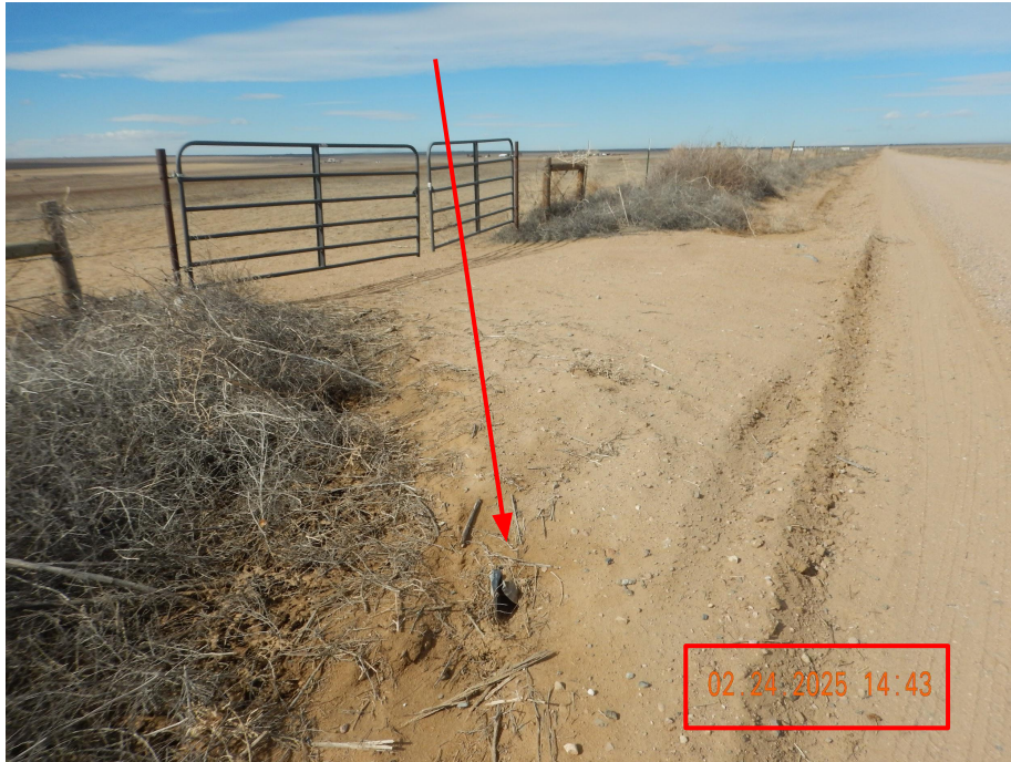
Photo 1. Photo taken from the well location entrance of CR85 on February 24, 2025, facing North. Photo illustrates the culvert has not been removed per Rule 1004.a.