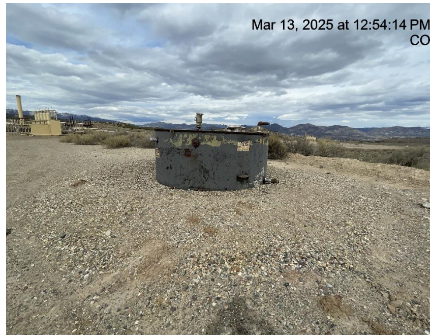
Photo # 3028 Secondary containment insufficient/does not comply with CECMC rules