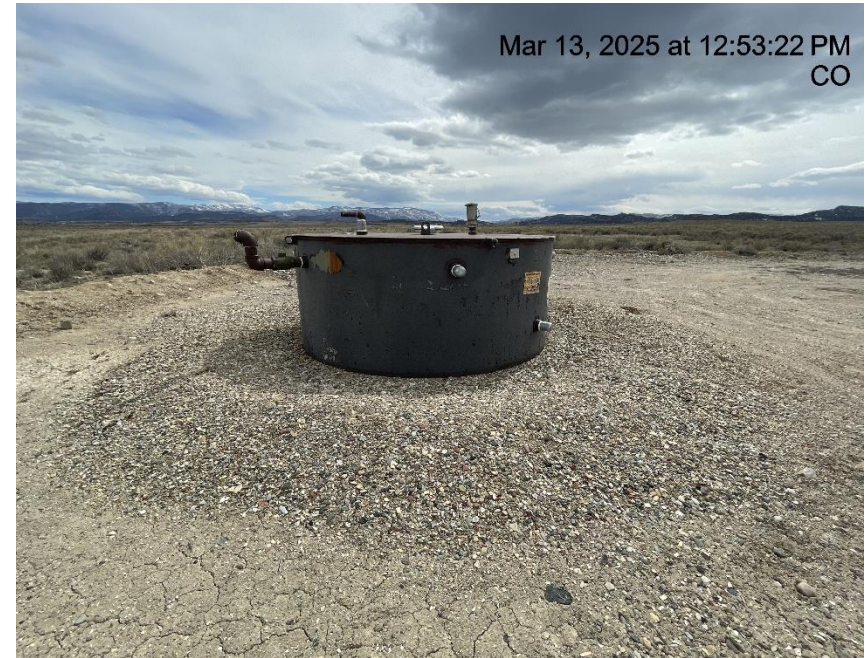
Photo # 3026 Secondary containment insufficient/does not comply with CECMC rules