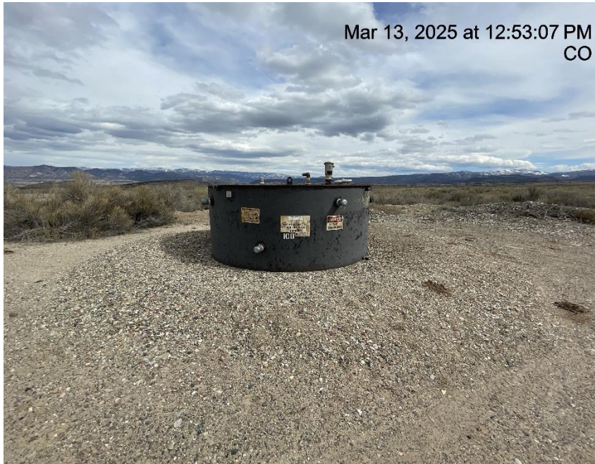
Photo # 3025 Secondary containment insufficient/does not comply with CECMC rules