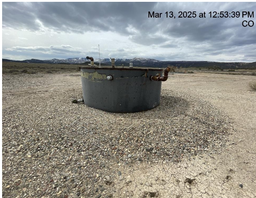
Photo # 3027 Secondary containment insufficient/does not comply with CECMC rules