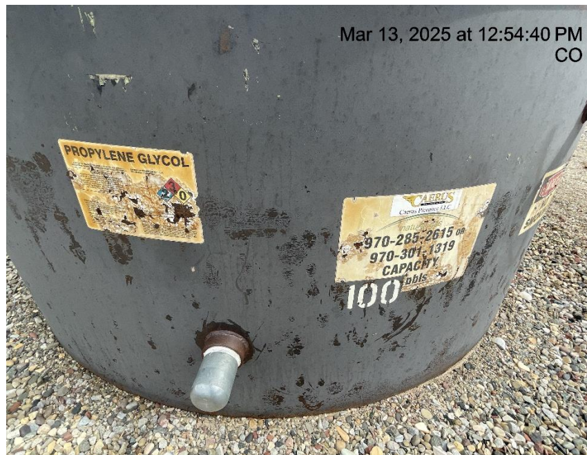
Photo # 3029 Tank labels damaged & additionally tank capacity is incorrect