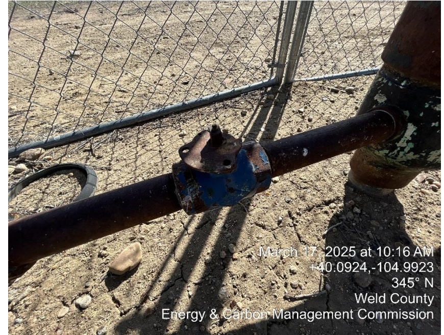
Valve Appears to be SI