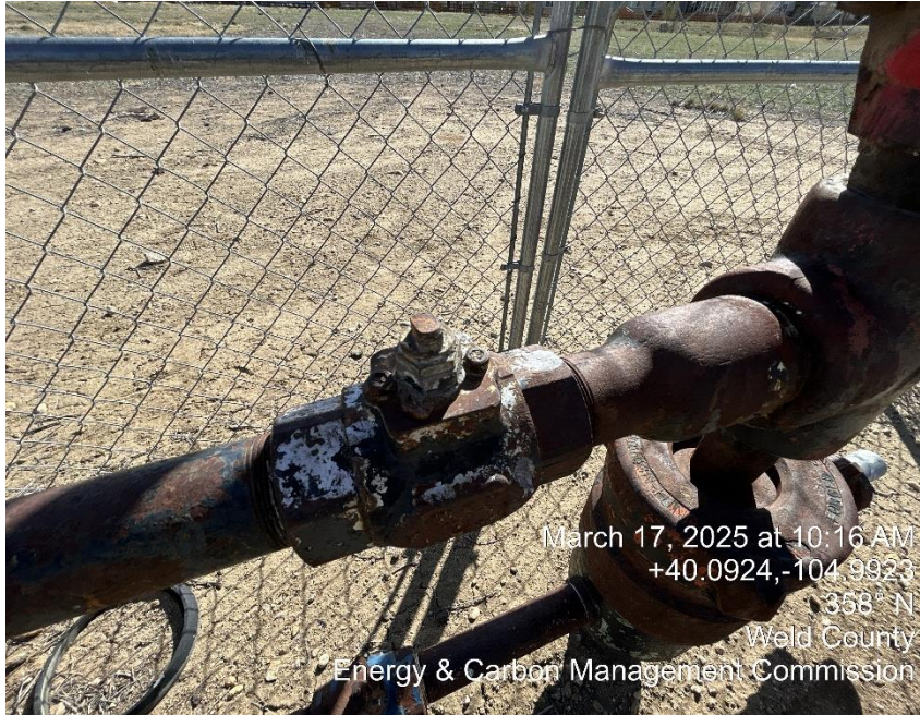
Valve Appears to be SI