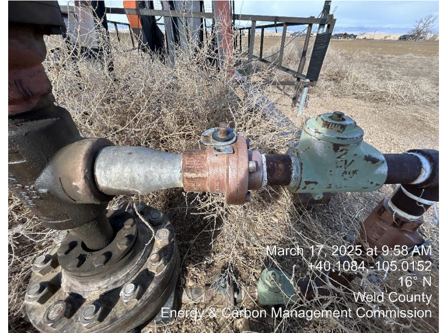
Valve appears to be shut in