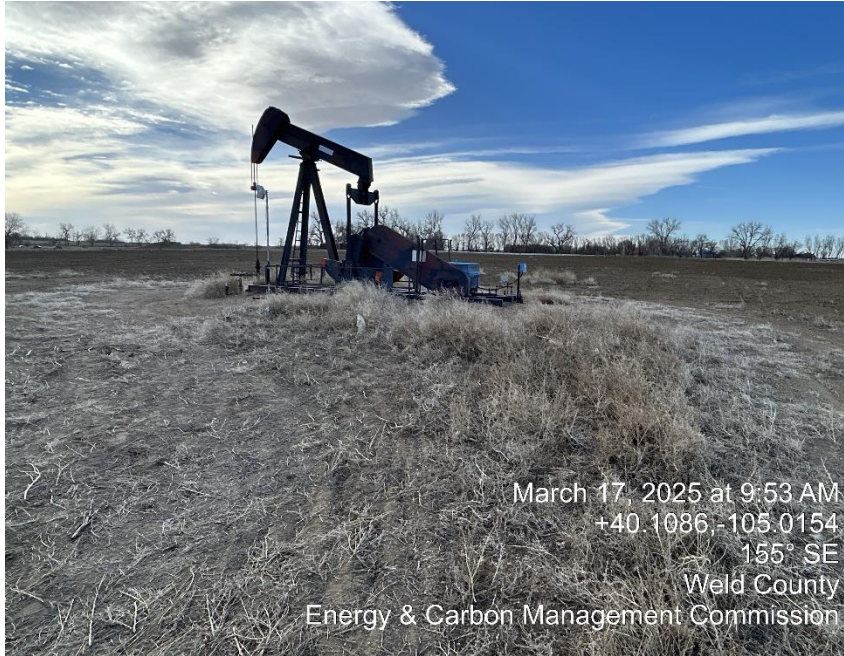
Well & Overgrown Vegetation