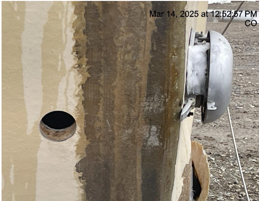
Photo # 4340 Unsecured opening on tank/wildlife hazard /available for entry by wildlife