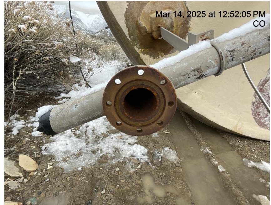
Photo # 4333 Unsecured flange/wildlife hazard/available for entry by wildlife