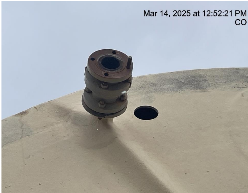
Photo # 4338 Unsecured opening on tank/wildlife hazard /available for entry by wildlife