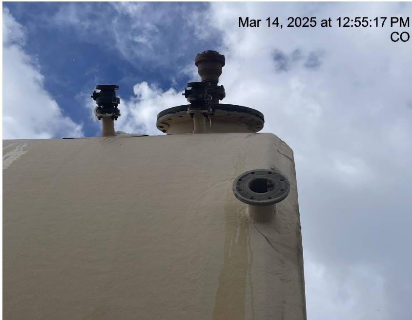
Photo # 4336 Unsecured tank flange/wildlife hazard /available for entry by wildlife