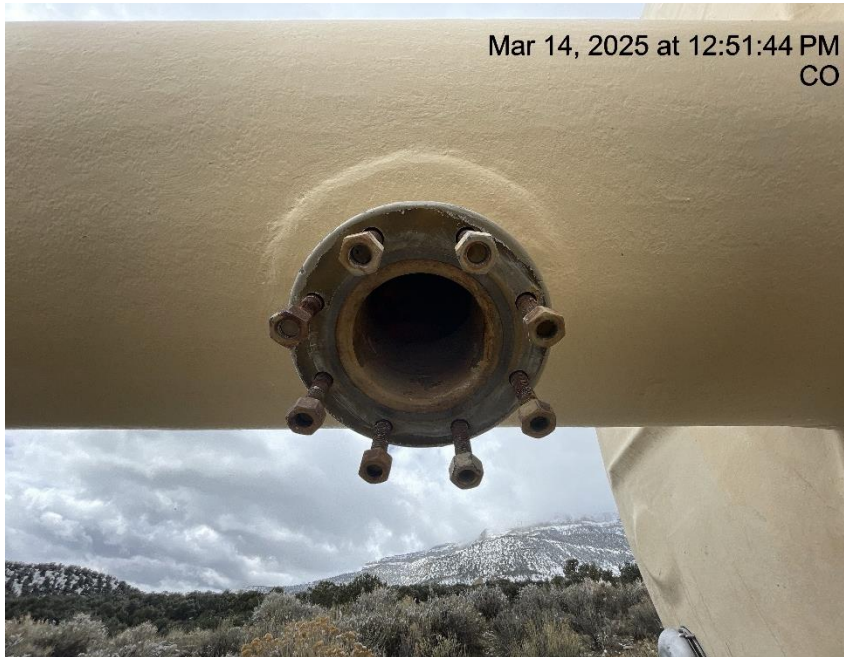
Photo # 4332 Unsecured flange/wildlife hazard/available for entry by wildlife