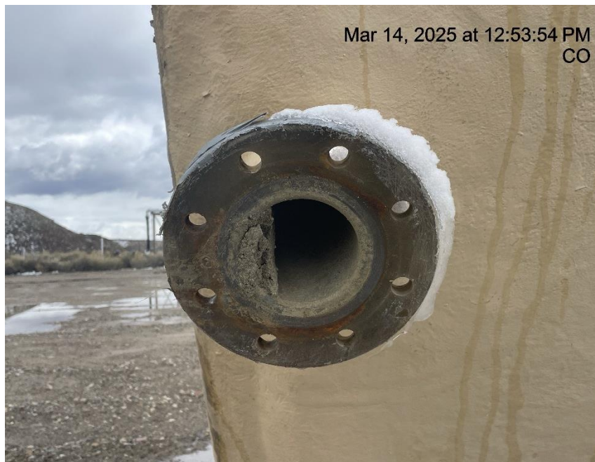
Photo # 4334 Unsecured tank flange/wildlife hazard /available for entry by wildlife