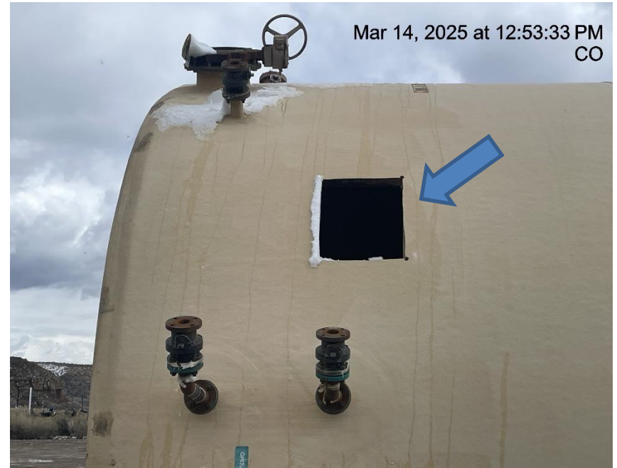
Photo # 4341 Unsecured opening on tank/wildlife hazard /available for entry by wildlife