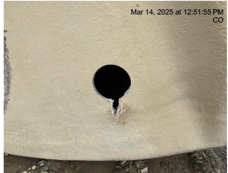
Photo # 4339 Unsecured opening on tank/wildlife hazard /available for entry by wildlife