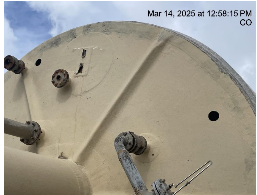
Photo # 4337 Multiple unsecured openings on tank/wildlife hazards/available for entry by wildlife