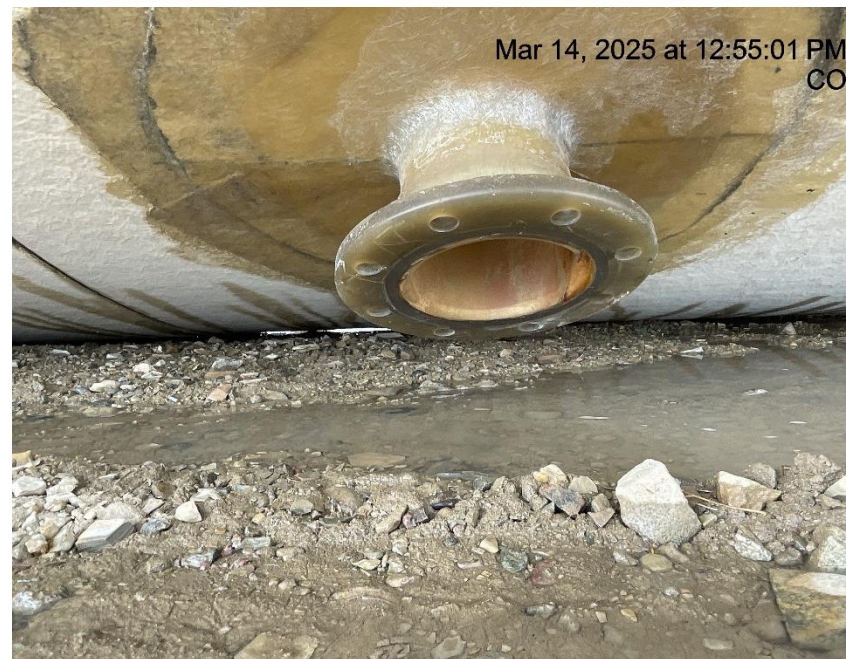
Photo # 4335 Unsecured tank flange/wildlife hazard /available for entry by wildlife