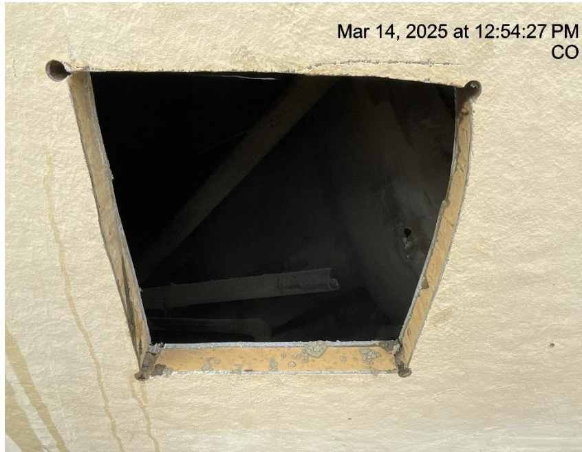
Photo # 4342 Unsecured opening on tank/wildlife hazard /available for entry by wildlife