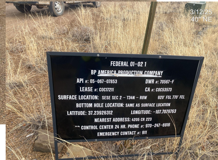
Photo 1. View of well location taken from the access point facing center. Note: current operator label has peeled off location sign.