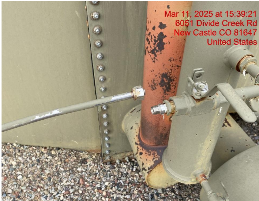
Unfastened Tubing – Photo #07215