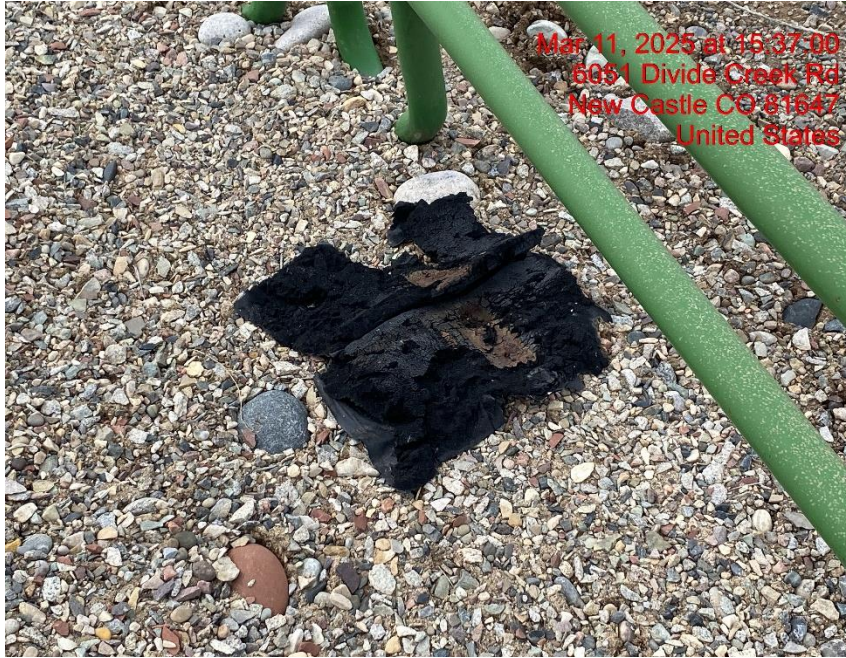
Trash – Photo #07203