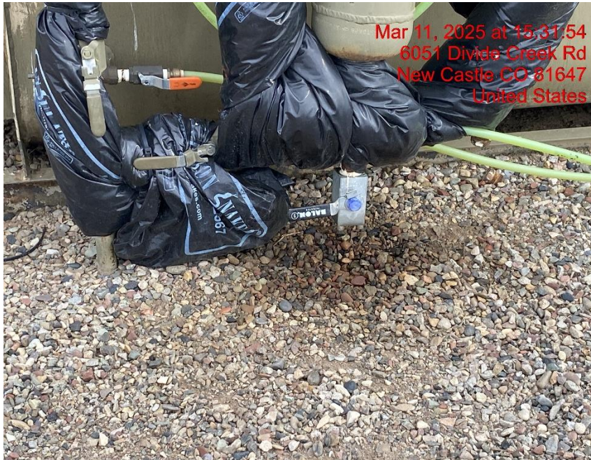
Stained Soil in Tank Containment – Photo #07186