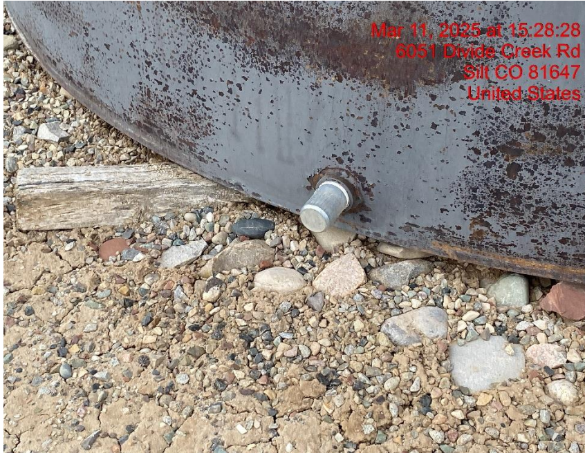
Unused Equipment – Photo #07181