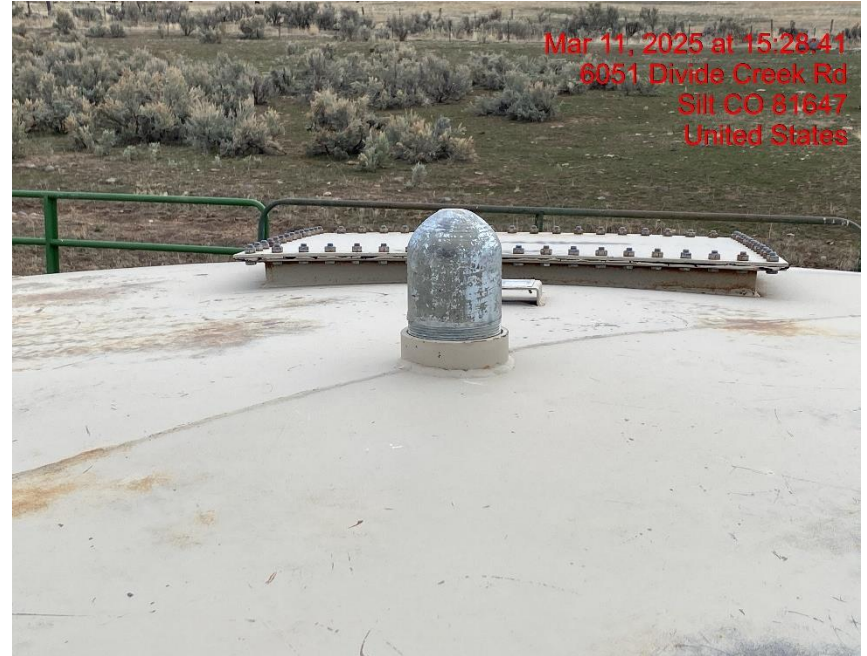
Unused Equipment – Photo #07182