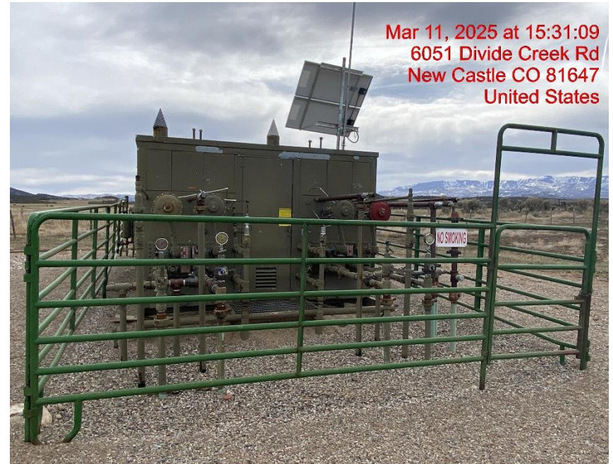
Location – Photo #07184