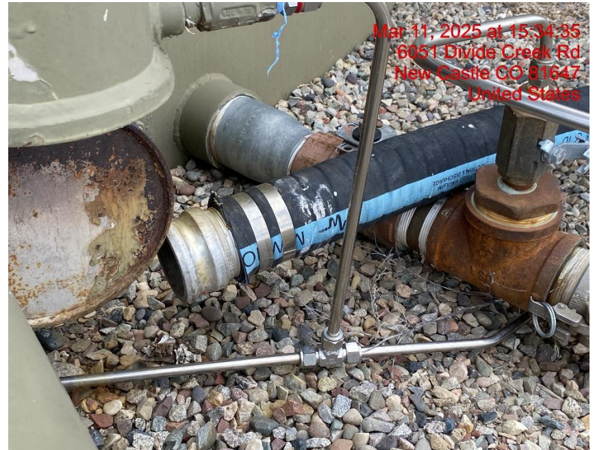
Stored Supplies/Wildlife Entry Hazard – Photo #07194