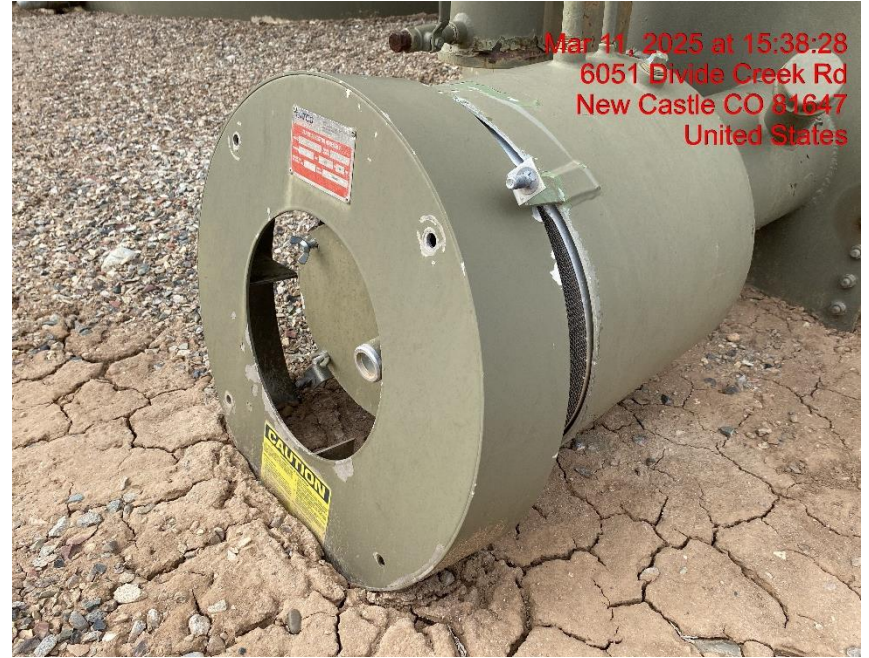
Unfastened Shroud – Photo #07212