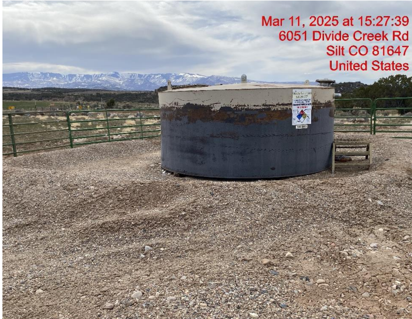
Unused Equipment – Photo #07179