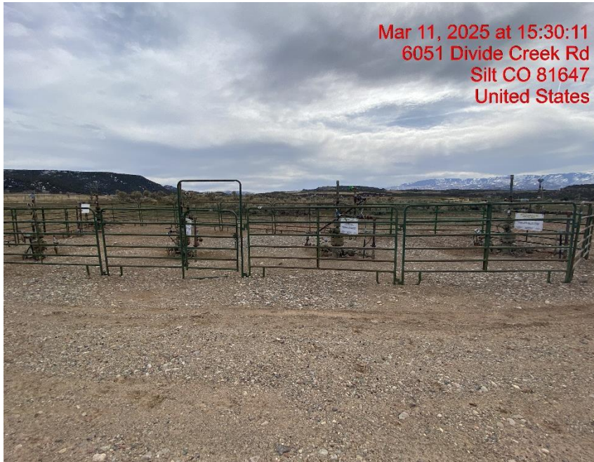
Location – Photo #07183