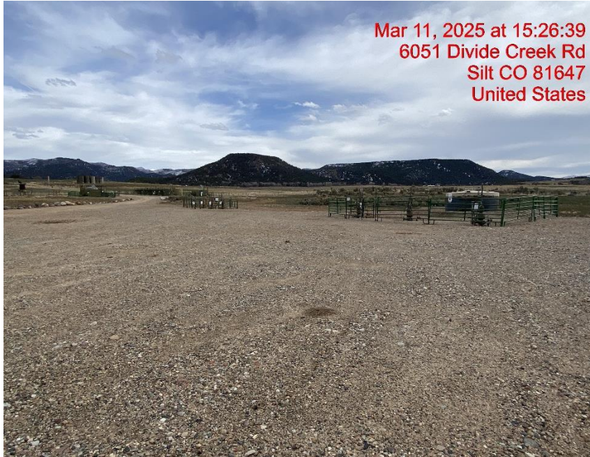
Location Overview – Photo #07177