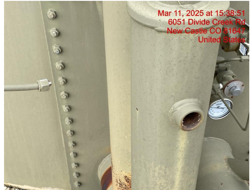
Unfastened Lines/Tubing – Photo #07214