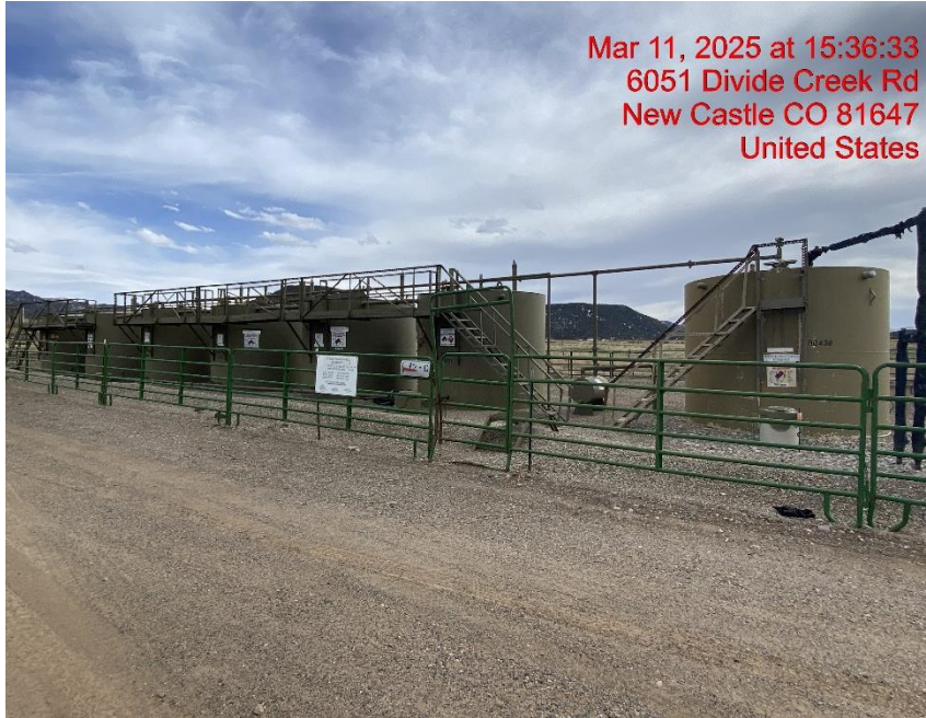
Location – Photo #07201