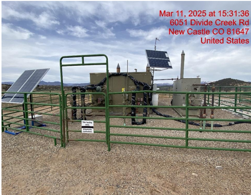
Location – Photo #07185