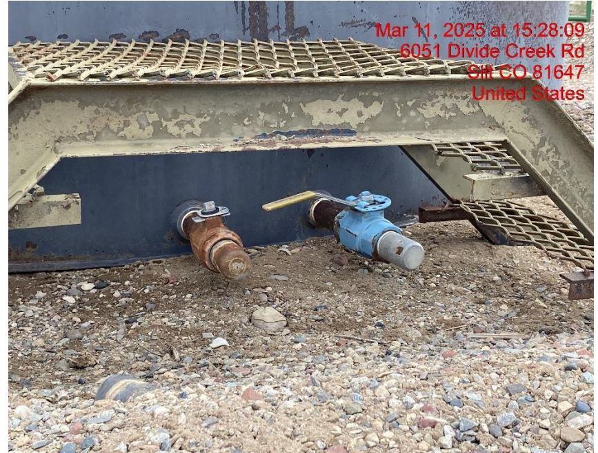
Unused Equipment – Photo #07180