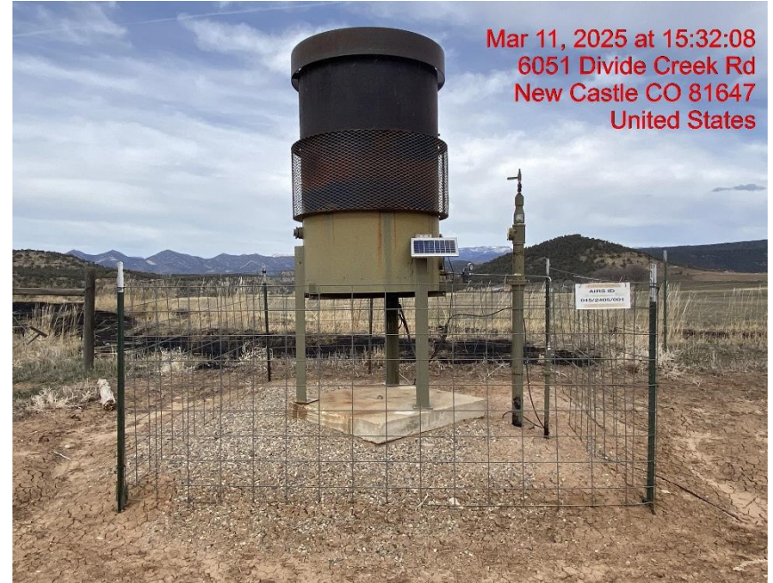
Location – Photo #07187