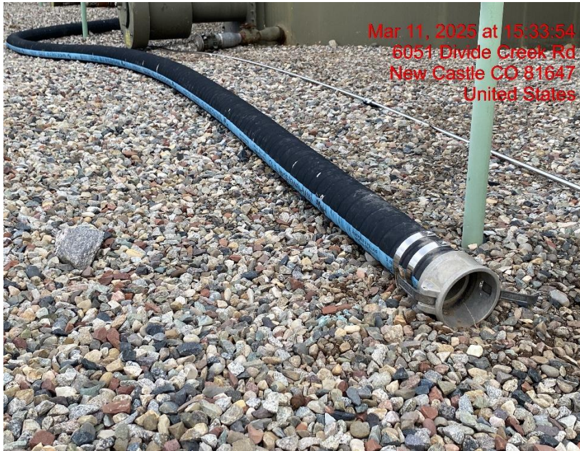
Stored Supplies/Wildlife Entry Hazard – Photo #07191