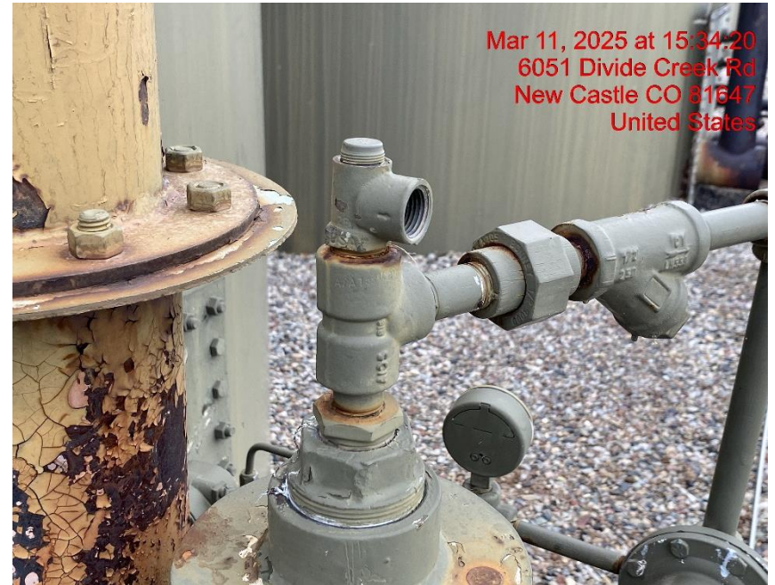
PRV Terminates in Unsafe Manner – Photo #07192