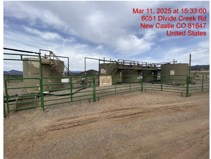
Location – Photo #07188