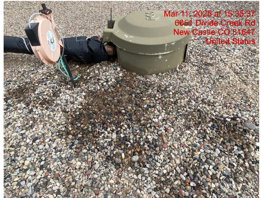
Stained Soil in Tank Containment – Photo #07198