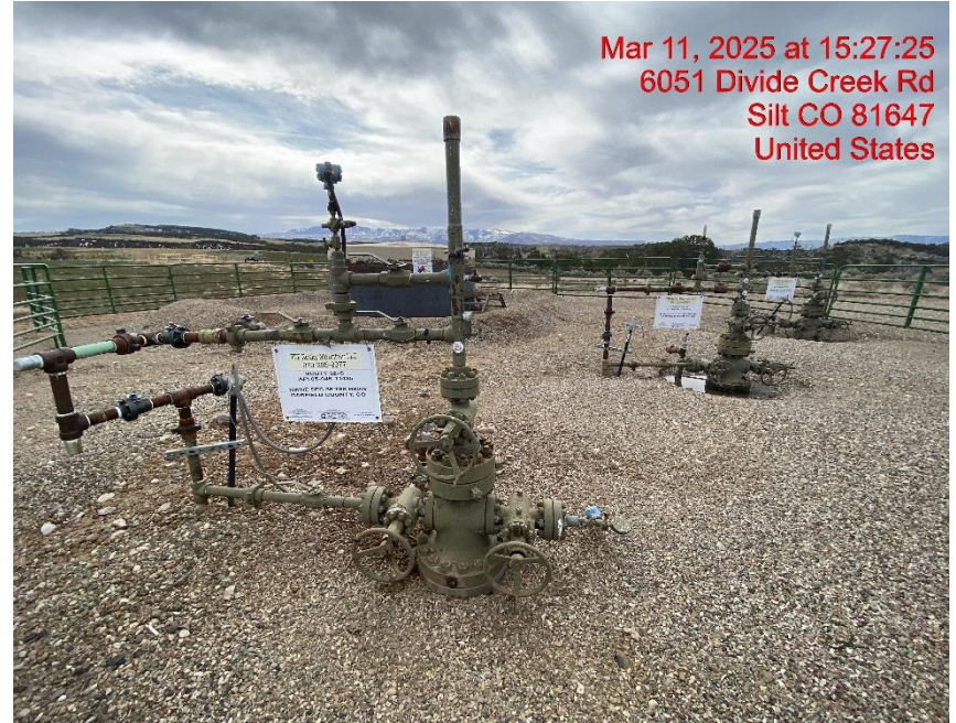
Location – Photo #07178