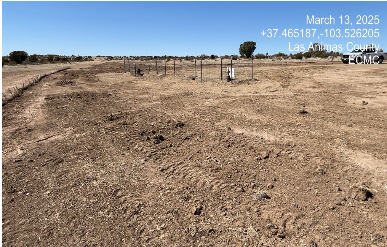
Photo 3. Facing northwest at the location. It appears the spill in this area was cleaned up but there was also fresh soil spread along this area.