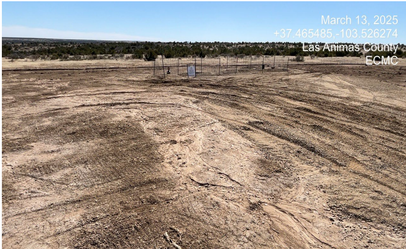
Photo 2. Facing southwest toward the wellsite. It appears clean up was performed but there still remains greyish material in this area.