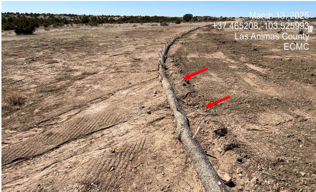
Photo 6. Facing west at south side of the location. There are signs of erosion undercutting the wattles which will require maintenance.