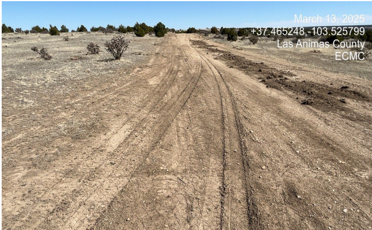
Photo 5. Facing east toward the flowline disturbance. There are fresh vehicle tracks which are causing unnecessary disturbance. This will require signage and BMP's to prevent vehicle access.