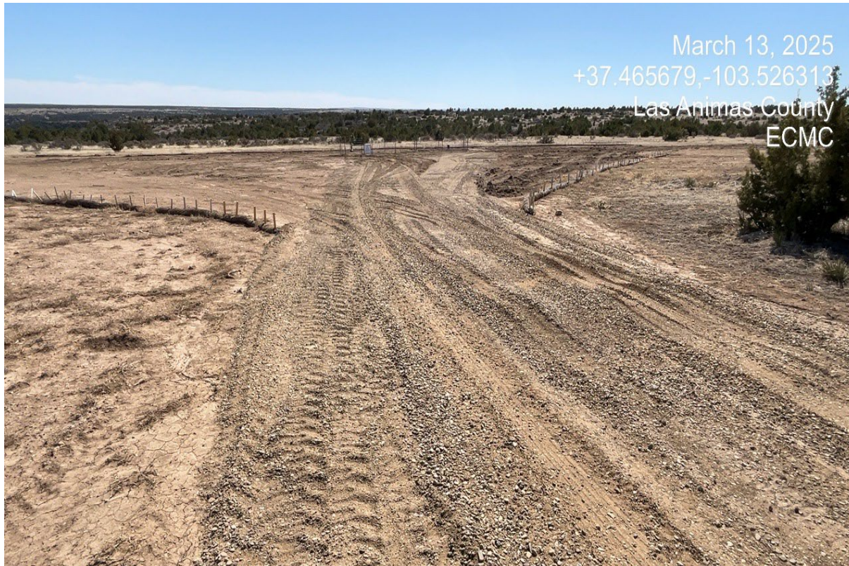
Photo 1. Facing south toward the access road and location. There has been roadbase applied along the road and wellsite.