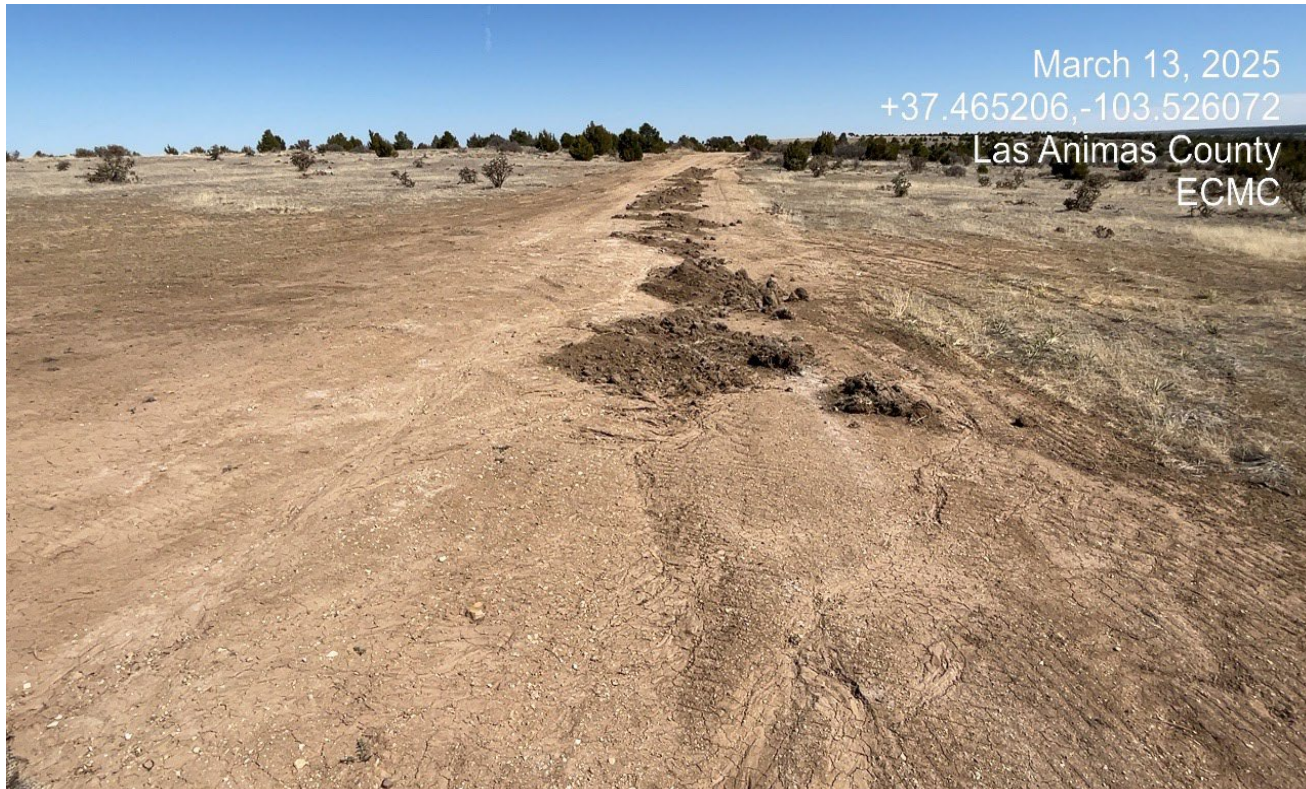
Photo 4. Facing east toward the flowline. There has been soil piles placed along the flowline in this area. This area will need to be graded and reseeded.